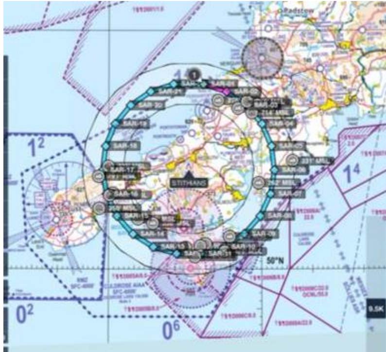
Chart 2 – 20 Km