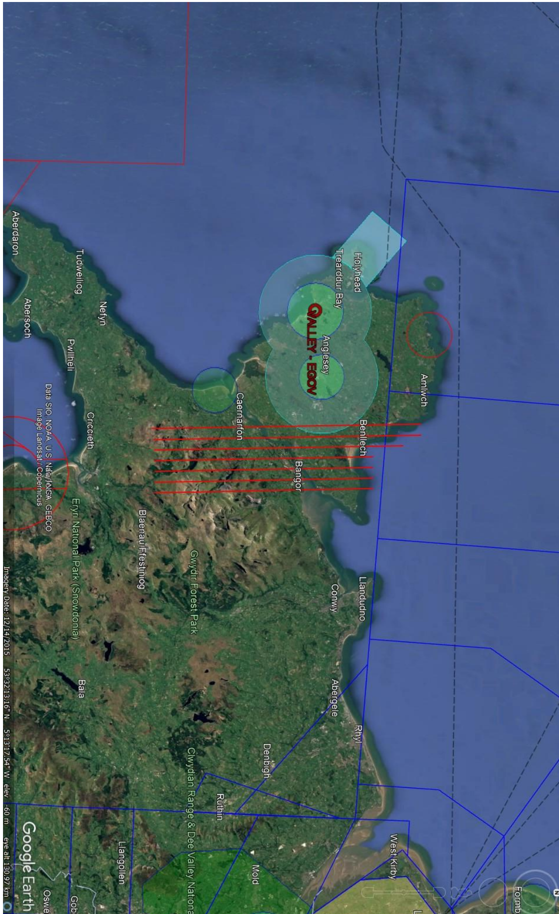
Chart 2 – Satellite image with flight lines