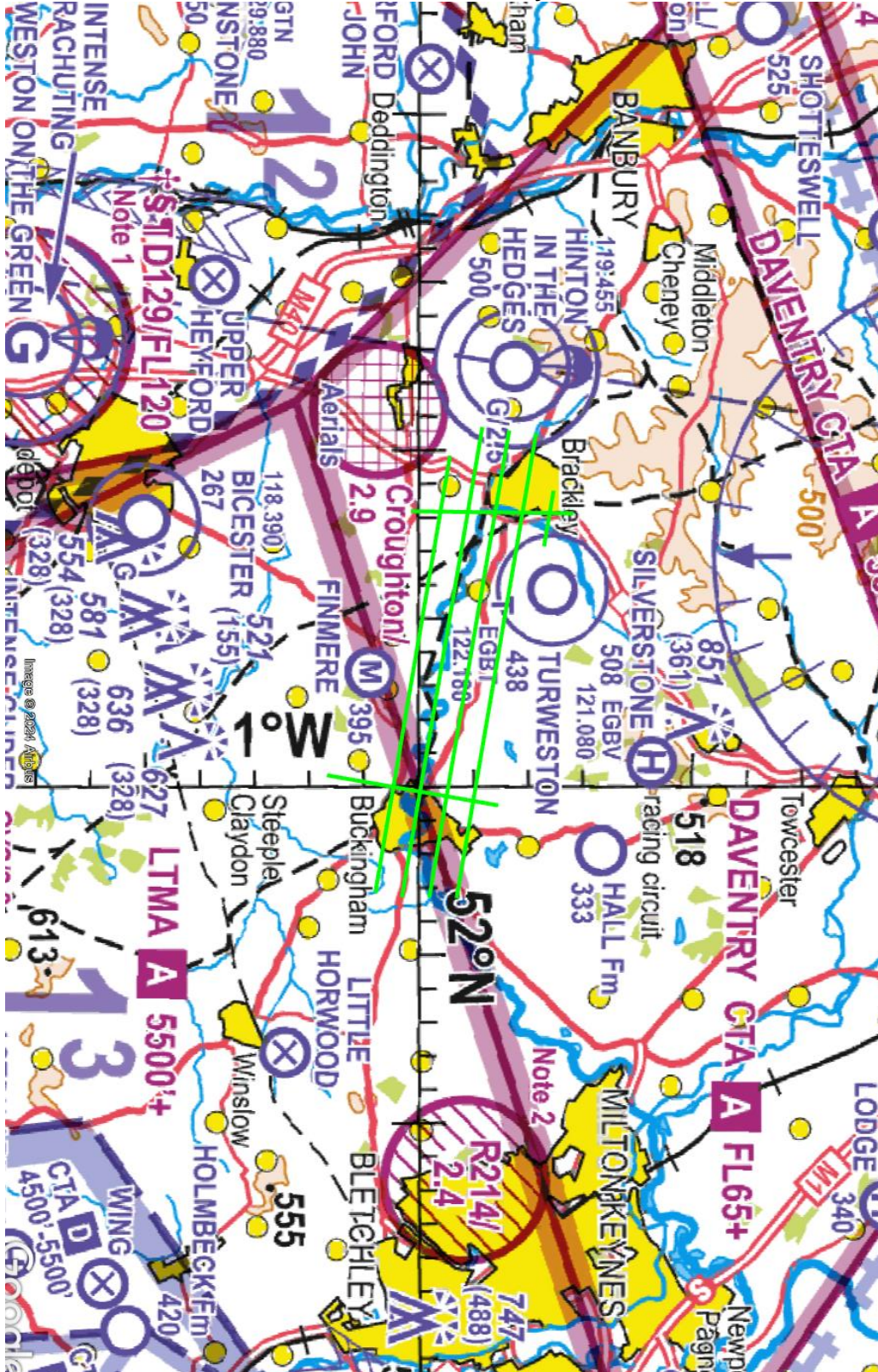
Chart 1 - Aerial survey lines

27. A chart highlighting the area of operation are shown below. This is for illustrative purposes only and not for operational planning.