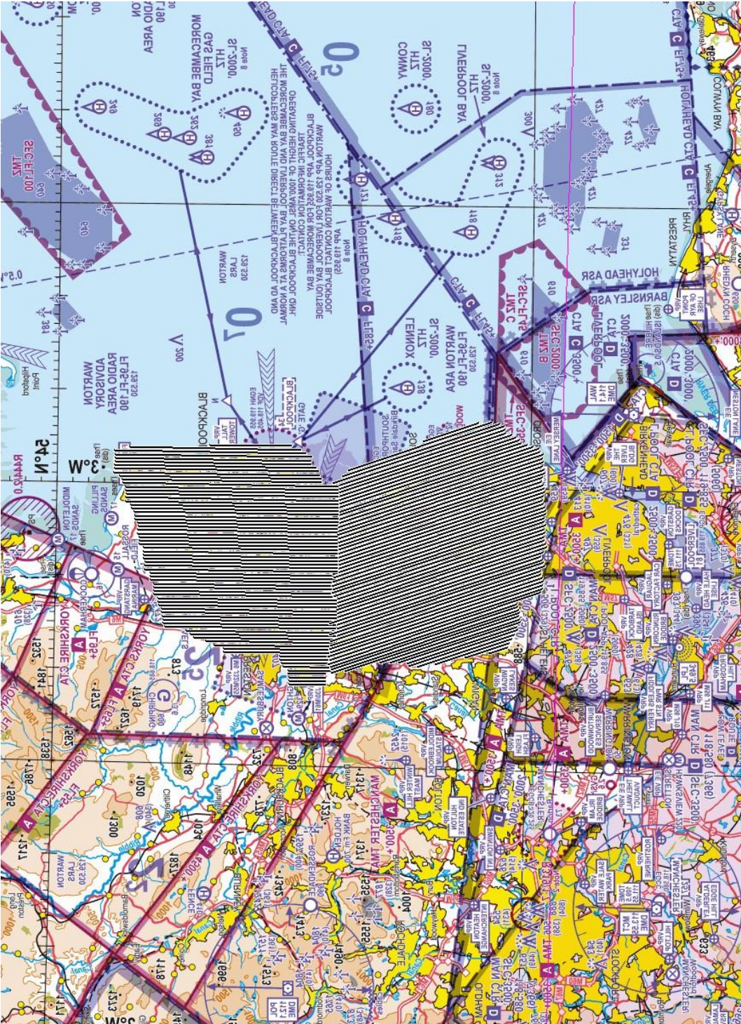
Chart 1 – Overview

25. Charts highlighting the area of operation are shown below. These are for illustrative purposes only and not for operational planning. Flight lines do not include a 5km procedural teardrop turn at the end of each run.