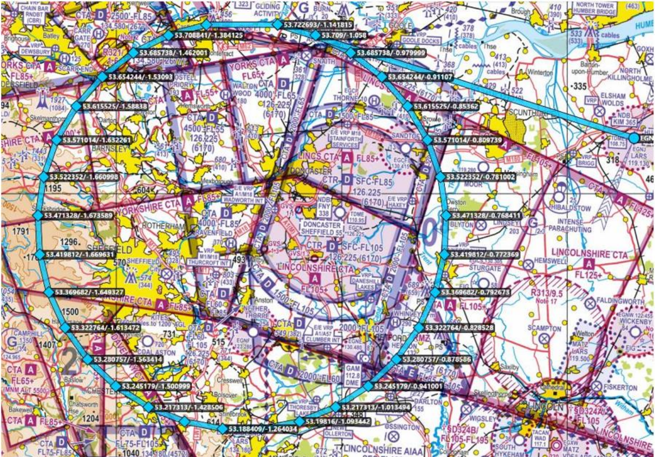
Chart 1 – 30km (16.2nm) Orbit of Clifton Mast 53.457323N / 1.221337W

24. Charts highlighting the area of operation are shown below. These are for illustrative purposes only and not for operational planning.