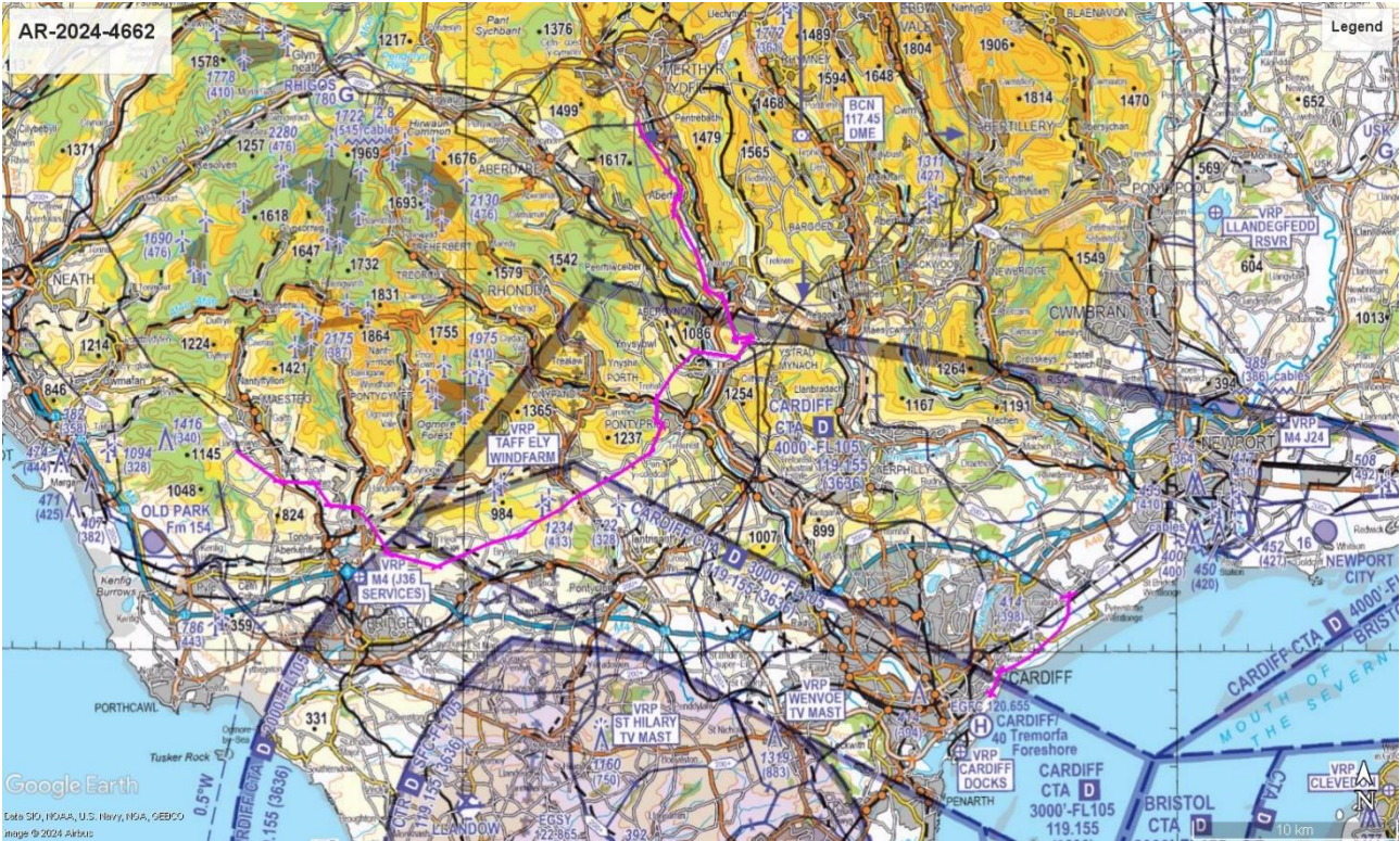
Chart 1 – Survey runs

24. Charts highlighting the area of operation are shown below. These are for illustrative purposes only and not for operational planning. Flight lines do not include a 5km procedural teardrop turn at the end of each run.