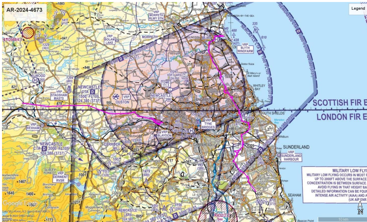
Chart 1 – Survey runs

24. Charts highlighting the area of operation are shown below. These are for illustrative purposes only and not for operational planning. Flight lines do not include a 5km procedural teardrop turn at the end of each run.