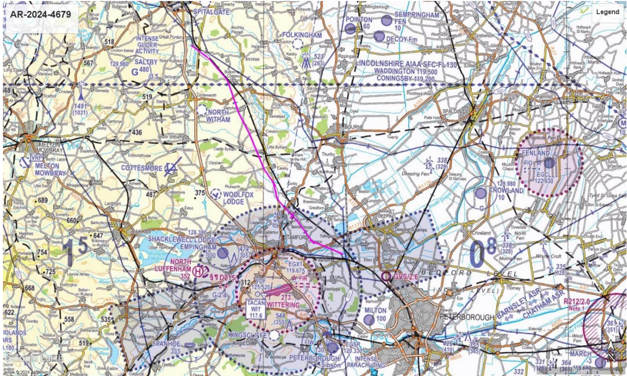
Chart 1 – Survey runs

24. Charts highlighting the area of operation are shown below. These are for illustrative purposes only and not for operational planning. Flight lines do not include a 5km procedural teardrop turn at the end of each run.