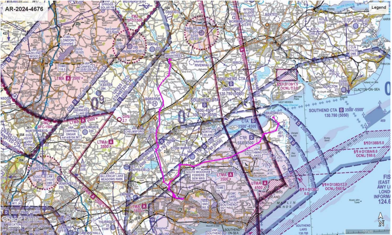
Chart 1 – Survey runs

24. Charts highlighting the area of operation are shown below. These are for illustrative purposes only and not for operational planning. Flight lines do not include a 5km procedural teardrop turn at the end of each run.