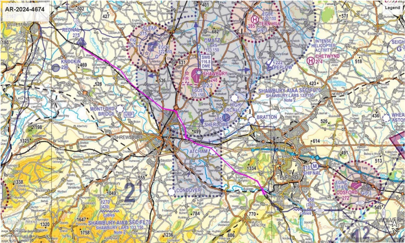
Chart 1 – Survey runs

24. Charts highlighting the area of operation are shown below. These are for illustrative purposes only and not for operational planning. Flight lines do not include a 5km procedural teardrop turn at the end of each run.