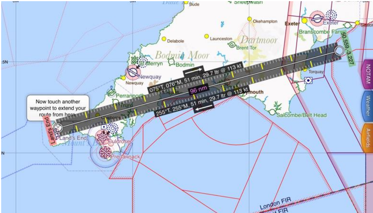
Chart 1 – 075 Radial

26. Charts highlighting the area of operation are shown below. These are for illustrative purposes only and not for operational planning.