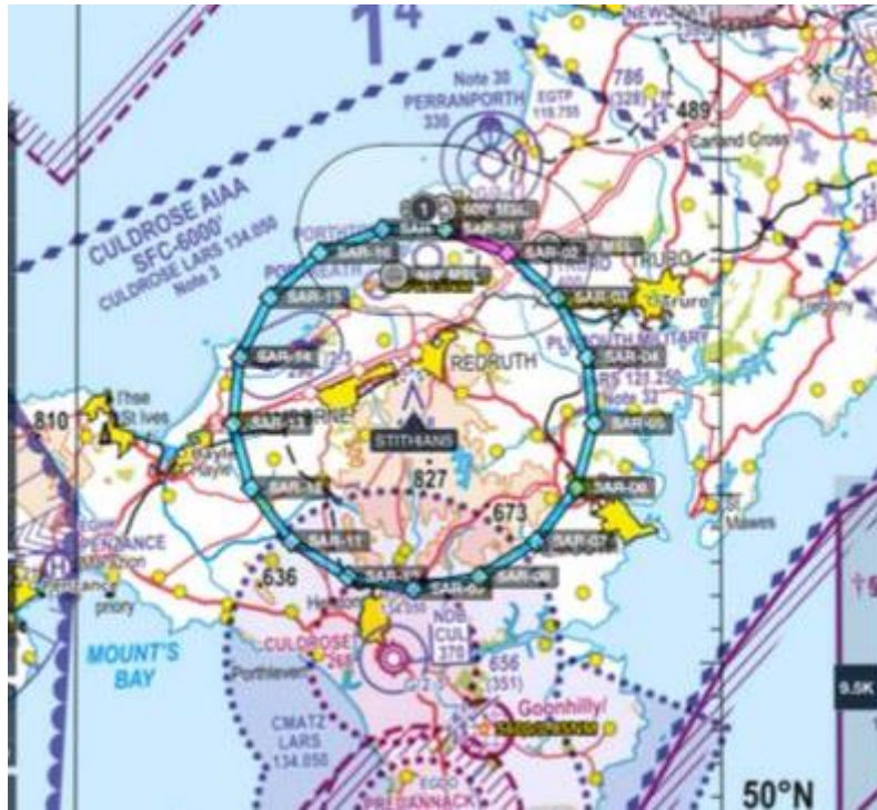
Chart 1 – 10 Km

32. Charts highlighting the area of operation are shown below. These are for illustrative purposes only and not for operational planning.