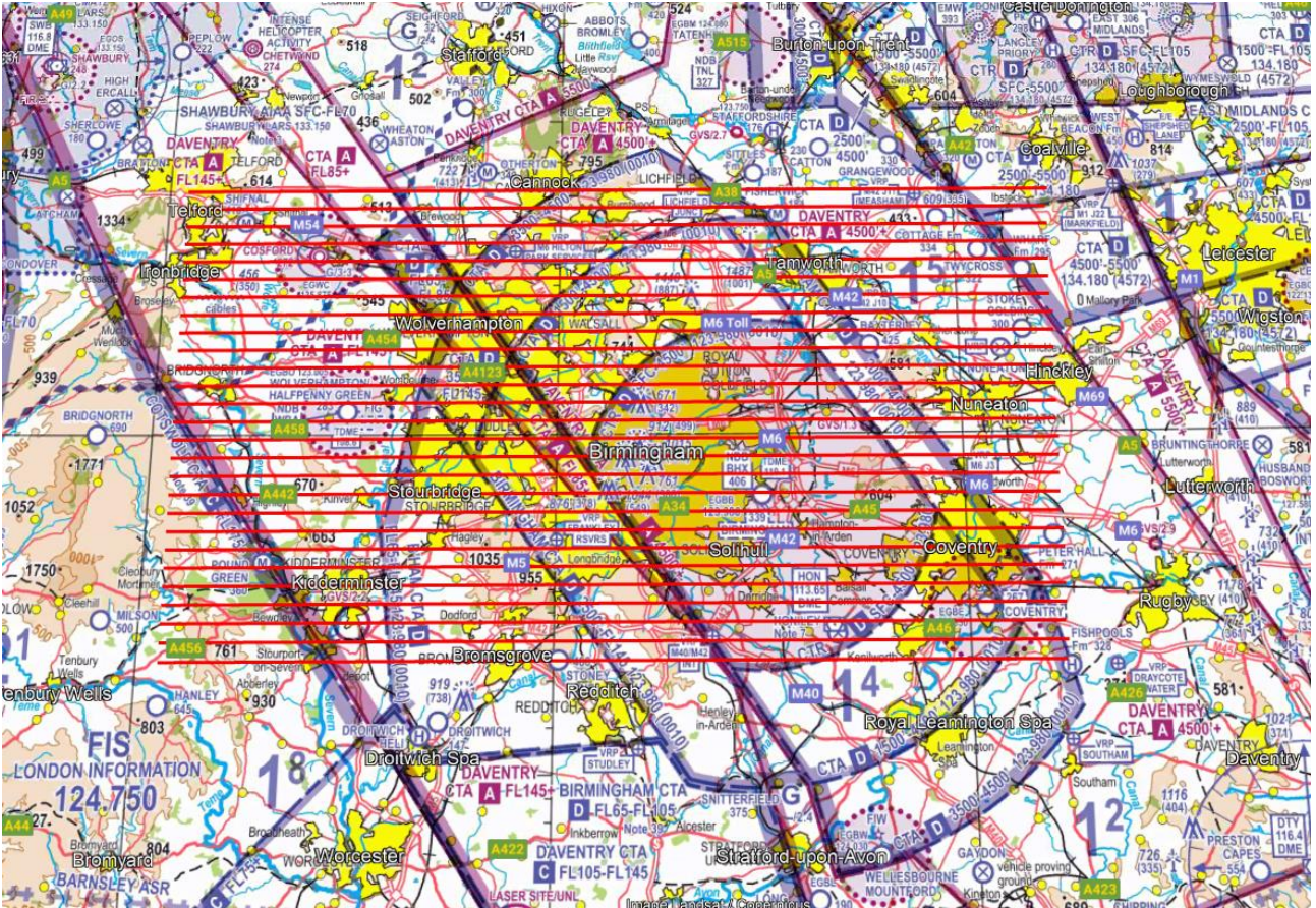
Chart 1 – Overview

28. Charts highlighting the area of operation are shown below. These are for illustrative purposes only and not for operational planning.