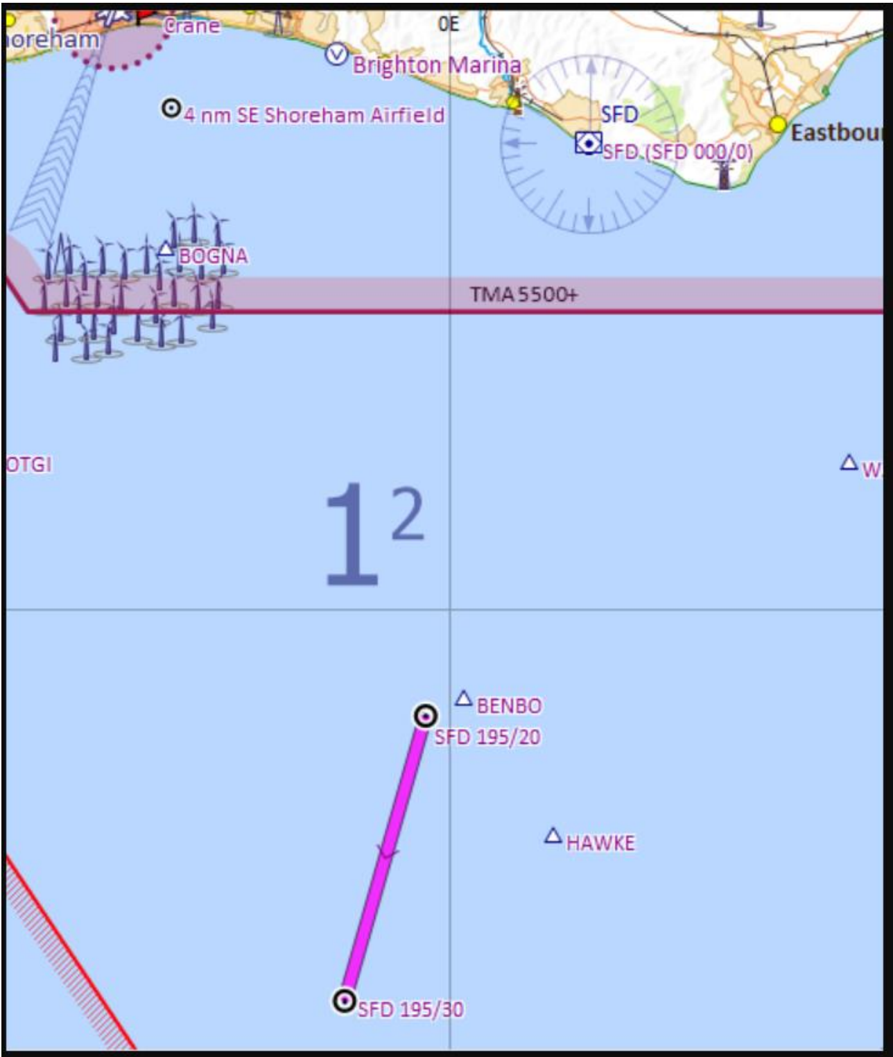
Chart 1 – Serial A1

29. Charts highlighting the area of operation are shown below. These are for illustrative purposes only and not for operational planning.