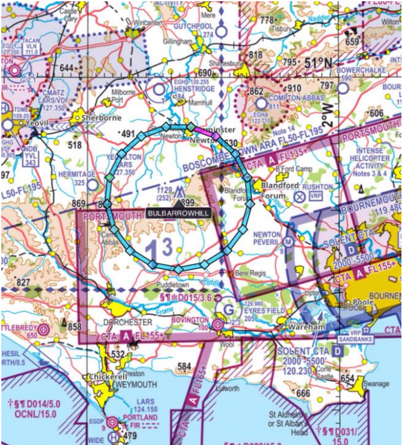
Chart 1 – 10 Km

33. Charts highlighting the area of operation are shown below. These are for illustrative purposes only and not for operational planning.