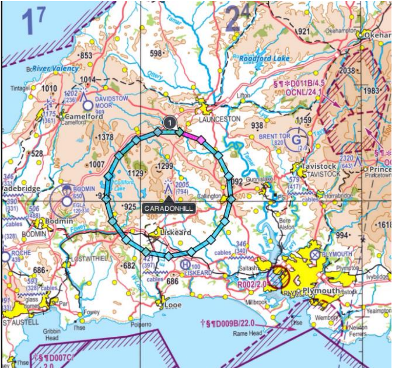
Chart 1 – 10 Km

32. Charts highlighting the area of operation are shown below. These are for illustrative purposes only and not for operational planning.