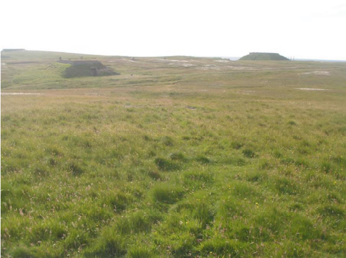
Plate 90: South-east facing view of the track (Site 86b) towards the CH Transmitter building (Site 85)