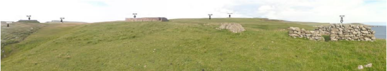
Plate 95: South-west-north panorama from a dry stone wall building (Site 432) showing the RAF structures around Site 85 and Site 86