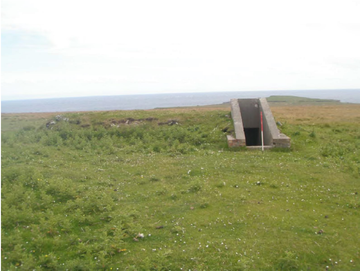
Plate 13: East facing view of a former air raid shelter (Site 135)