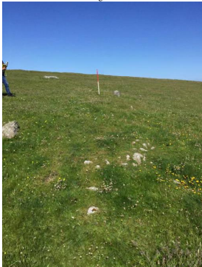
Plate 134: North-east facing view of probable degraded cairn (Site 278)