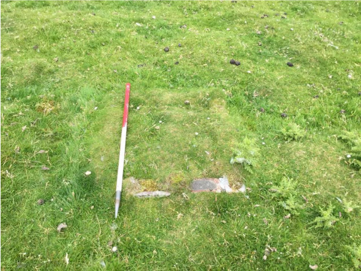
Plate 27: Detail of the overgrown brick structure at Site 449