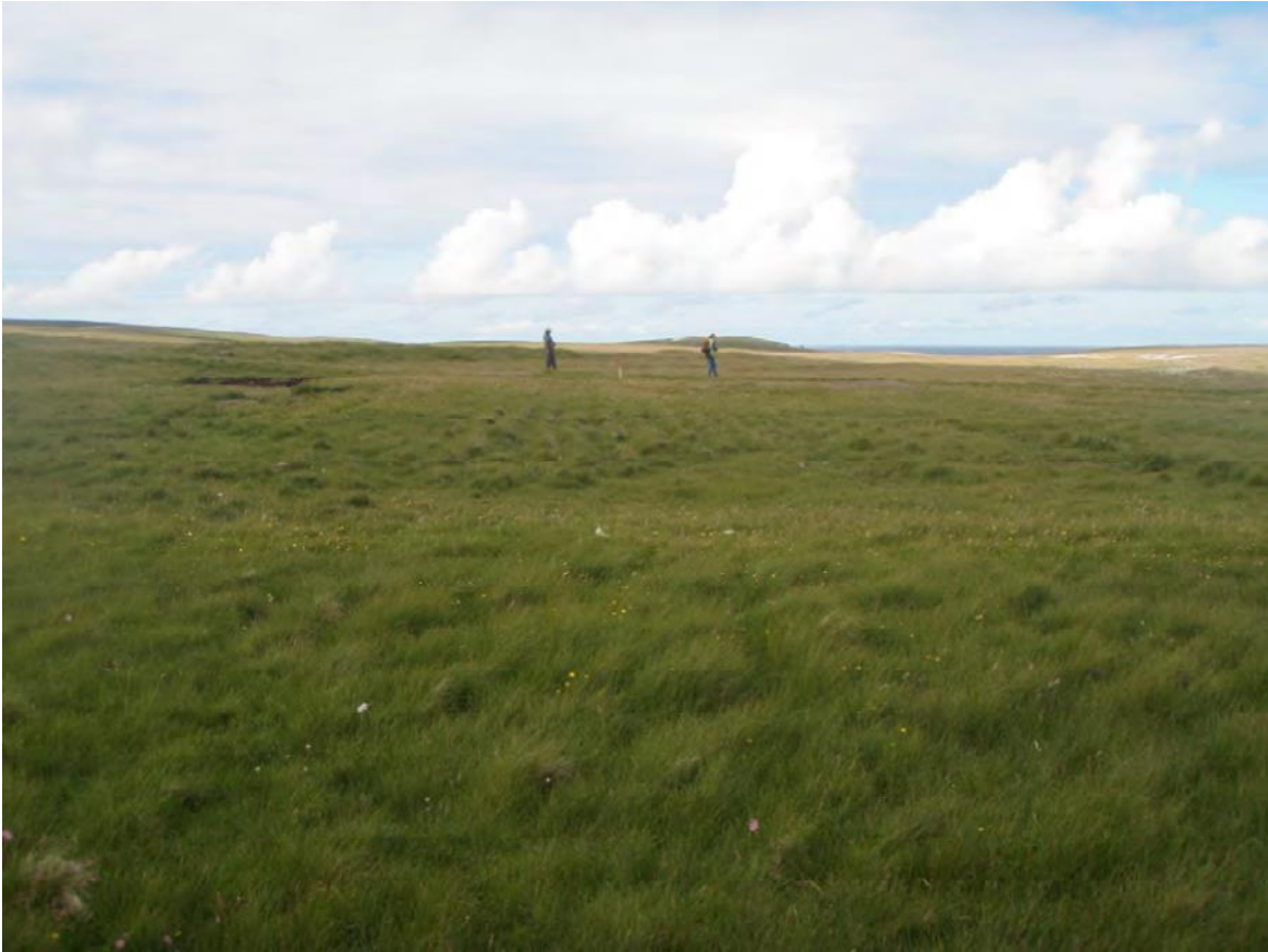
Plate 65: North facing view of the overgrown remains of a billet block (Site 106)