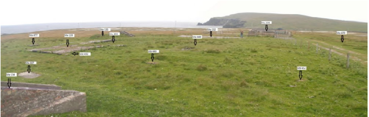
Plate 23: South-east facing view of the recreational area (Site 133) from former air raid shelter (Site 134)