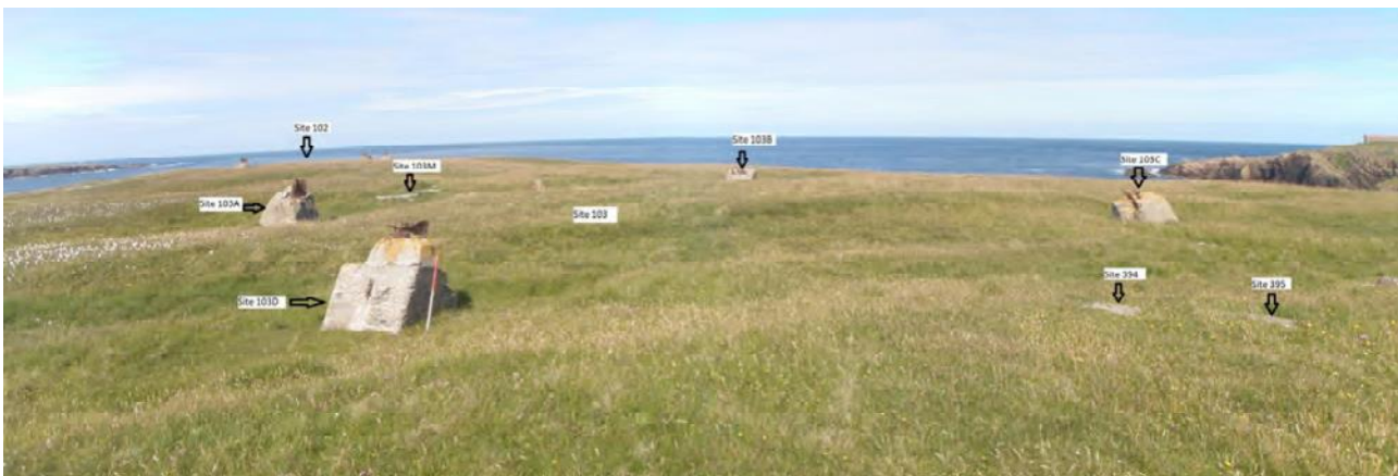
Plate 86: North-east facing view of a mast base (centred Site 103)