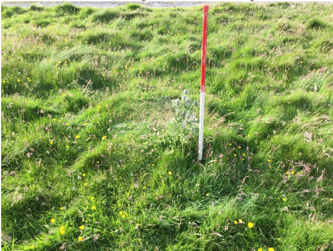
Plate 76: South facing detail of an overgrown concrete base (Site 426)