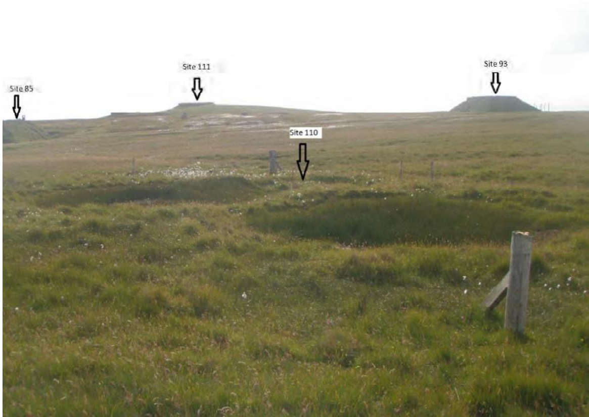
Plate 71: East facing view of two conjoined bomb craters (Site 110) with the CH generator (Site 93), Transmitter (Site 85) and Receiver (Site 111) block in rearground