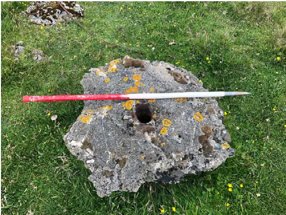
Plate 82: Detail of Site 851, a concrete block within the vicinity of the CH Transmitter block (Site 85)