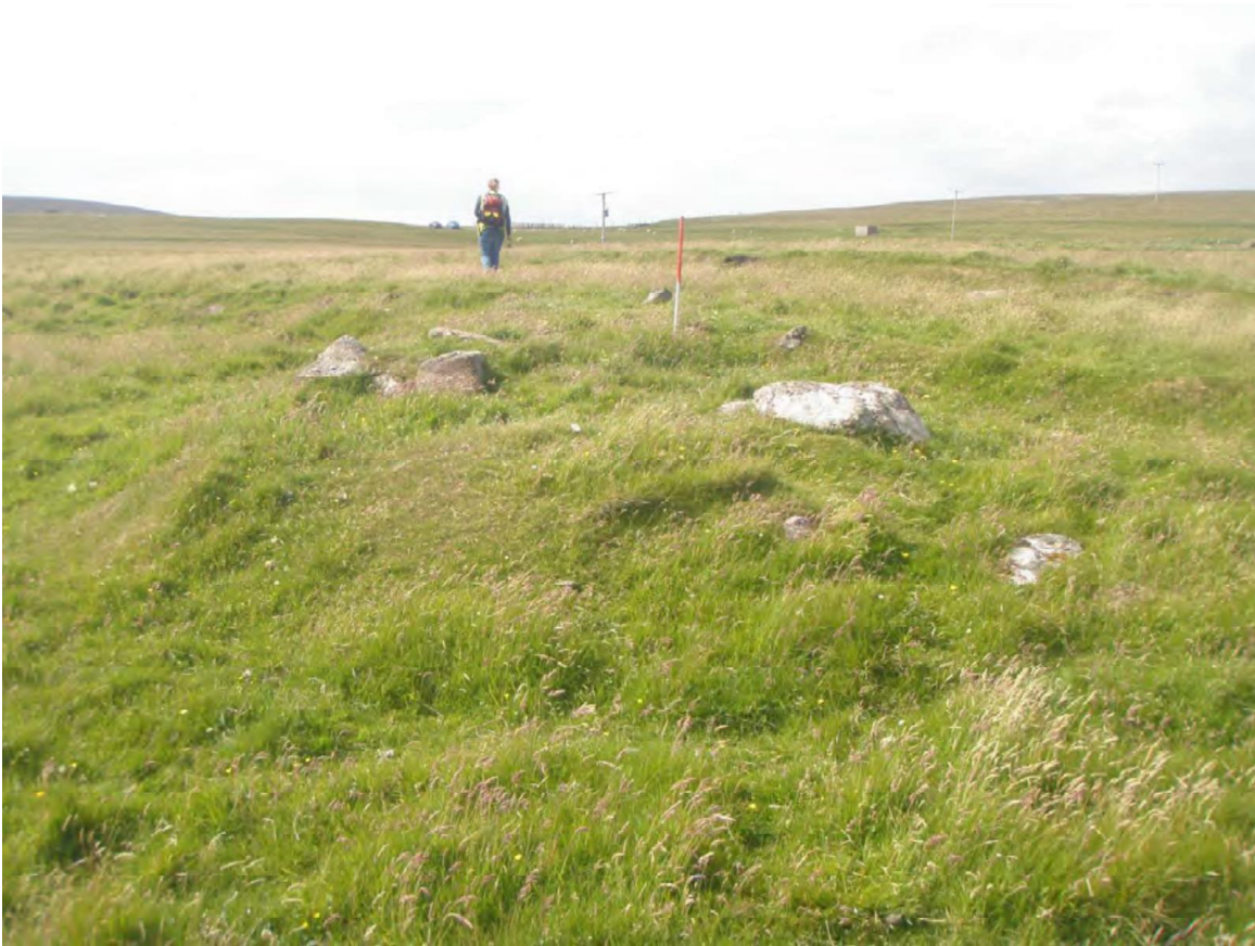
Plate 61: South-west facing view of a small cairn (Site 9)