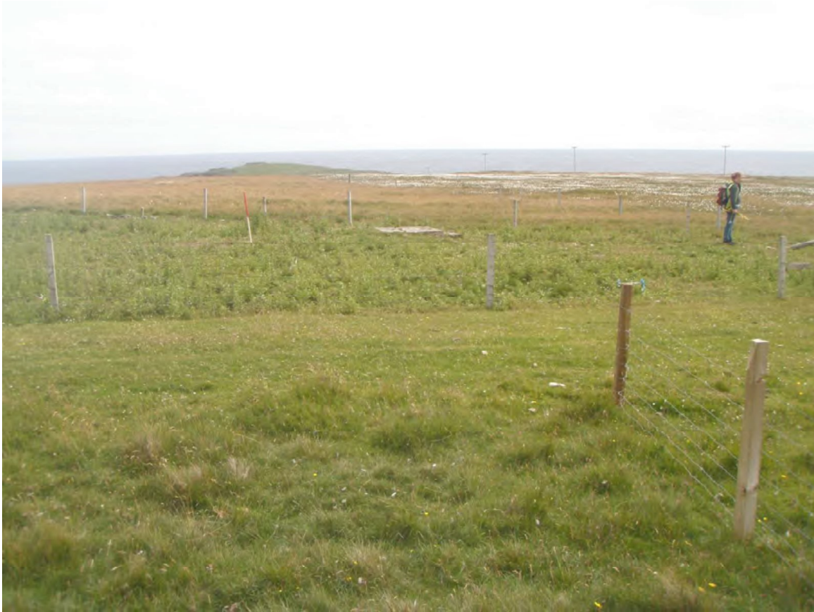
Plate 19: East facing view of part of the north-south aligned road which runs southwards from the track, with the foundation remains of the medical centre (Site 137) in the rearground