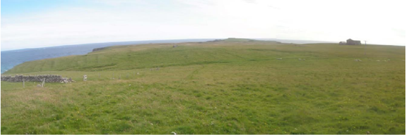
Plate 145: East facing view from the upstanding remains at Inner Skaw