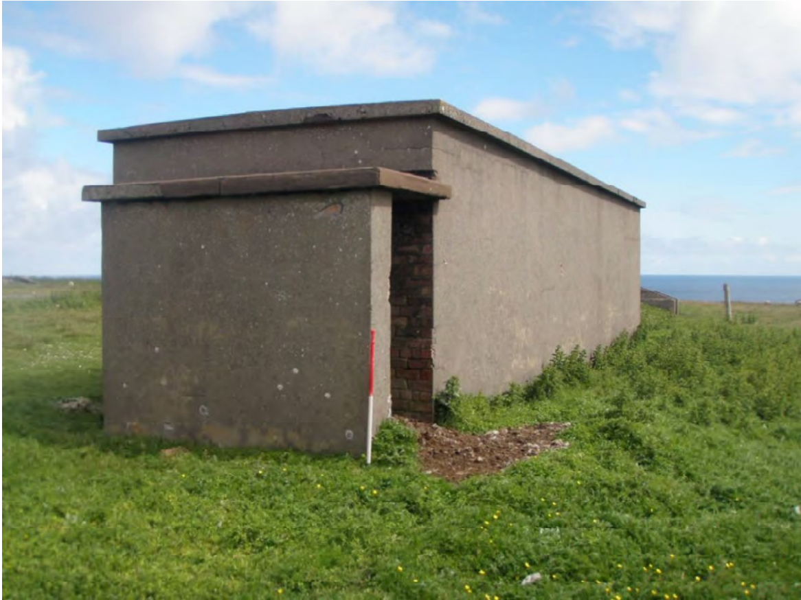
Plate 9: North-east facing view of the decontamination block (Site 130)