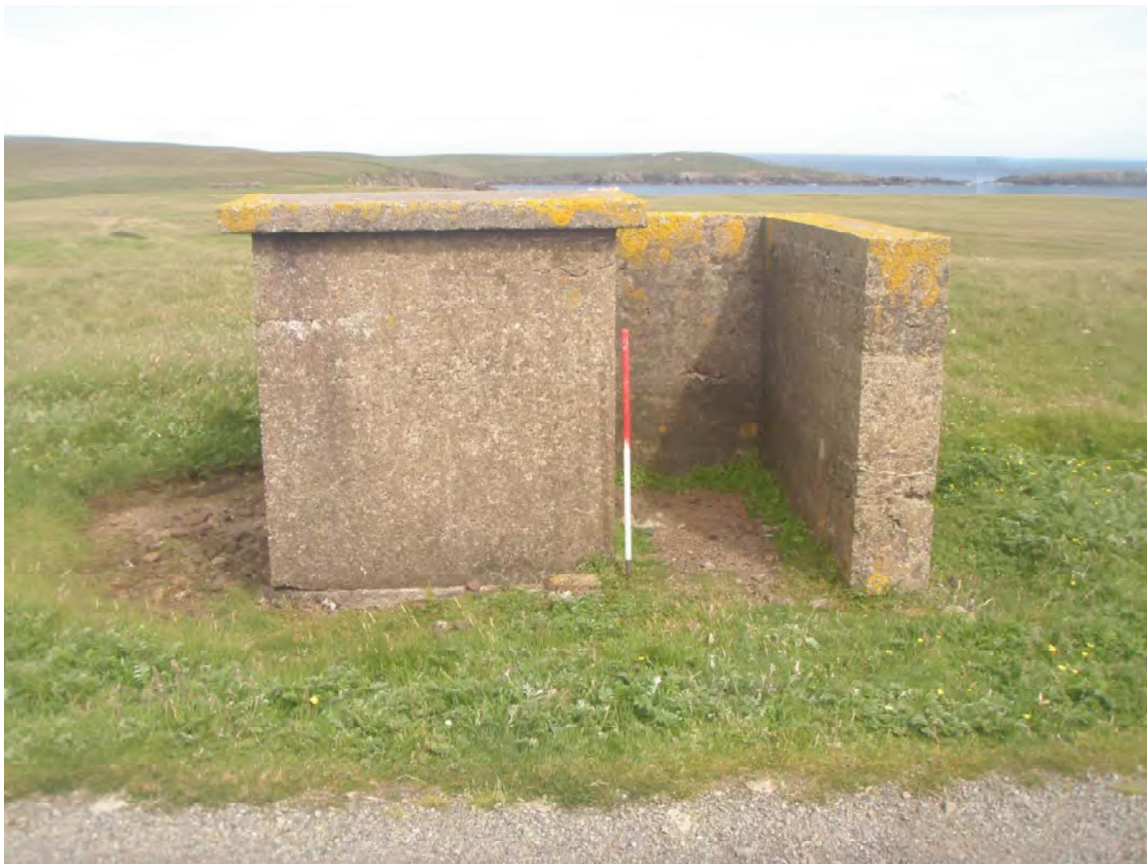
Plate 56: North facing view of guard hut (Site 82)