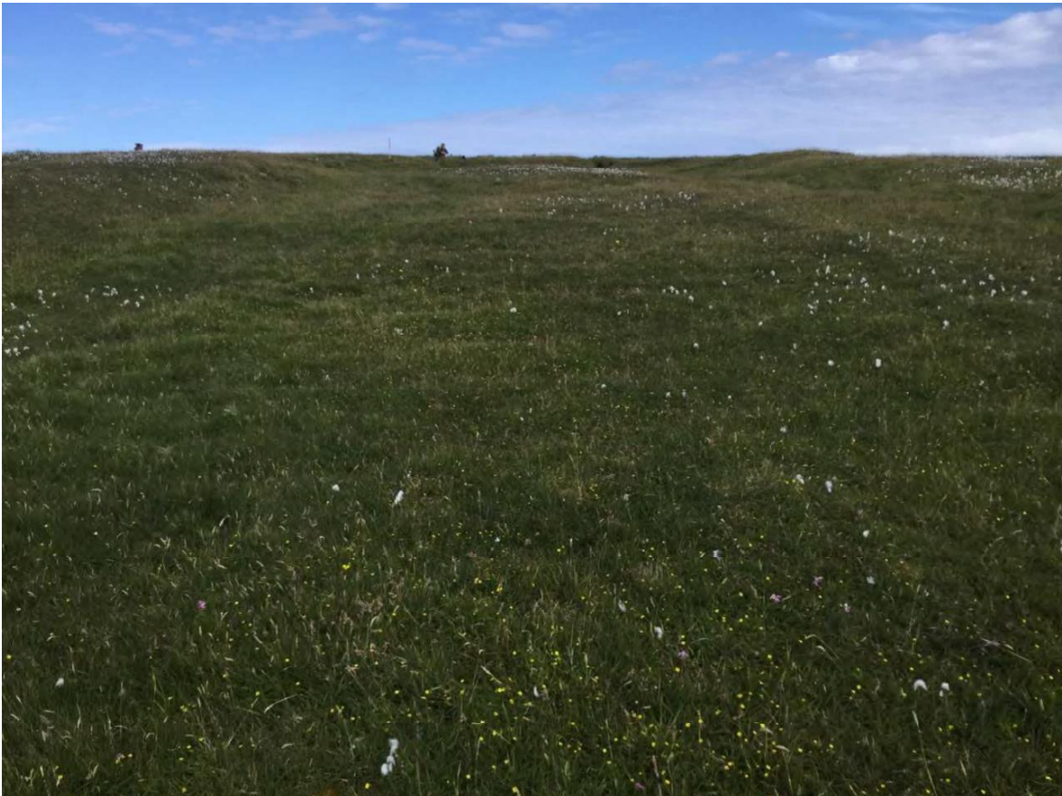
Plate 88: East facing view of excavated area (Site 373)