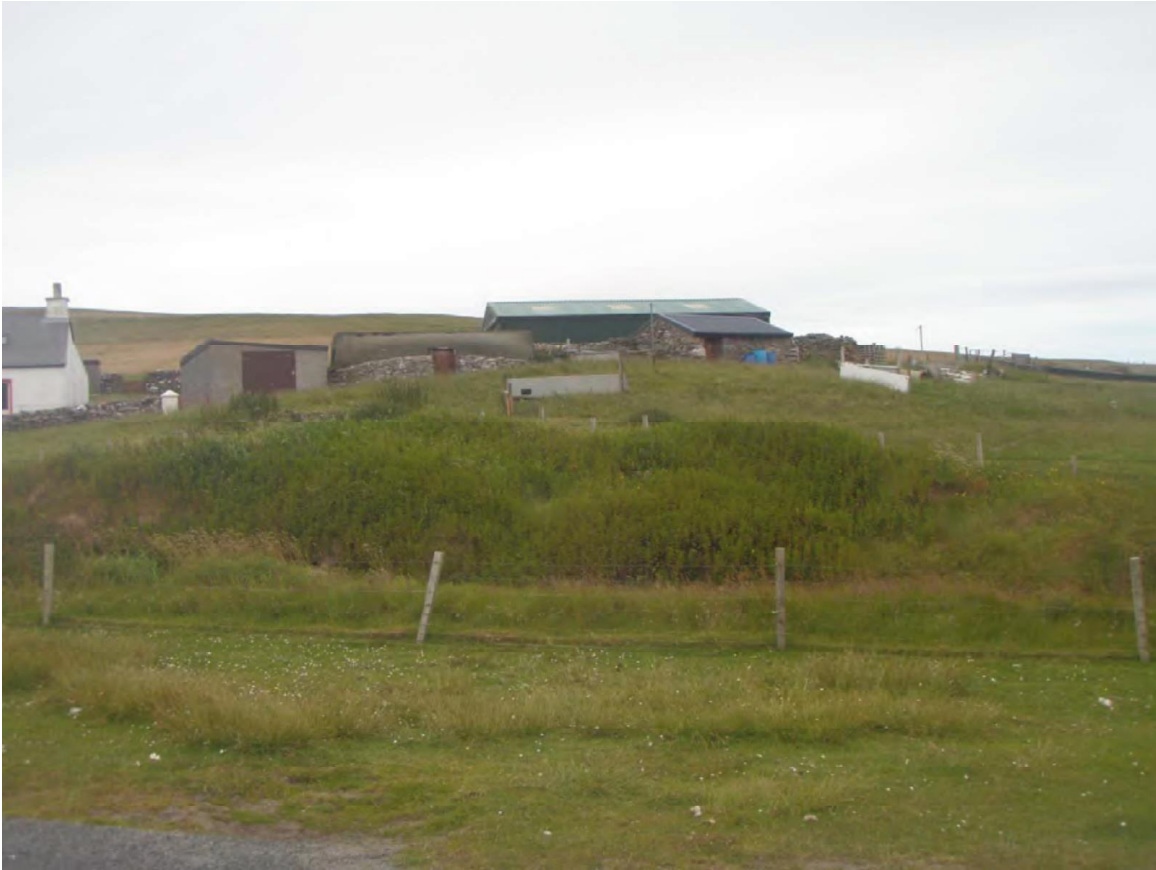
Plate 149: North facing view of the Category C Listed Boat-roofed shed (Site 6)