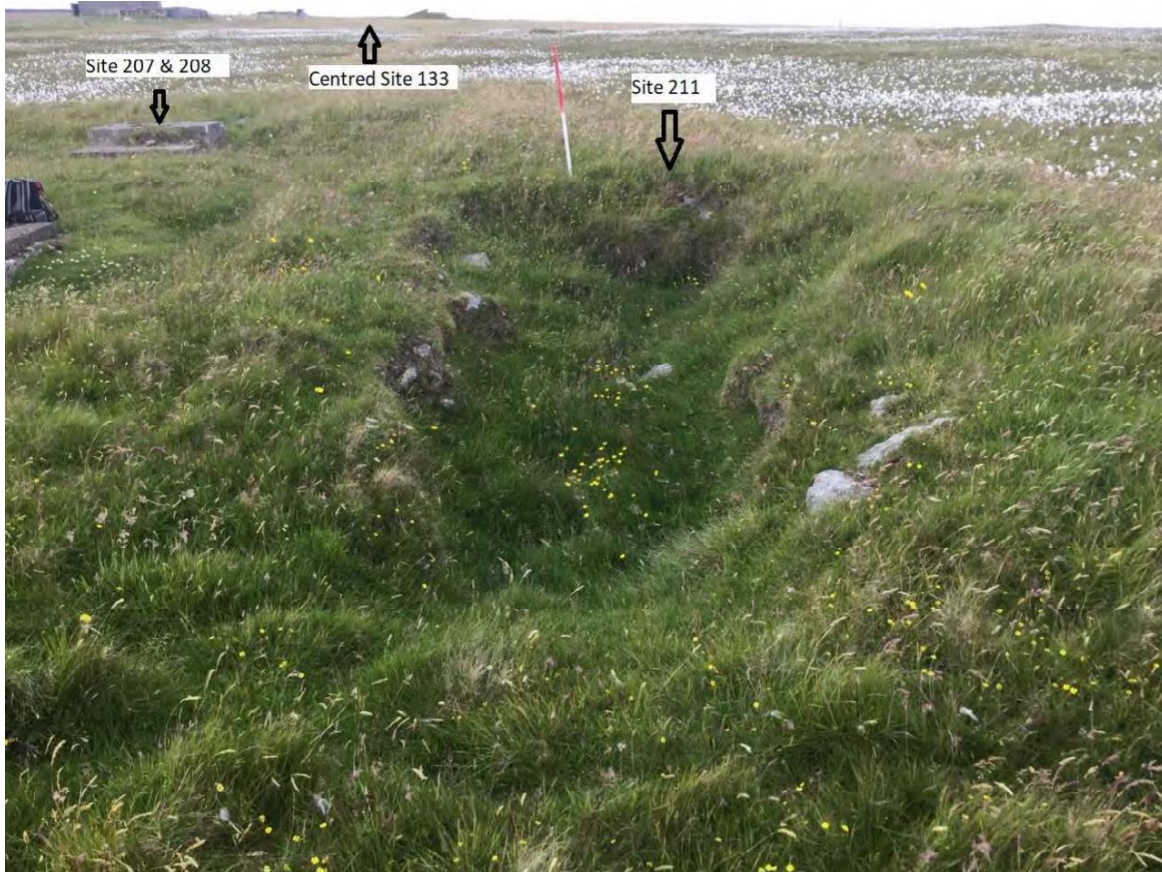
Plate 37: North facing view of probable bomb crater (Site 211)