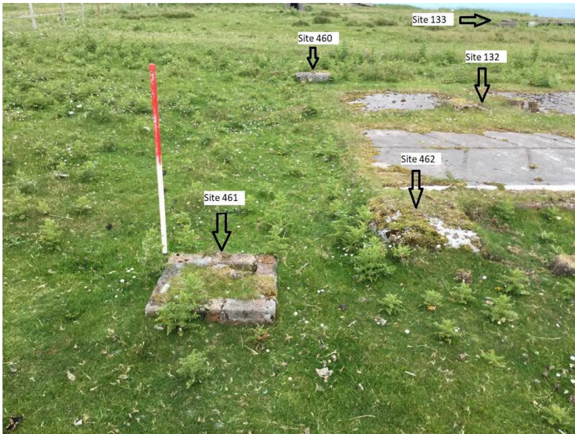
Plate 31: North facing view of the small, square brick structure at Site 461. The ablutions block (Site 132) can be seen to the right and two concrete blocks (Site 460 & 462) are also visible