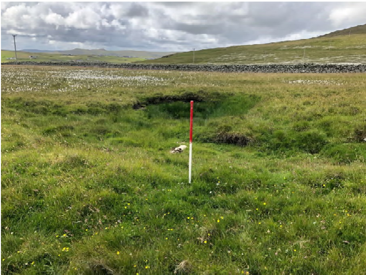
Plate 22: South-west facing view of a probable bomb crater (Site 117)