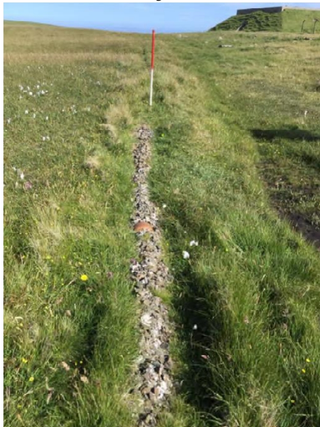
Plate 100: South-east facing view of pipe (Site 411) which may connect to the probable toilets (Sites 412-4)