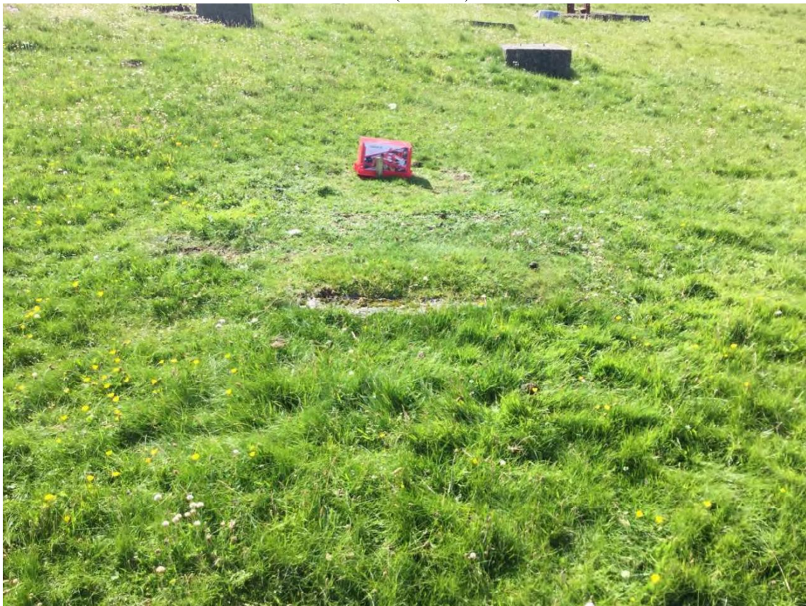
Plate 136: Detail of overgrown block (Site 237H) with another concrete block (Site 237G) in the rearground