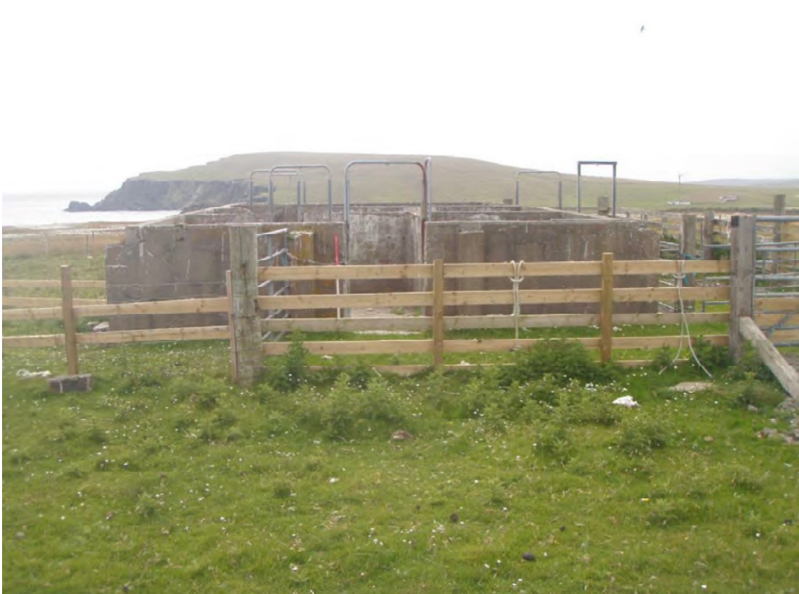
Plate 14: South facing view of former office block, which has been repurposed as a sheep pen