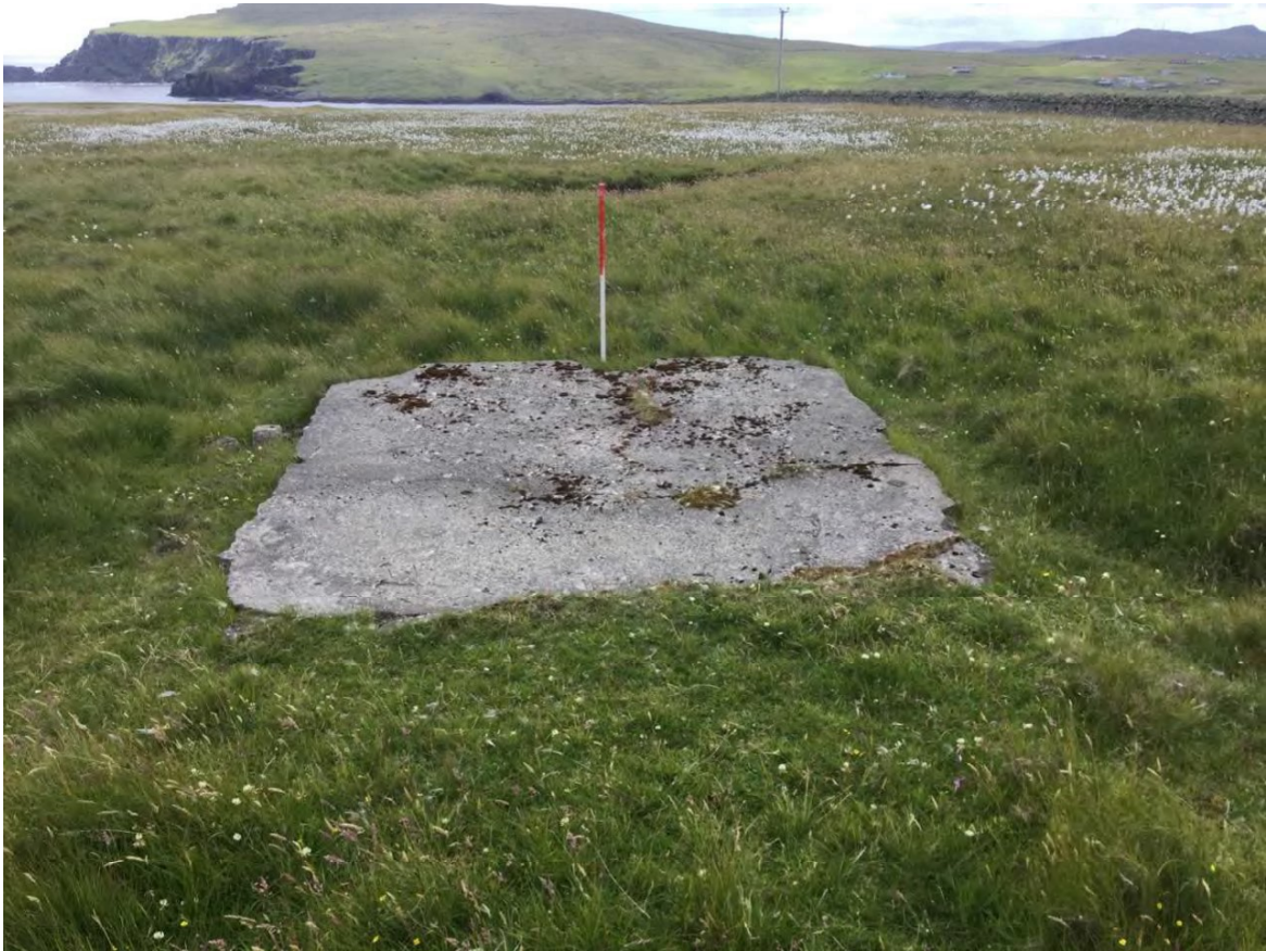
Plate 21: South facing view of concrete foundation block (Site 205)