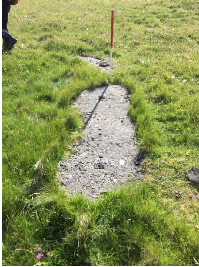
Plate 137: Detail of concrete block (Site 405)