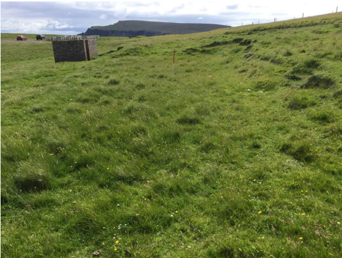
Plate 44: South facing view of platform (Site 228), with a probable air raid shelter (Site 71) at the southern end