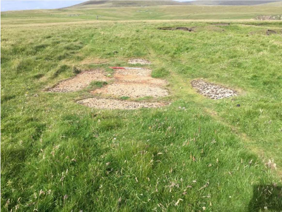
Plate 93: West facing view of concrete foundation (Site 433)