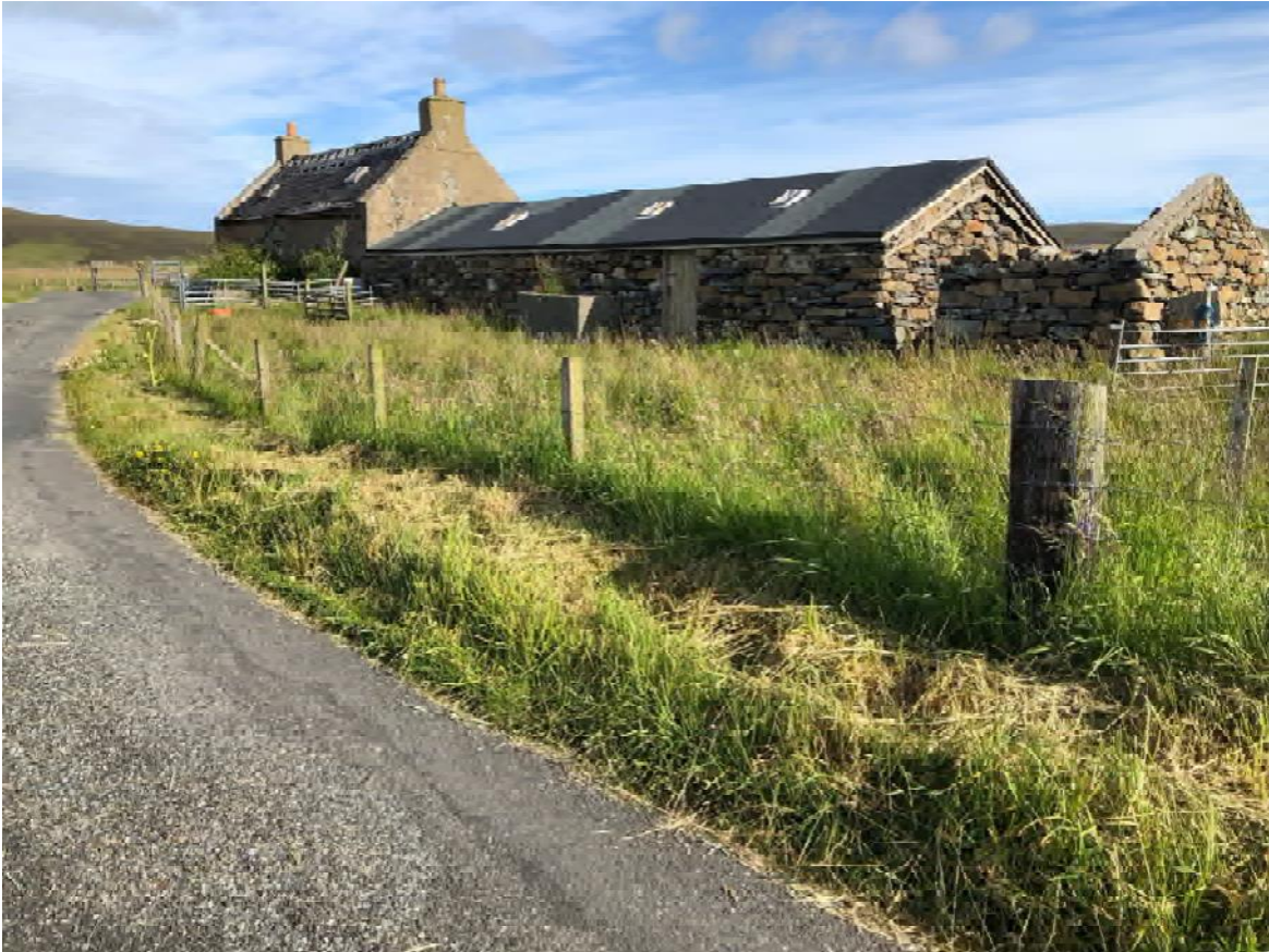
Plate 147: North-west facing view of the Category B Listed Papil (Site 5)