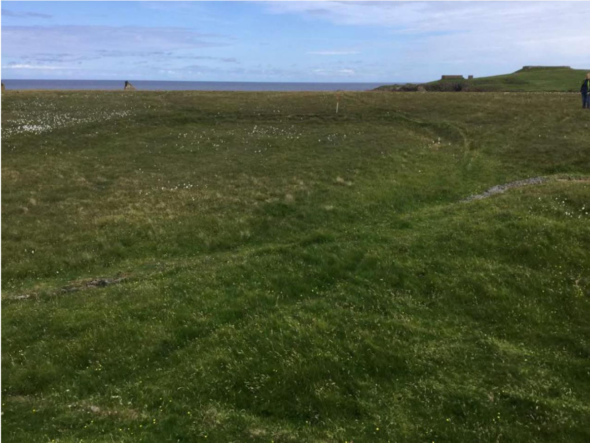
Plate 87: North-east facing view of excavated area (Site 321)