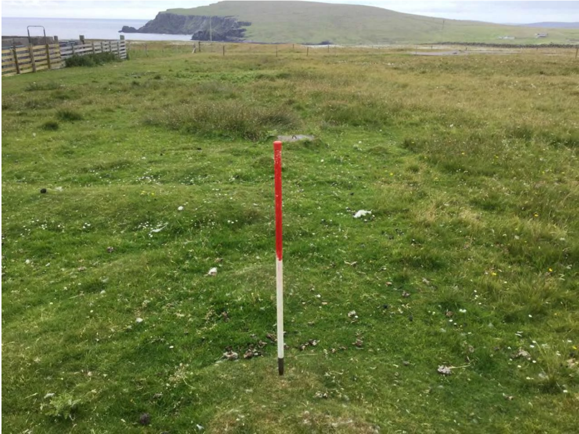
Plate 17: South facing view of a concrete block with tethering loop (Site 473), with another block (Site 471) in the rearground and a linear, overgrown earthwork (Site 472) is also visible