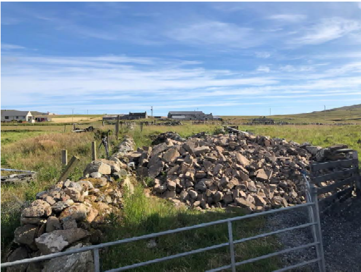
Plate 148: North-east facing view from the western elevation of the Category B Listed Papil (Site 5) towards the Site