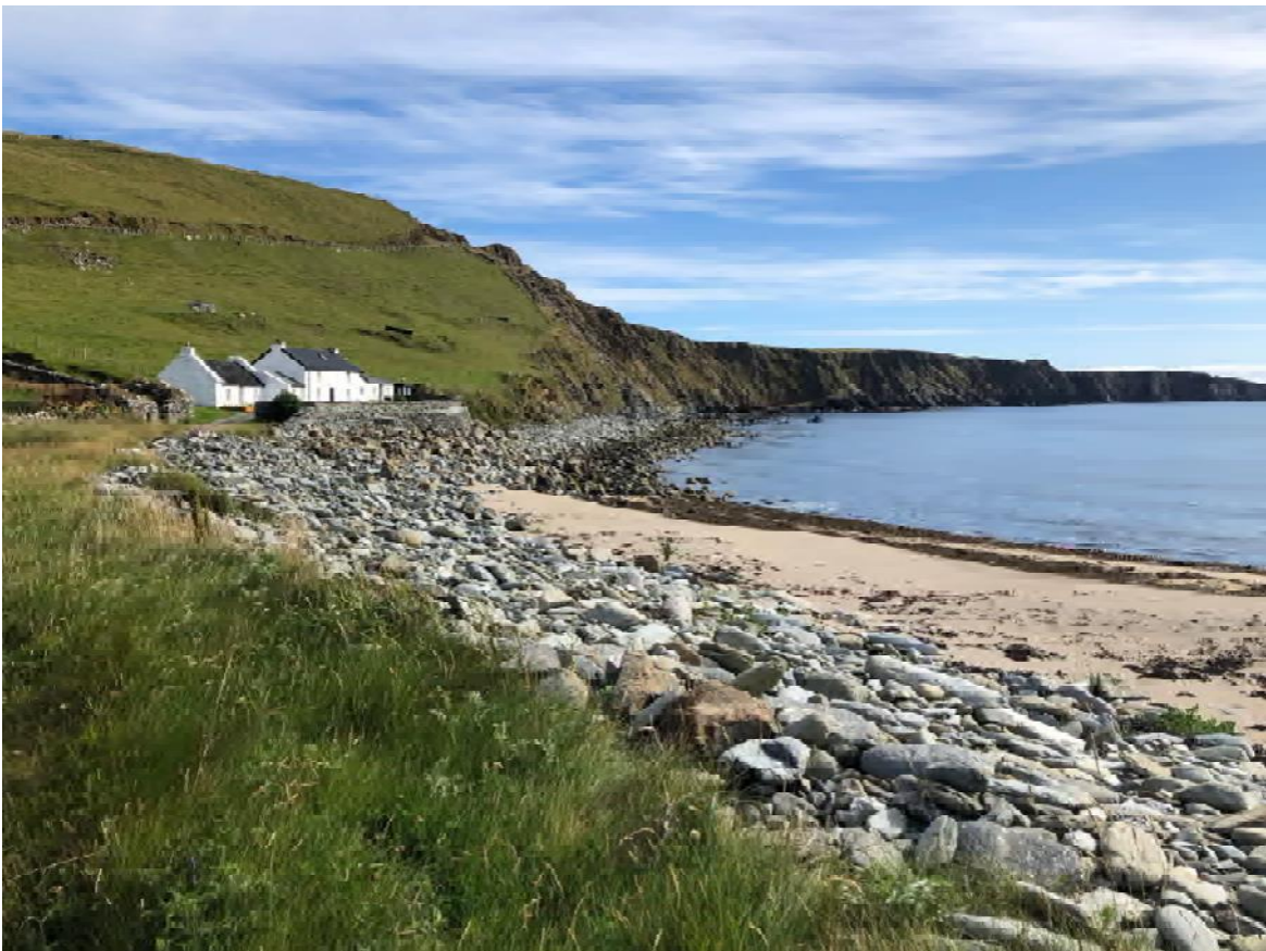
Plate 146: North-east facing view of the Category C Listed The Banks (Site 4)