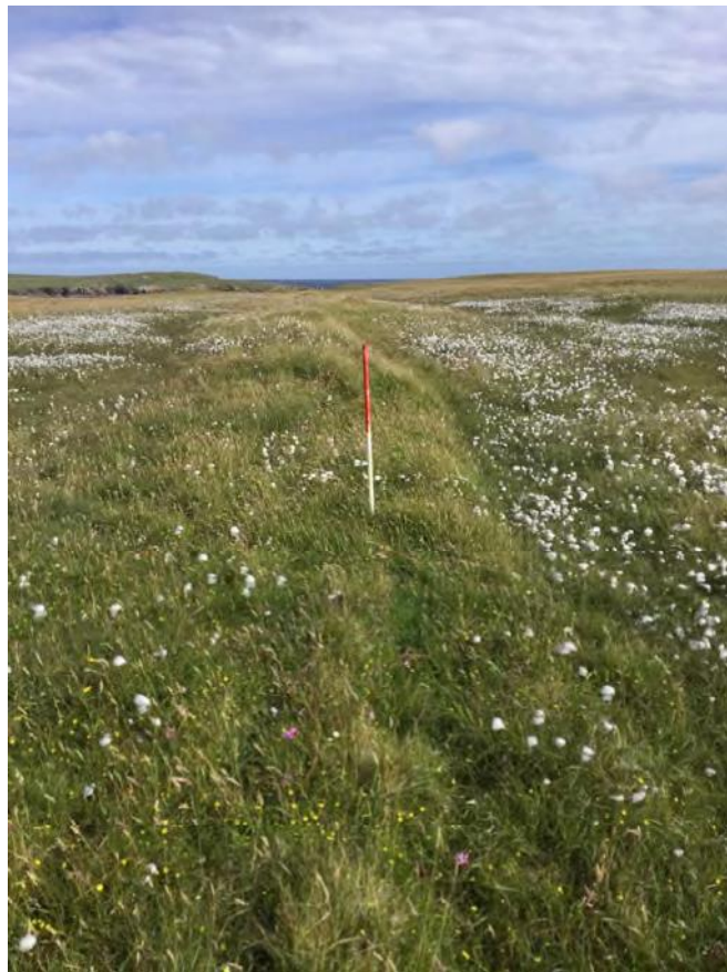
Plate 70: North facing view along a potential post-medieval field boundary (Site 434)