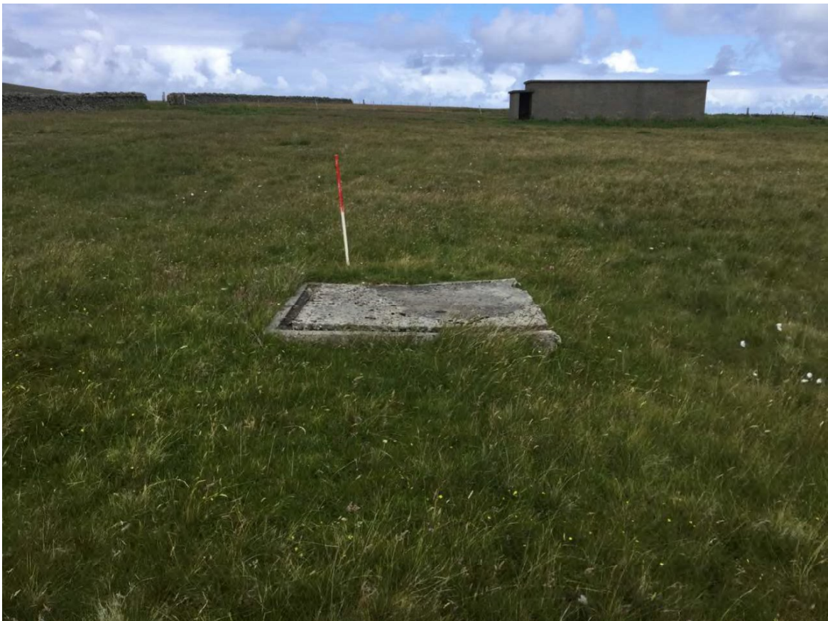
Plate 16: North facing view of a concrete foundation block. This example is Site 204a the northern most of three concrete blocks (Sites 204a-c)