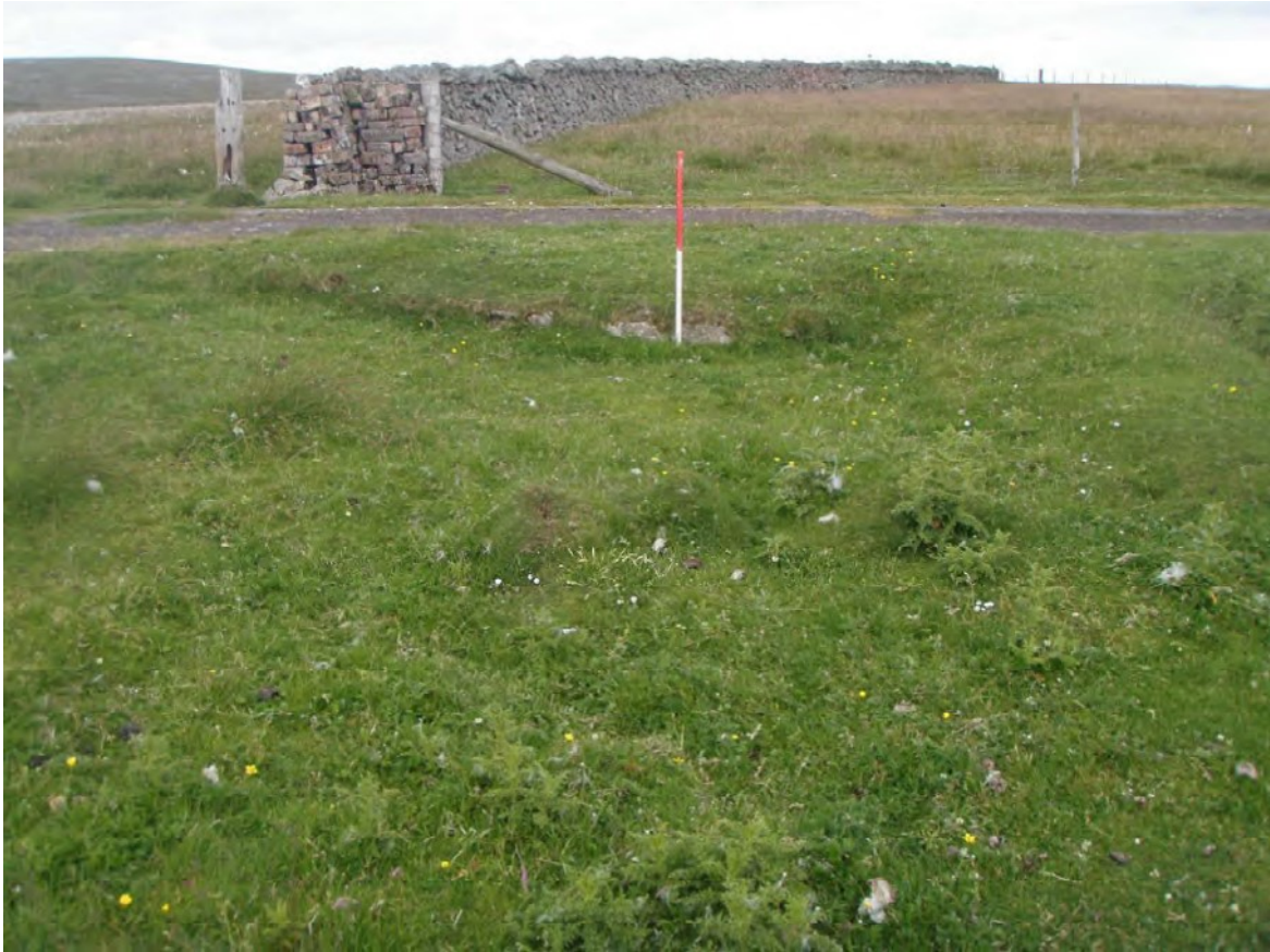
Plate 7: North facing view of the earthwork remains of the guard hut (Site 128)