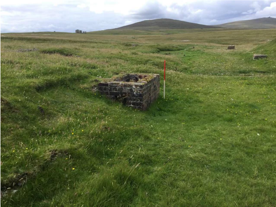
Plate 83: West facing view of a brick structure (Site 302) within the area encircled by Site 85b