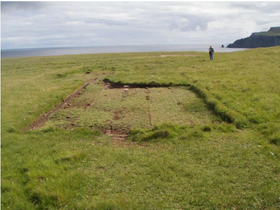
Plate 64: South-east facing view of an office, workshop and store (Site 109)