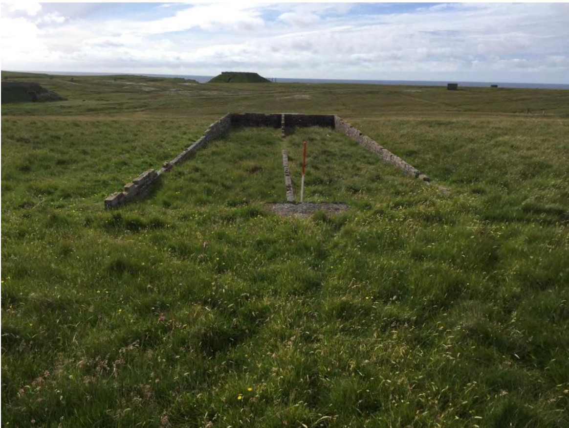
Plate 92: South-eastern view of a billet block (Site 86a)