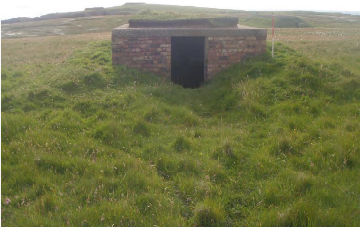
Plate 94: East facing view of a potential air raid shelter (Site 87)