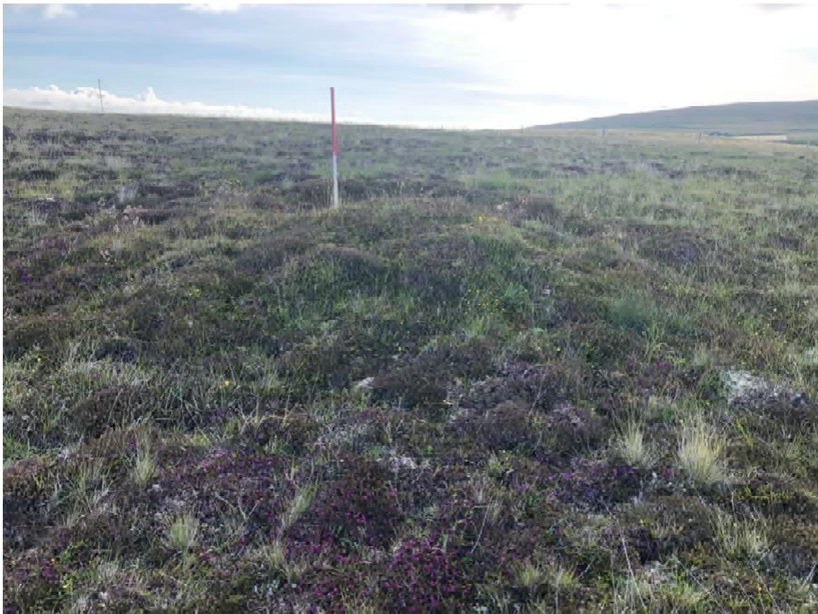
Plate 142: North-east facing view of quarry scoop (Site 401)