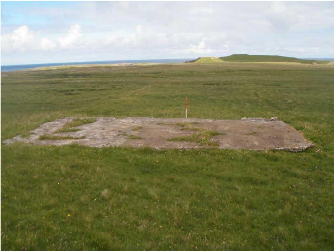
Plate 63: East facing view of an ablutions block (Site 108)