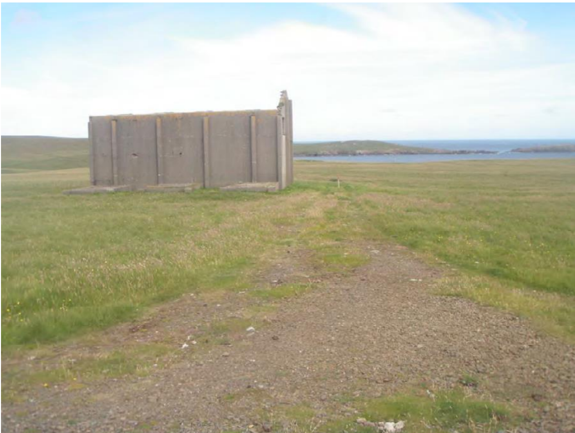
Plate 52: North facing view of the power house (Site 77), with its three concrete platforms and the northwards extending track (Site 77d)