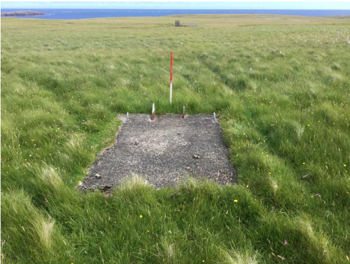
Plate 58: East facing view of concrete block (Site 443) towards Site 77b. Site 443 is an example of the concrete blocks found to the west, north and east of a 1950s mast base