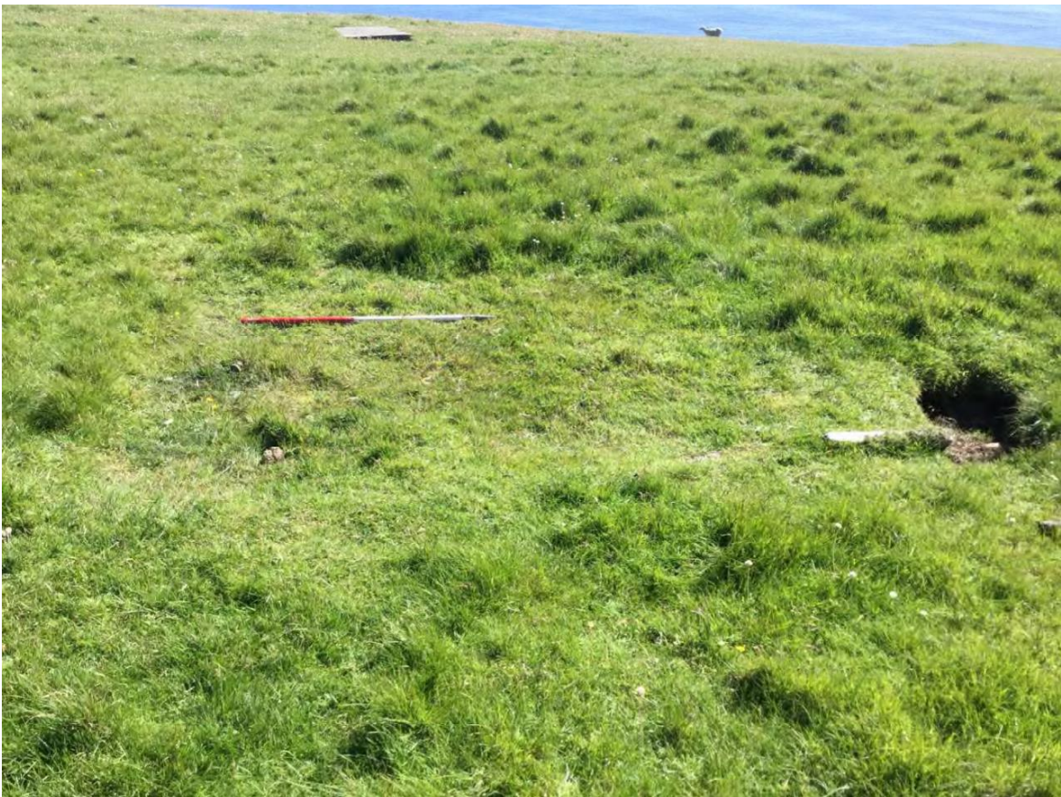
Plate 132: South facing view of overgrown concrete base (Site 262)