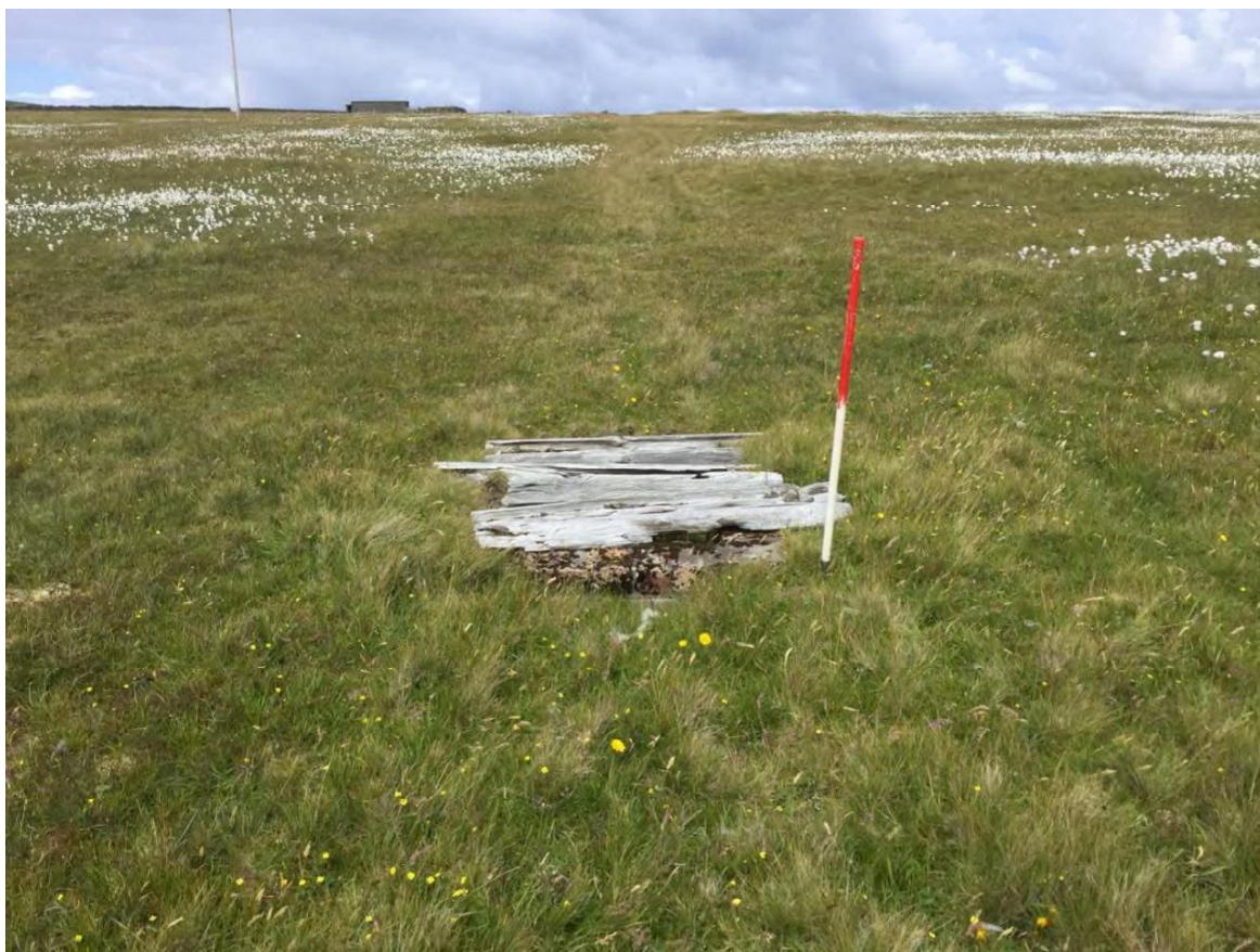
Plate 38: North facing view of wood plank covered, brick structure (Site 213)