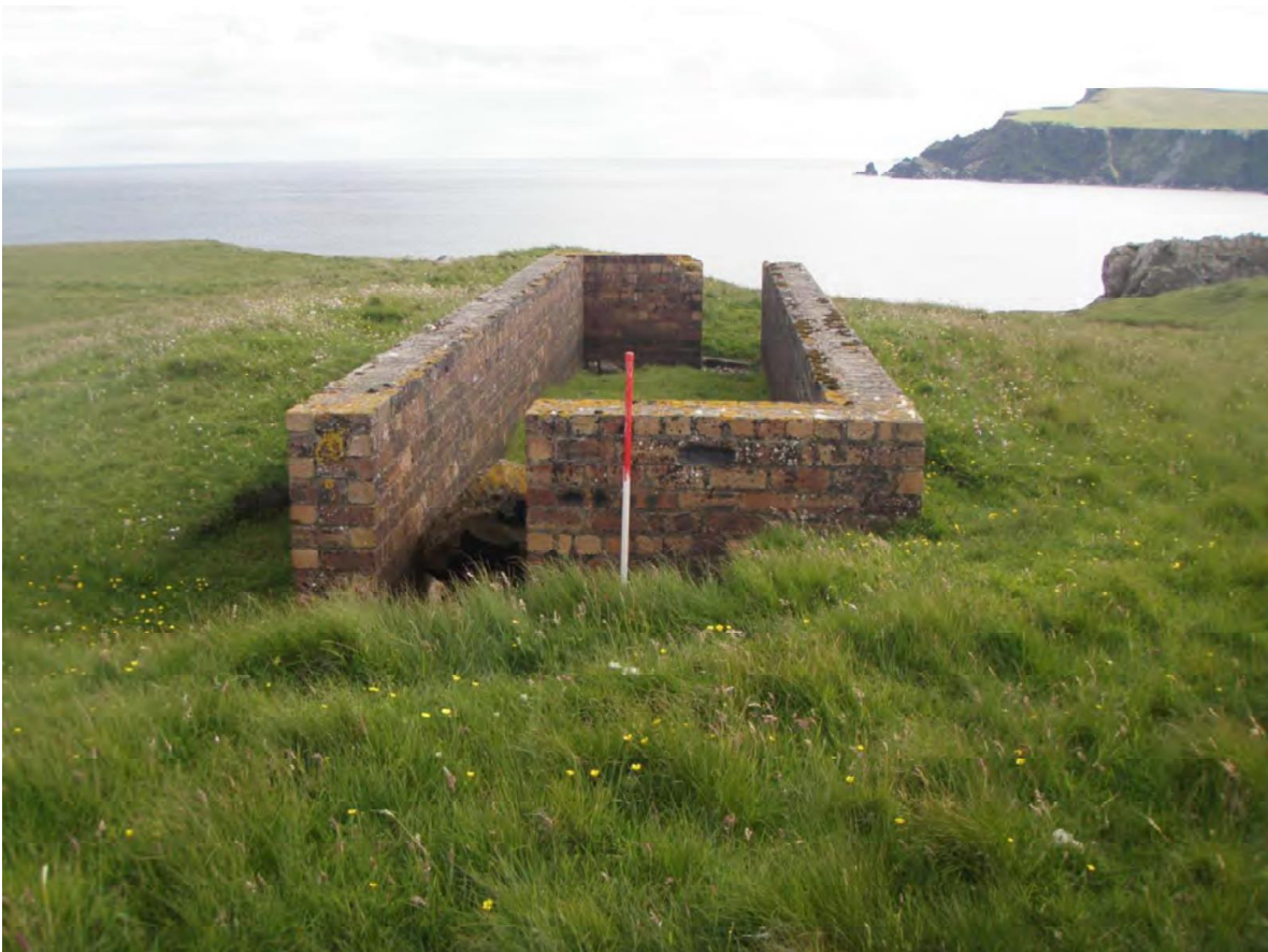
Plate 62: South-east facing view of probable air raid shelter (Site 105)