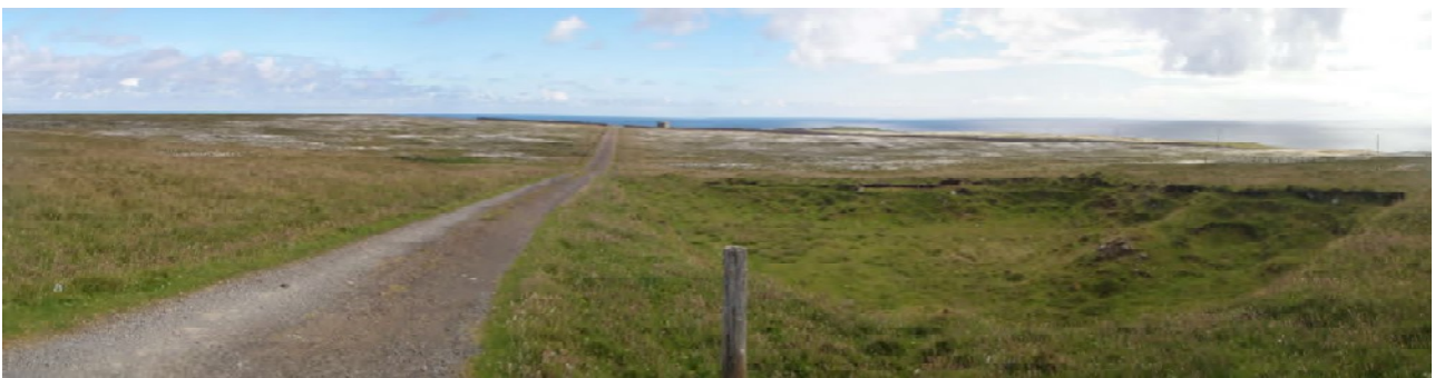
Plate 4: East facing view from the western boundary of the Vertical Launch Space Port. The quarry (Site 201) is visible, as is the dry stone wall (centred Site 104) and the decontamination building (Site 130) is visible beyond the wall