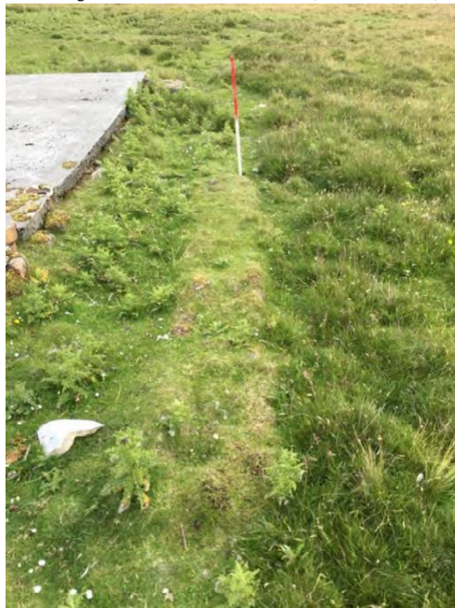
Plate 32: East facing view of overgrown brick channel (Site 464) to the south of the ablutions block (Site 132)