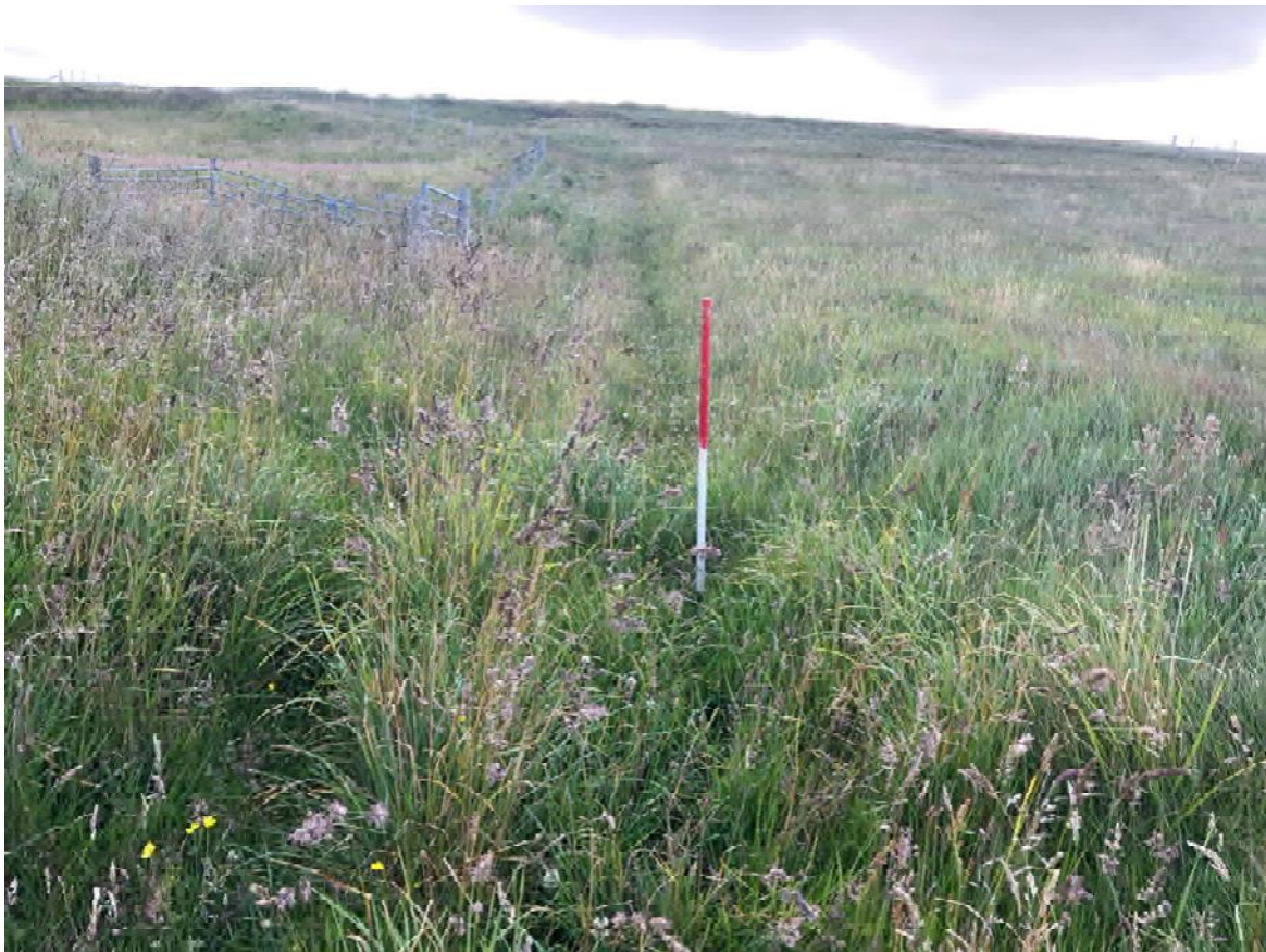
Plate 138: North-east facing view of the New Section of Access Road