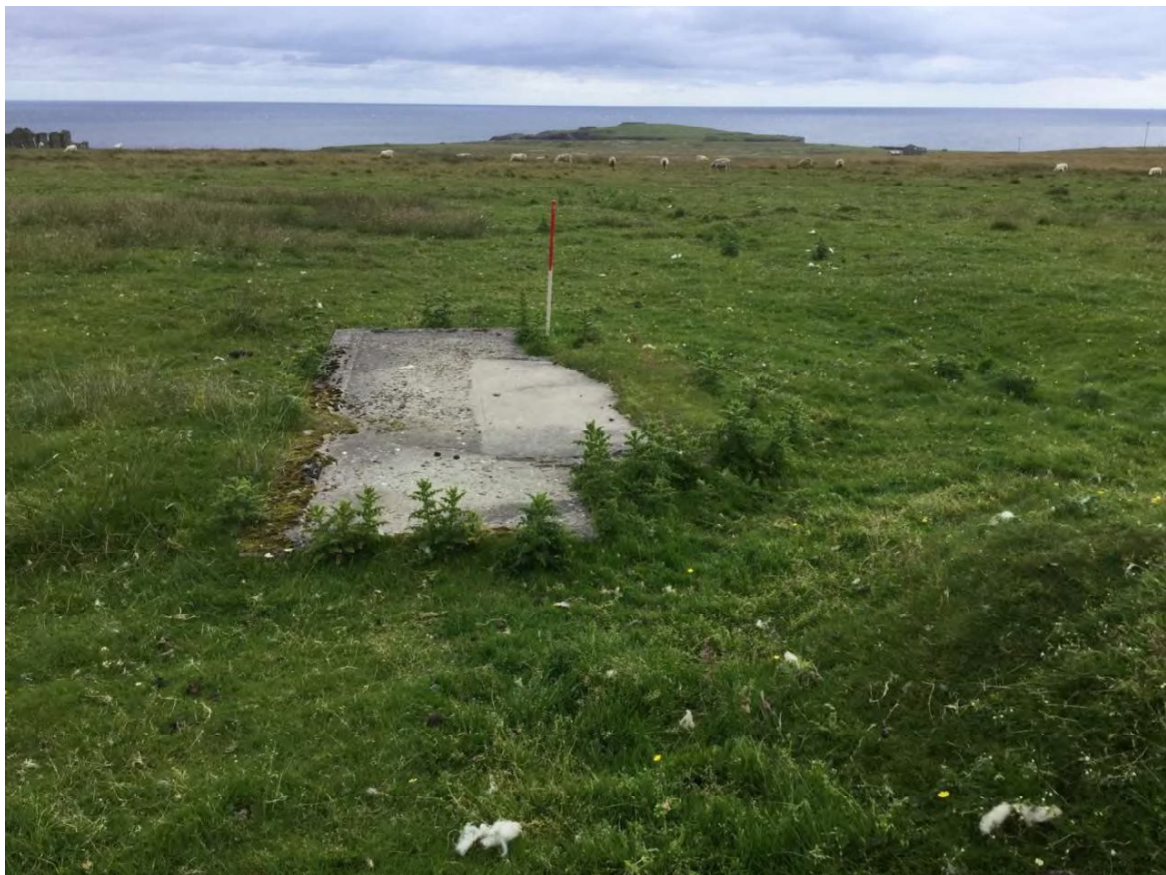
Plate 24: East facing view of a concrete foundation (Site 307)