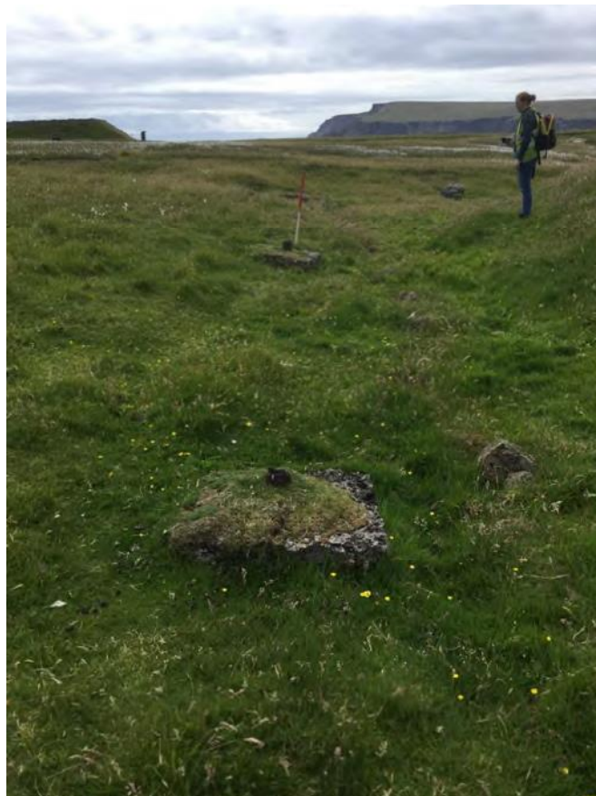
Plate 84: South facing view of channel (Site 315) and row of concrete blocks (316-320)