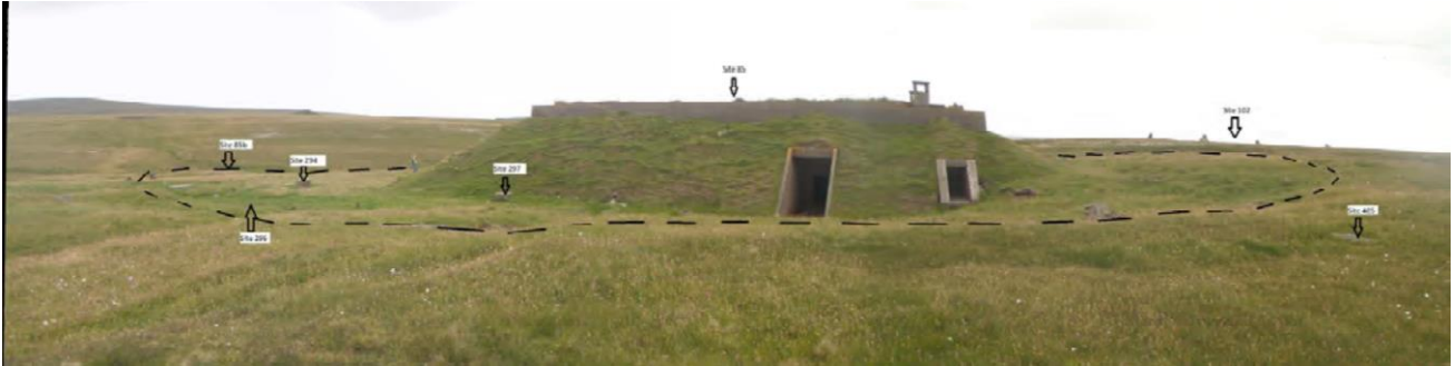
Plate 79: North facing view of the CH Transmitter block (Site 85) and selected features around the block (Site 85). The wall foundation (Site 85b) which encircle the area is shown as a dashed black line