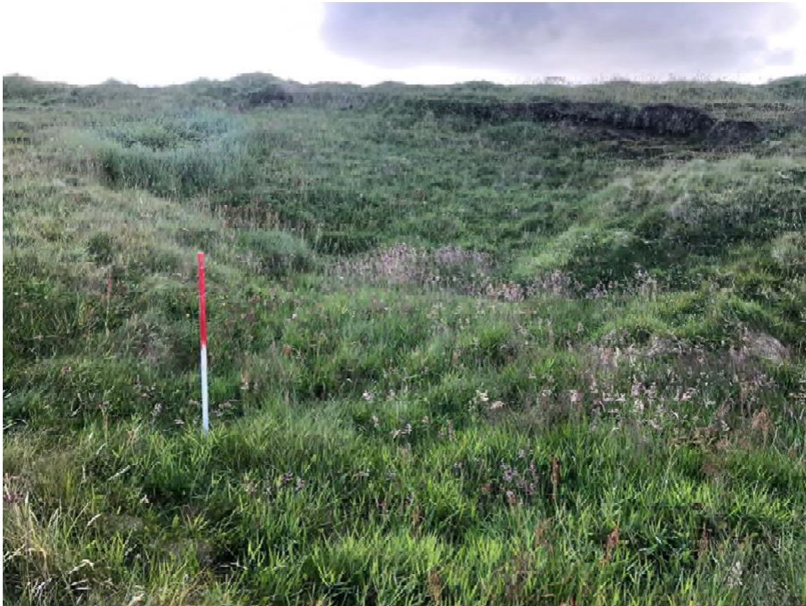
Plate 141: East facing view of quarry scoop (Site 400)