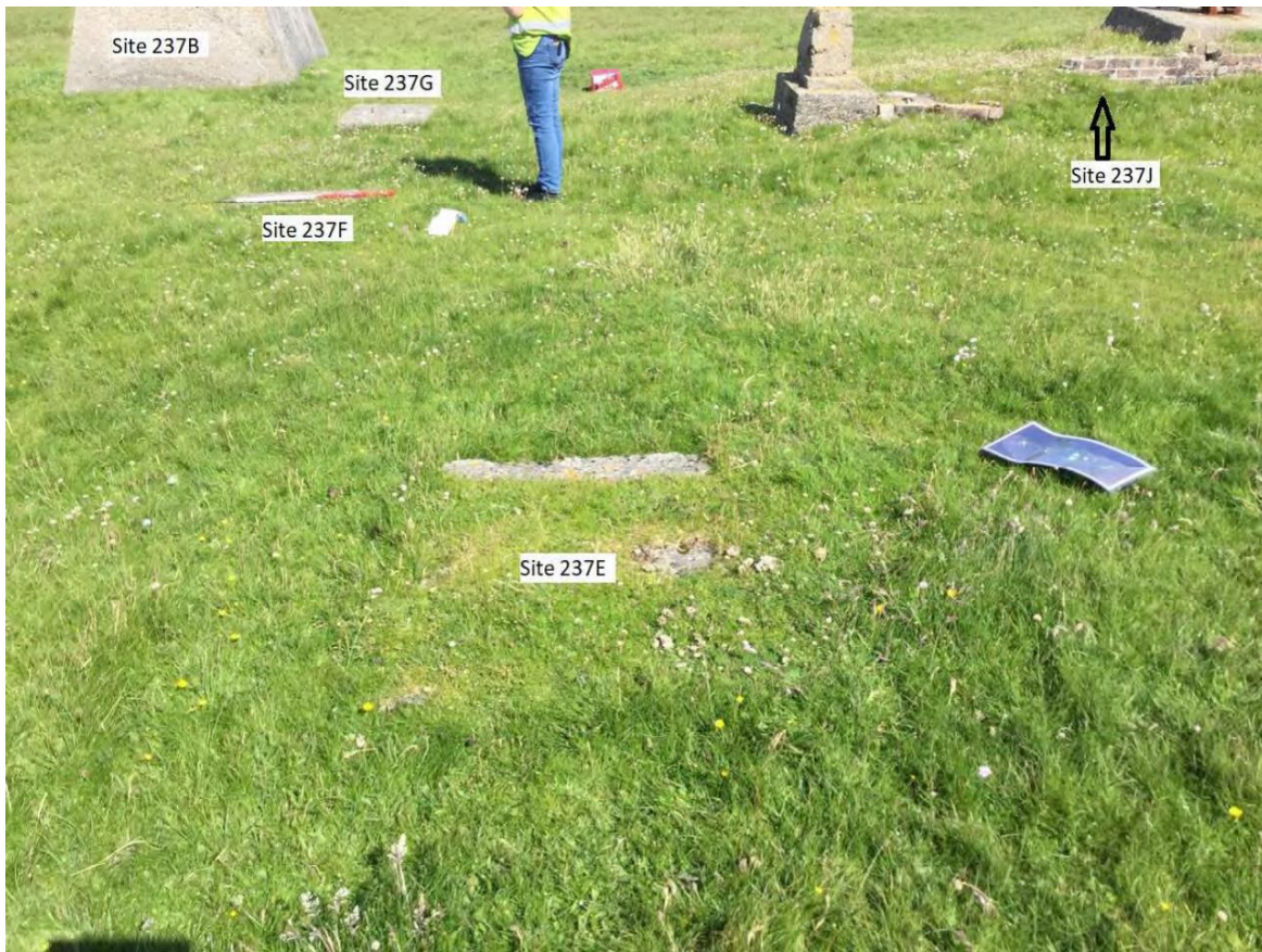
Plate 129: North facing view of concrete blocks around the mast base (centred Site 237)