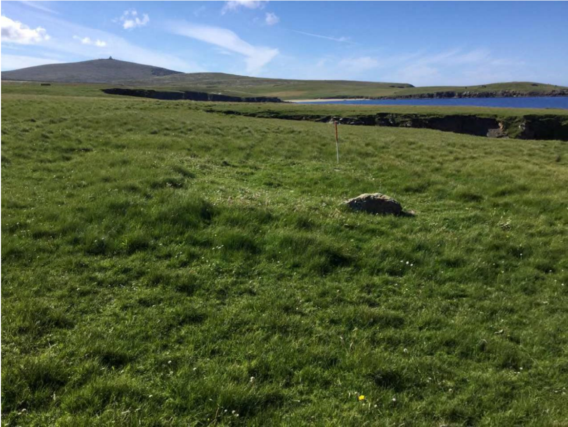
Plate 89: West facing view of potential gun emplacement (Site 288)