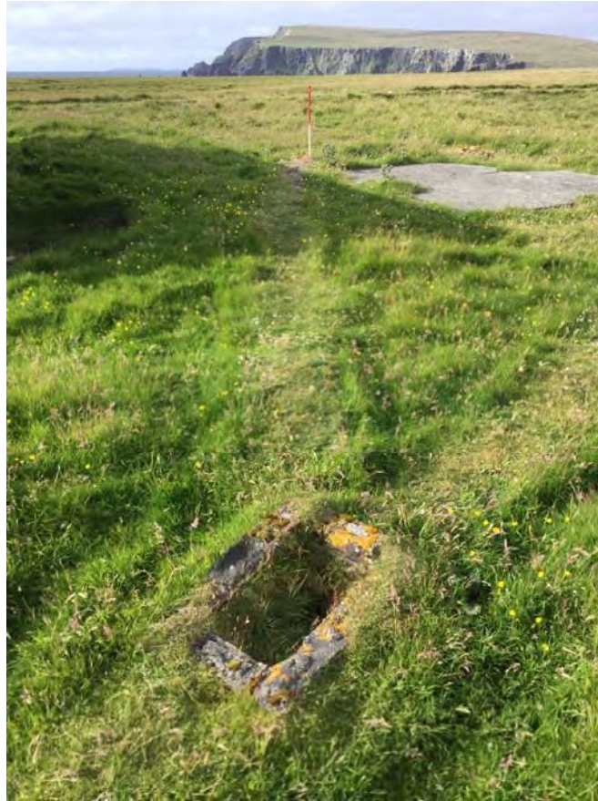
Plate 75: South facing view of a pipe (Site 428) on the eastern side of a concrete pad (Site 84b). The pipes (Site 427 & 428) converge at a brick structure in the foreground