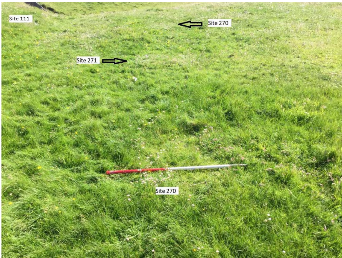
Plate 135: South-east facing view of the row of concrete blocks on the western side of the CH Transmitter block (Site 111)