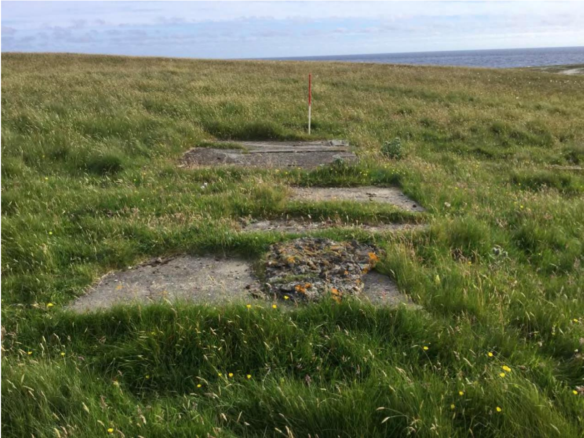
Plate 91: North-east facing view of a concrete foundation (Siet 431)