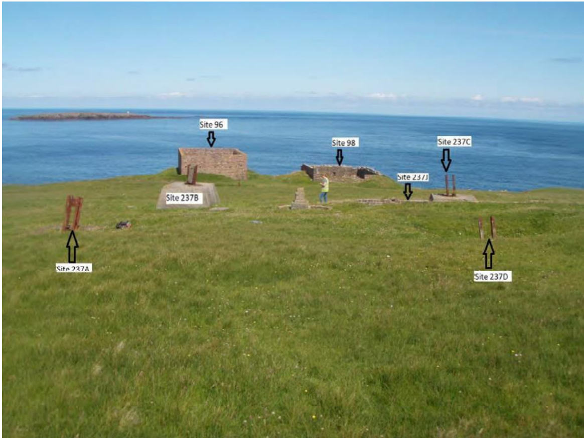
Plate 125: North facing view of mast base (centred Site 237)