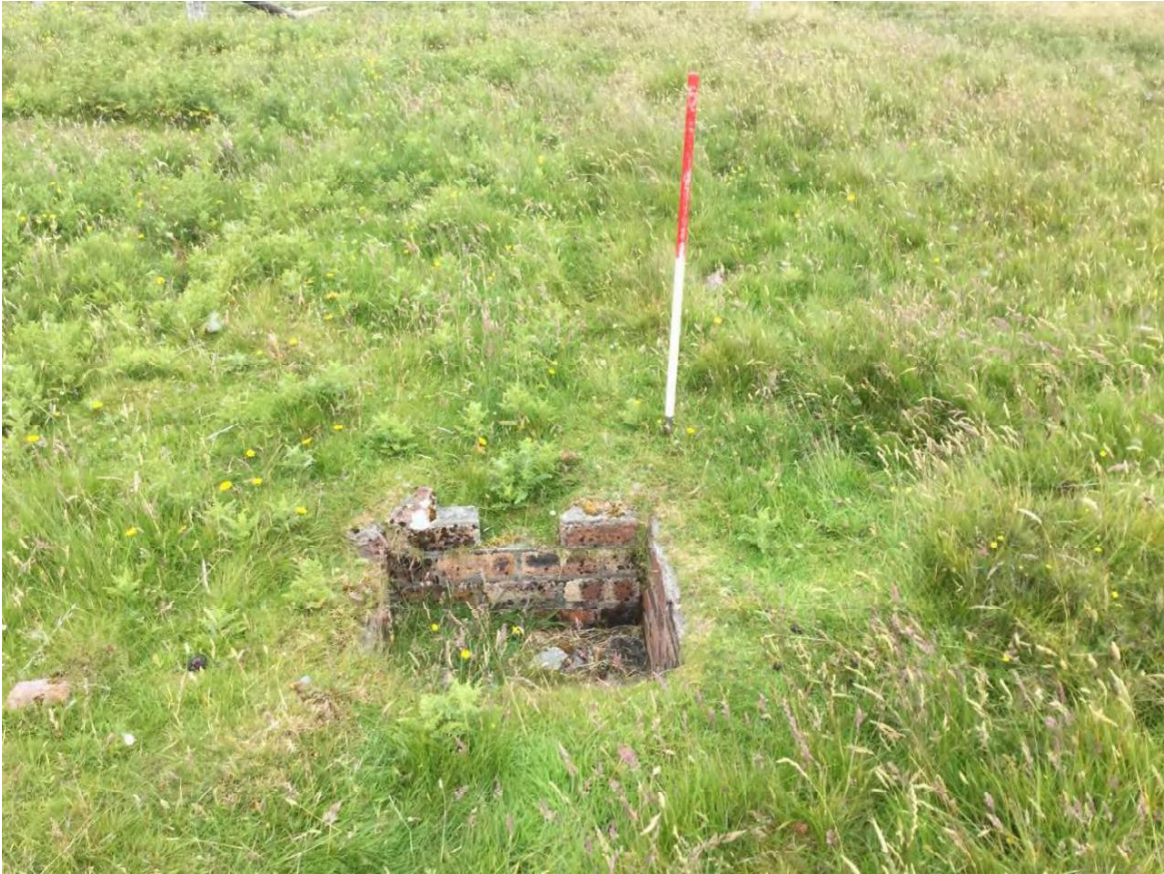
Plate 35: North facing view of brick structure (Site 467)