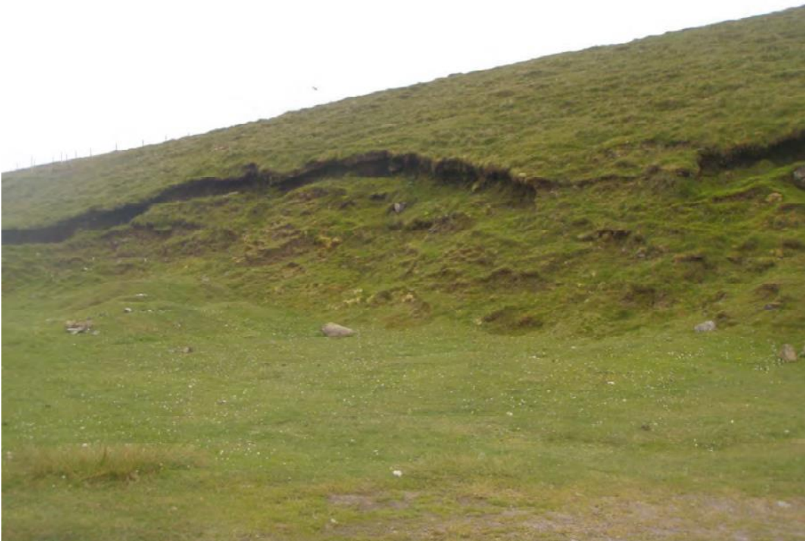
Plate 150: South-east facing view from the Category C Listed Boat-roofed shed (Site 6) towards the Site