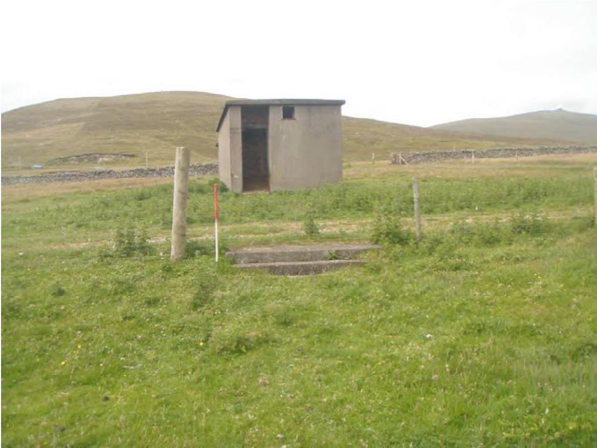
Plate 25: West facing view of the steps between the decontamination block (Site 130) and the former air raid shelter (Site 134)