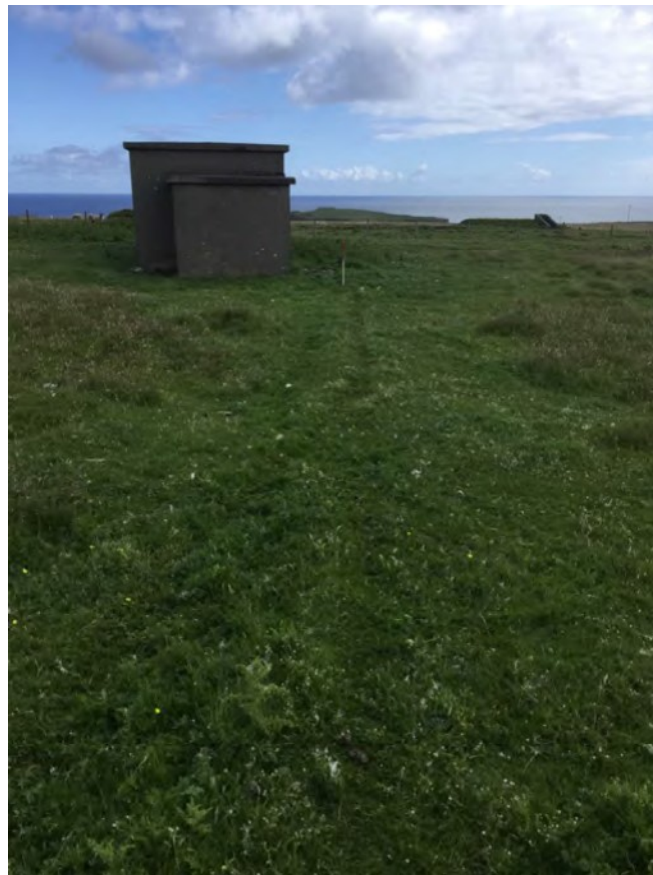
Plate 8: East facing view of the pathway between the guard hut (Site 128) looking towards the decontamination block (Site 130)