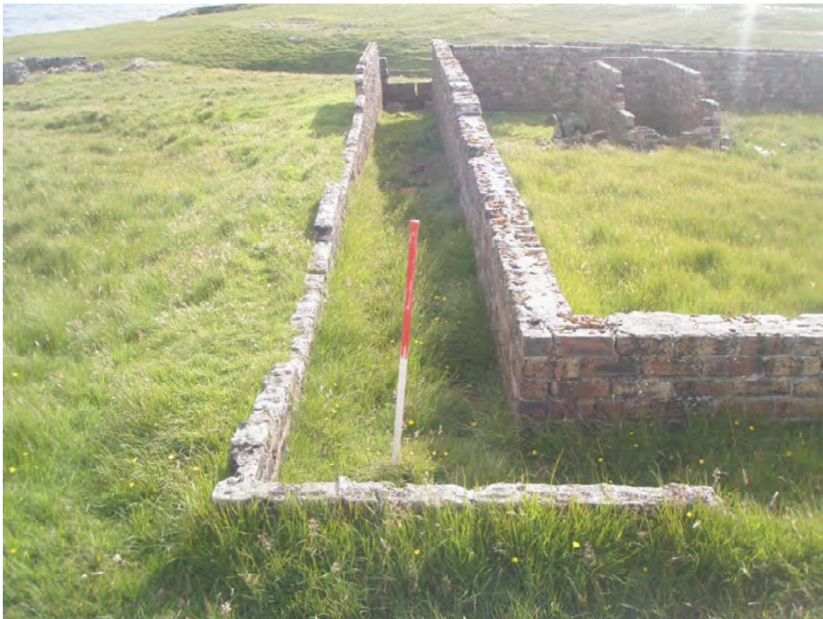
Plate 96: East facing detail of the double brick wall structure (Site 90) showing a crack in the outer, east facing wall