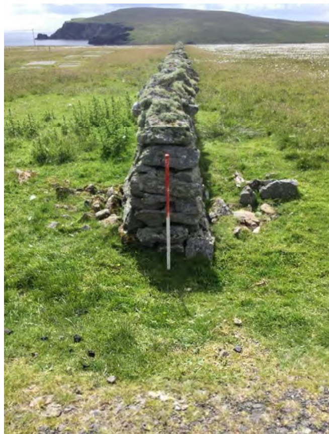
Plate 6: South facing view of dry stone wall from Site 104