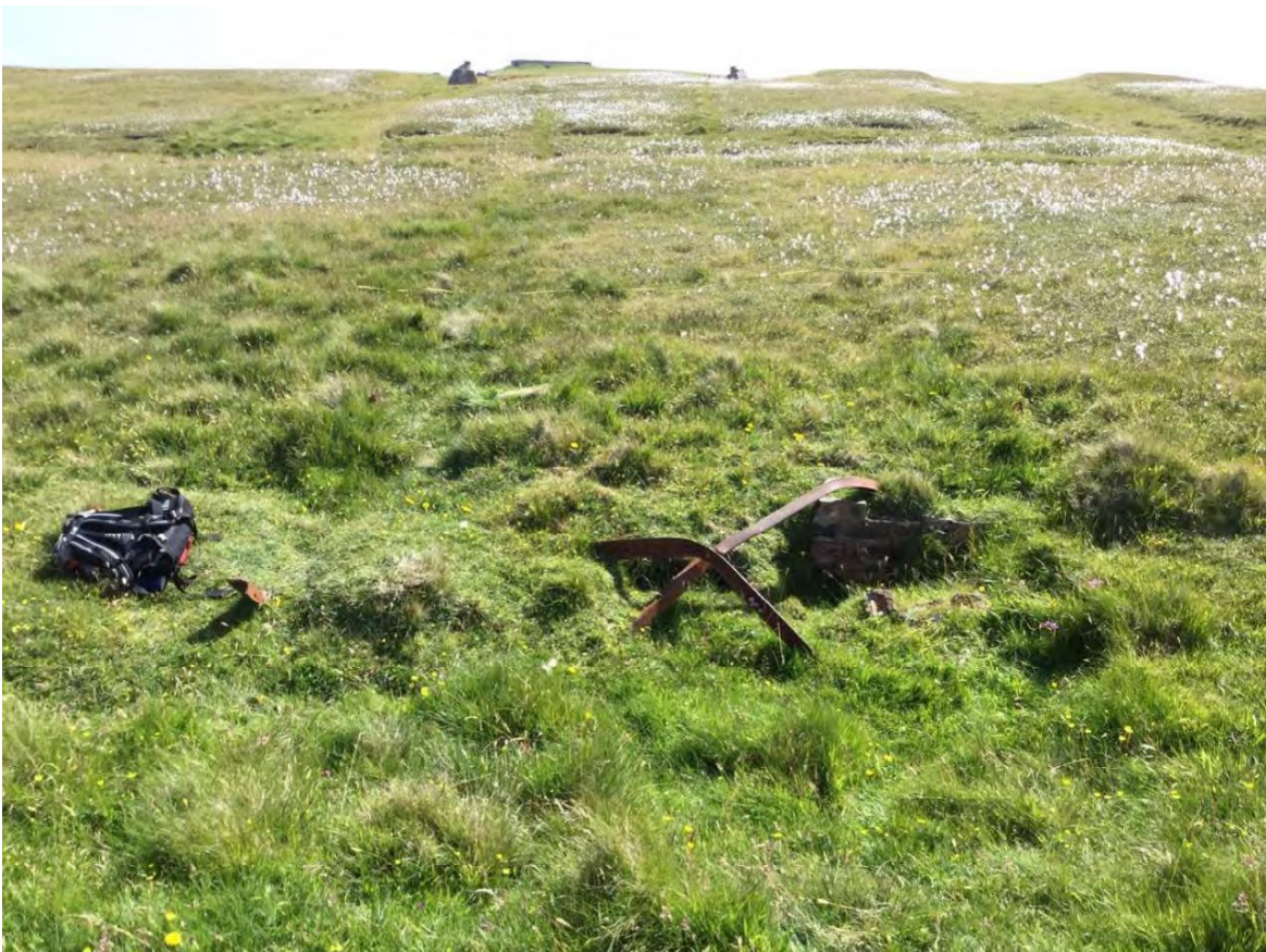
Plate 78: East facing view of the location of a potential structure (Site 384). Note the metal posts and wall remains