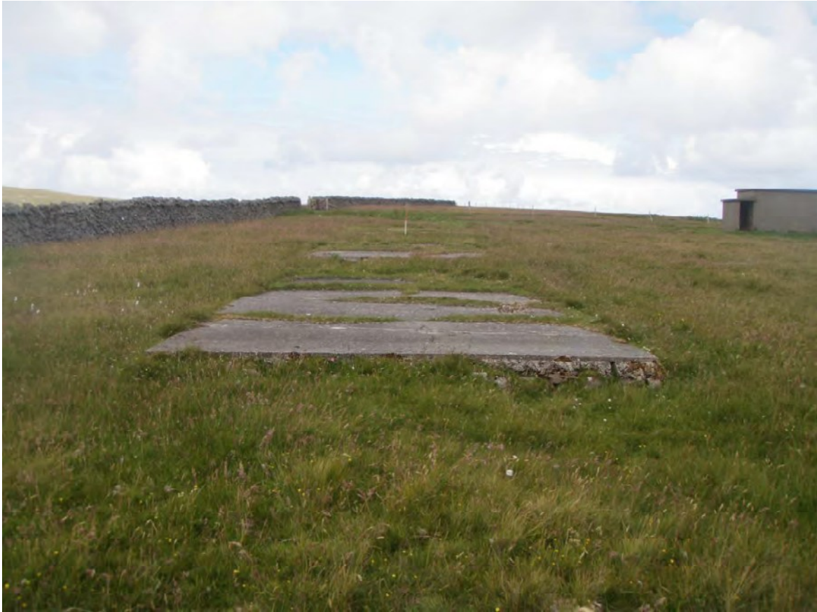
Plate 15: North facing view of the three concrete foundation remains of the stores (Sites 129a-c)