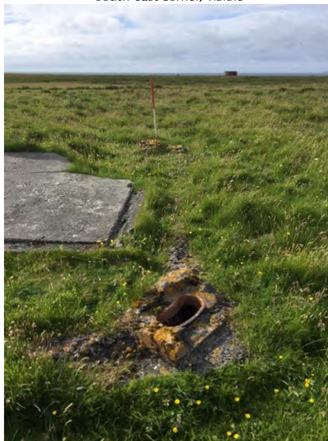
Plate 74: South-east facing view of pipe (Site 427) on the western side of a concrete pad (Site 84b)