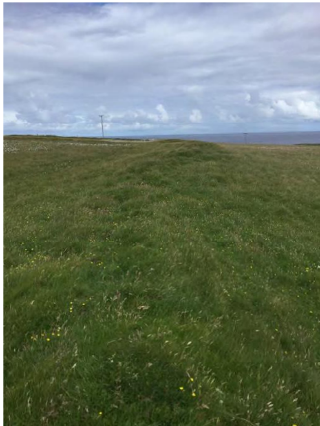
Plate 40: North-east facing view along a degraded turfed bank (Site 217) towards a potential sheep pen (Site 217a)