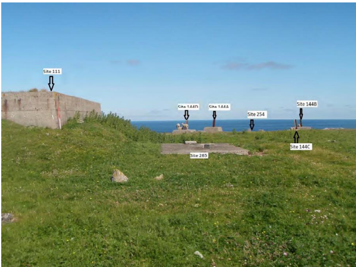
Plate 126: North-east facing view of mast base (centred Site 144) to the east of the CH Transmitter block (Site 111)