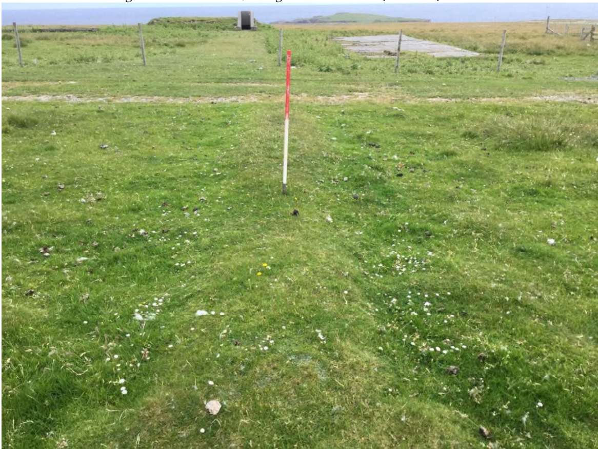
Plate 18: East facing view of overgrown linear foundation (Site 472), an example of three (Sites 470 & 475). A former air raid shelter (Site 135) and the foundation remains of the abutments block (Site 132) are visible in the rearground as is part of the north-south aligned pathway