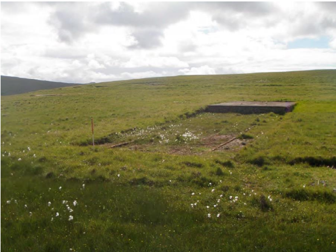
Plate 66: South-west facing view of the dining and cookhouse (Site 107)