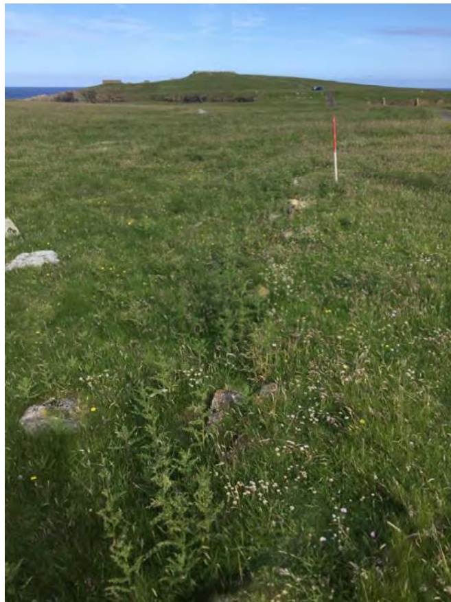
Plate 98: East facing view along the southern wall of a potential building (Site 92/419)