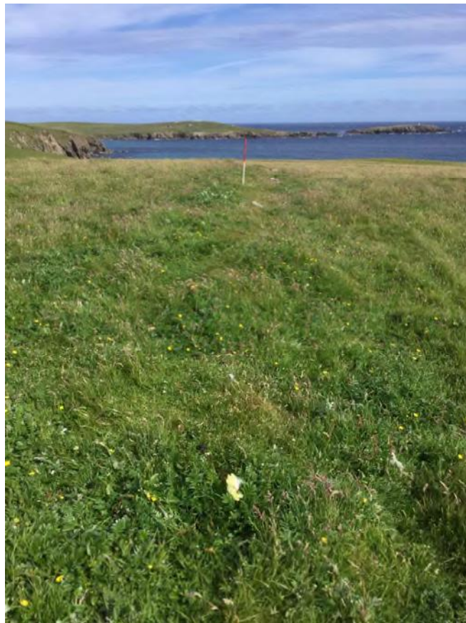
Plate 60: North facing view of field boundary (Site 437), which appears to be composed of an overgrown dry stone wall