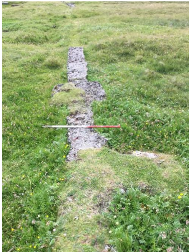
Plate 80: East facing view along Site 85b, showing larger concrete blocks at regular intervals along the wall foundation