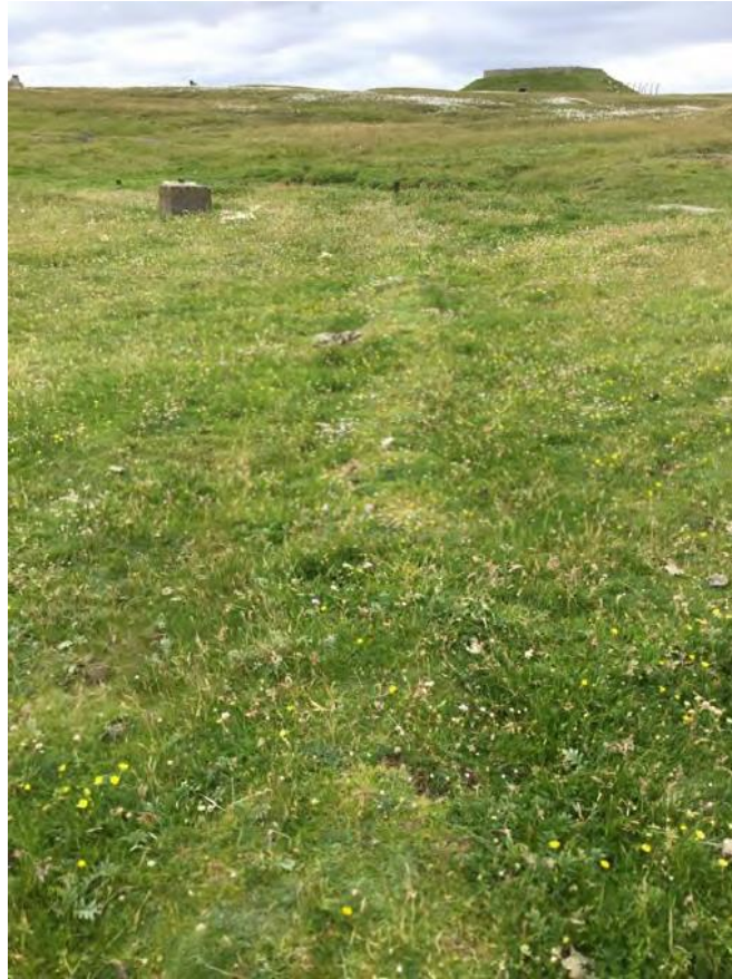
Plate 81: South-east facing view along a wall foundation (Site 291)