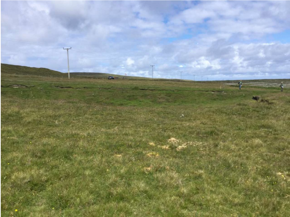
Plate 1: Northing facing view of an irregular quarry (Site 201) on the south side of the track