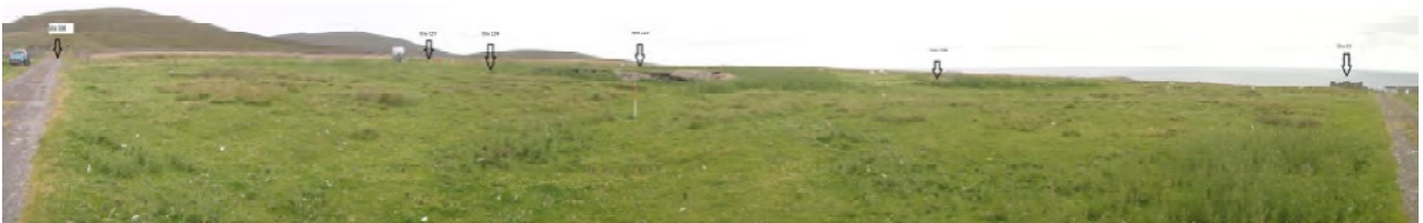
Plate 10: Panorama (W-N-E) over the domestic site (centred Site 69) to the north of the track