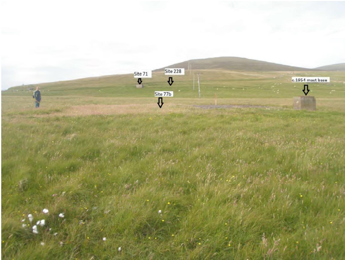
Plate 55: West facing view of Site 77b