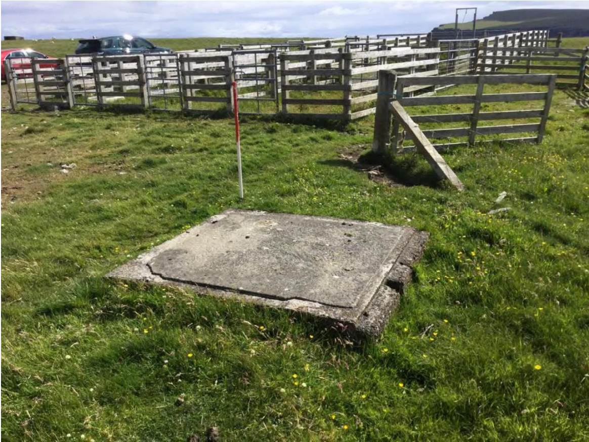
Plate 47: South-east facing view of concrete pad (Site 231)