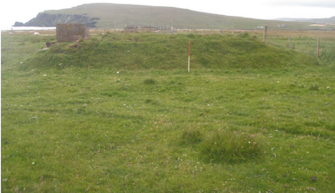
Plate 12: South facing view of a former air raid shelter (Site 134)