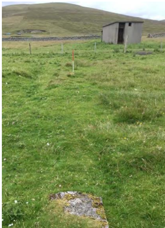
Plate 26: East facing view of the line of concrete blocks, Sites 450-452