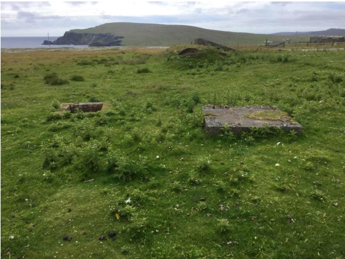
Plate 28: South facing view of a concrete block (Site 477), a brick structure (Site 476), with the former air raid shelter (Site 135) in the rearground