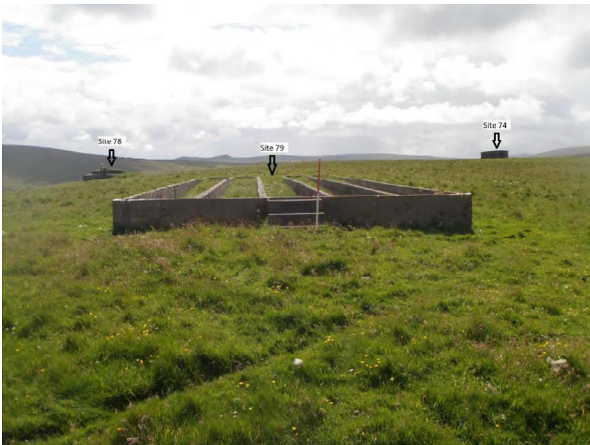
Plate 50: South-west facing view of a small domestic site (centred Site 79) with defensive structures