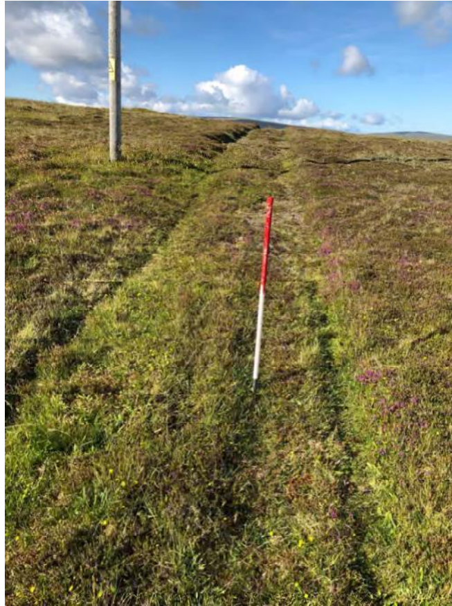
Plate 139: South-west facing view of the New Section of Access Road