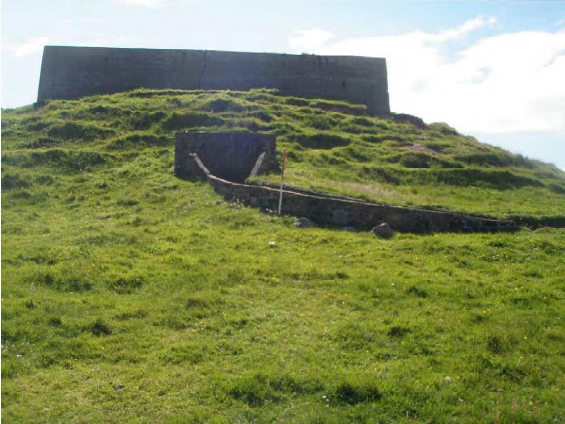
Plate 127: South facing view of channel (Site 237J) entering the CH Transmitter block (Site 111)