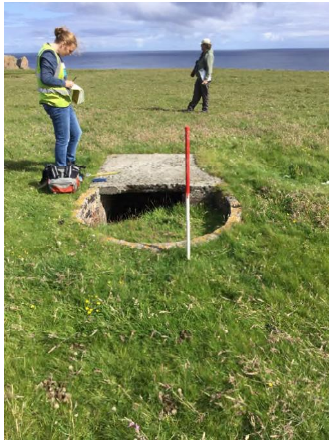
Plate 69: East facing view of Site 233