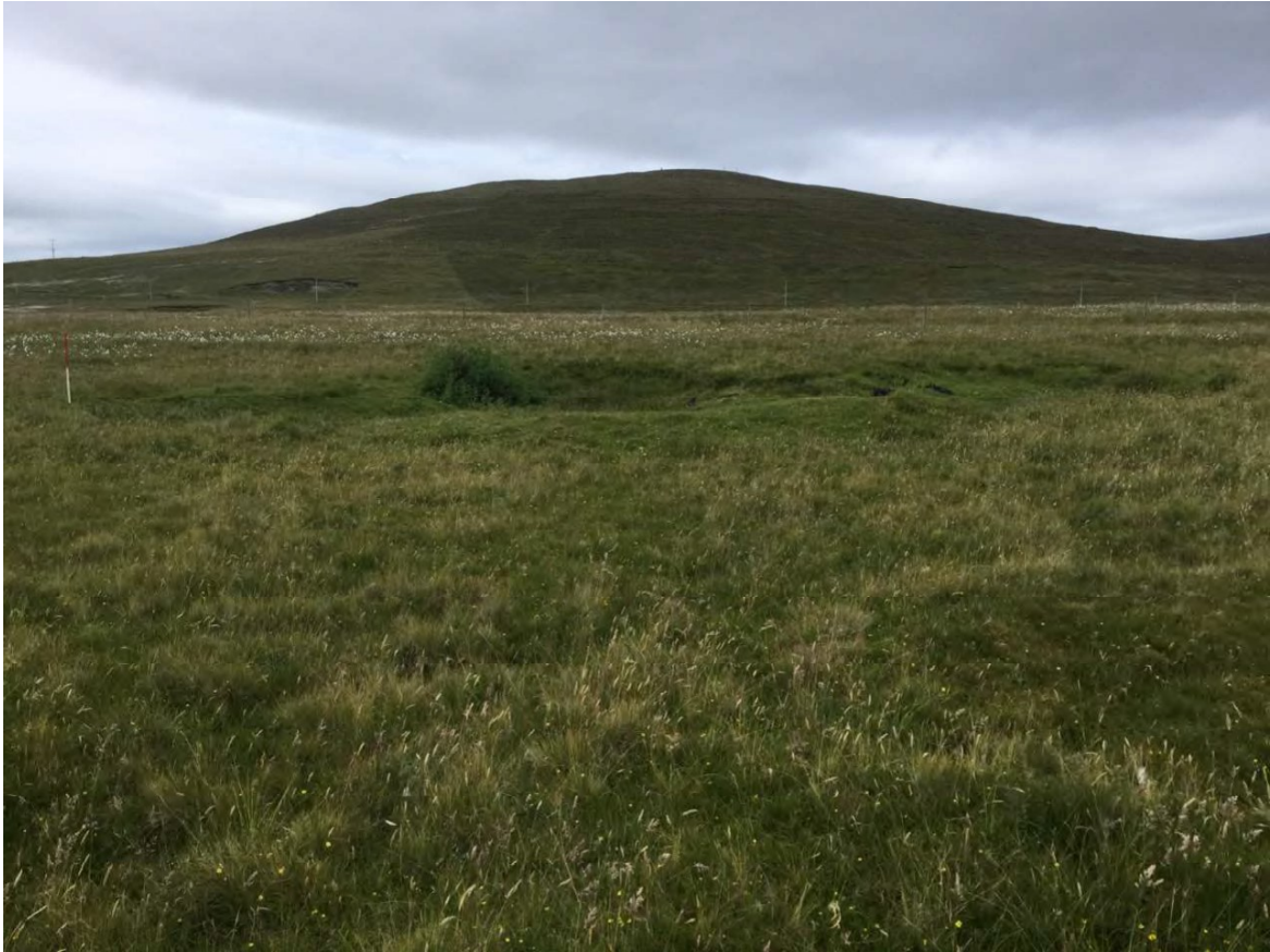
Plate 11: West facing view of probable bomb crater (Site 481)