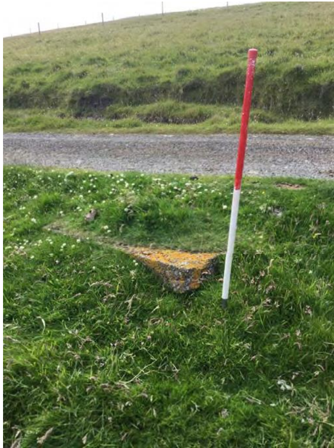
Plate 45: South-western view of concrete block (Site 222)