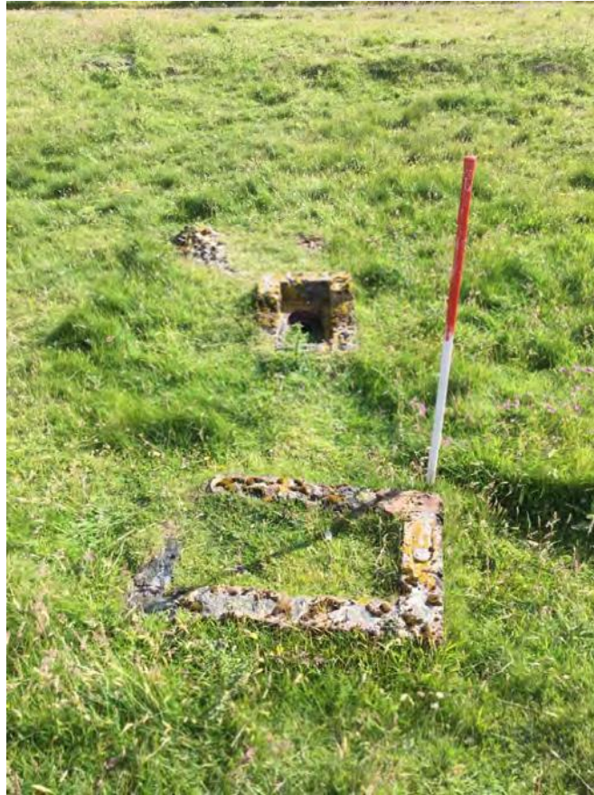
Plate 99: South facing view of a probable toilet (Site 413) with another probable toilet (Site 412) in the rearground