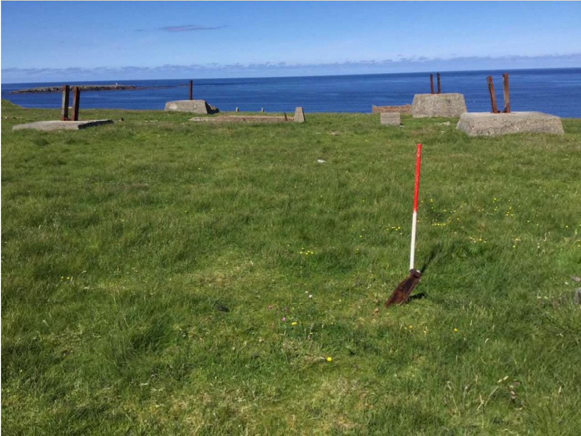
Plate 133: North-east facing view of metal post (Site 256) with the mast base (centred Site 144) in the rearground