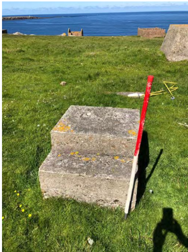
Plate 130: North-east facing view of Site 144F