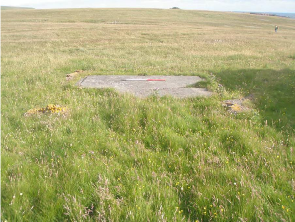
Plate 73: North facing view of concrete pad (Site 84b) with a concrete pipe (Site 428), originating from the south-east corner, visible