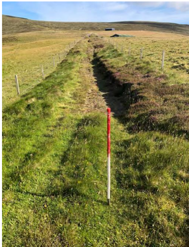
Plate 140: Northing facing view of New Section of Access Road