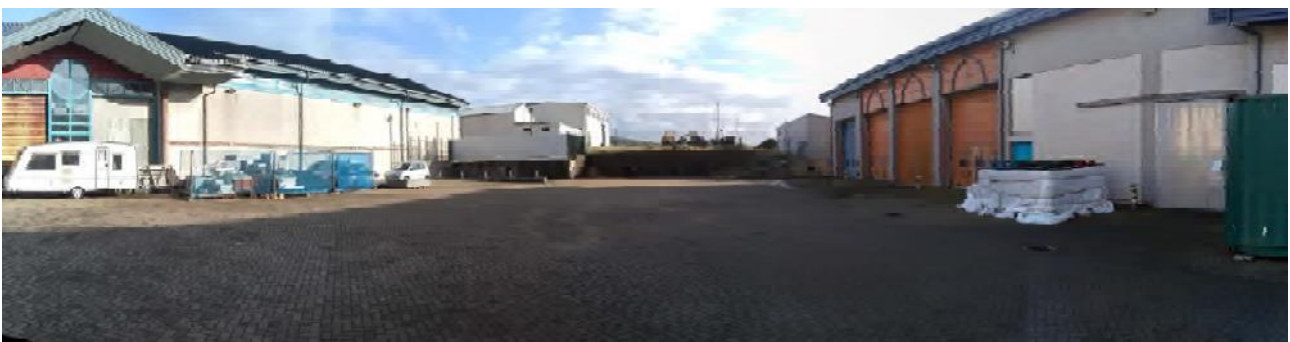
Plate 144: South-east facing view across proposed Launch Control Centre