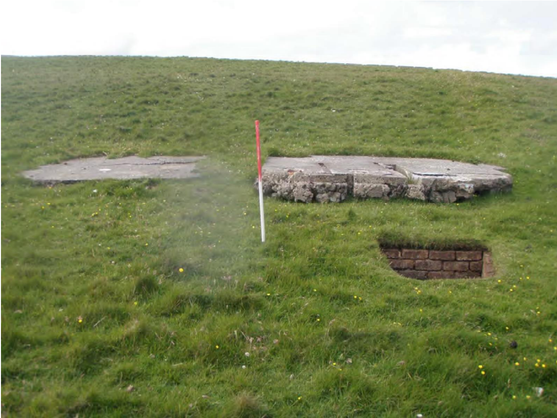
Plate 51: North-west facing view of ablutions block (Site 116) and a brick drain