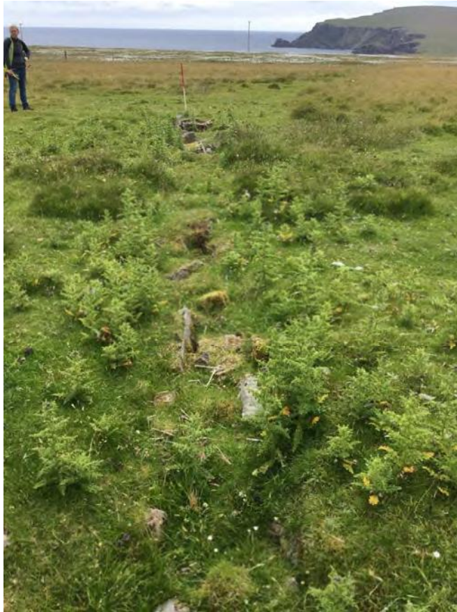
Plate 29: South-east facing view of a brick channel which terminates in a square brick structure (Site 478)