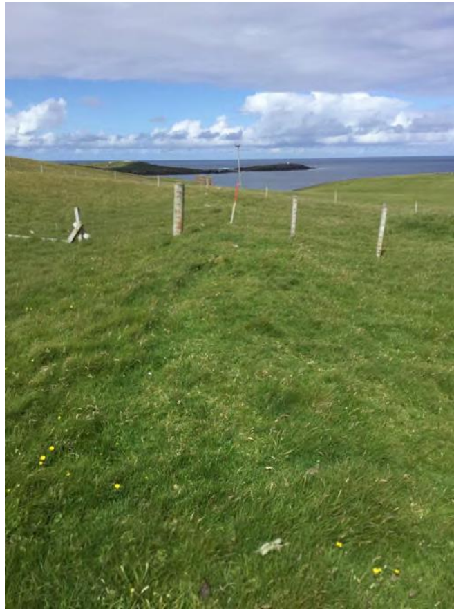
Plate 49: North-east facing view of a field bank (Site 230) with Site 74 in rearground