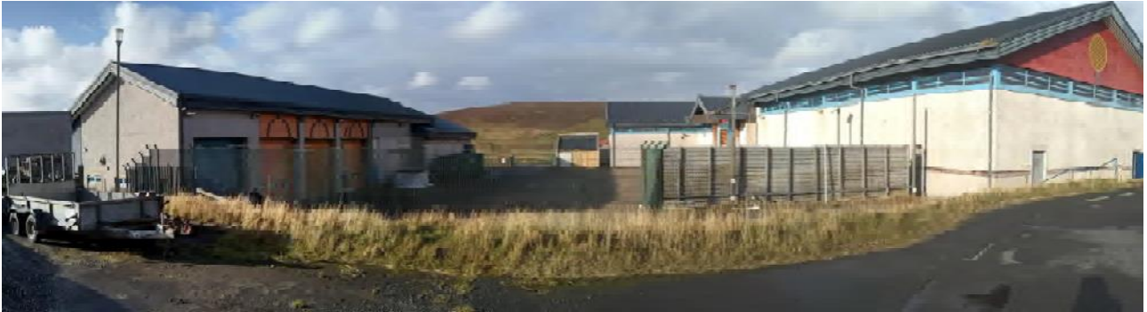
Plate 143: North-west facing view across proposed Launch Control Centre