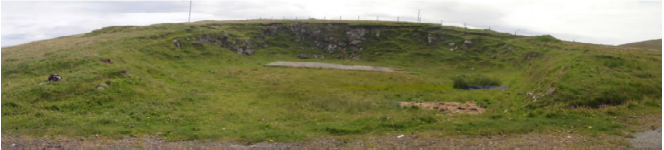
Plate 39: South facing view of a former quarry (Site 62), in which the foundation remains of a maintenance workshop (Site 70) were constructed