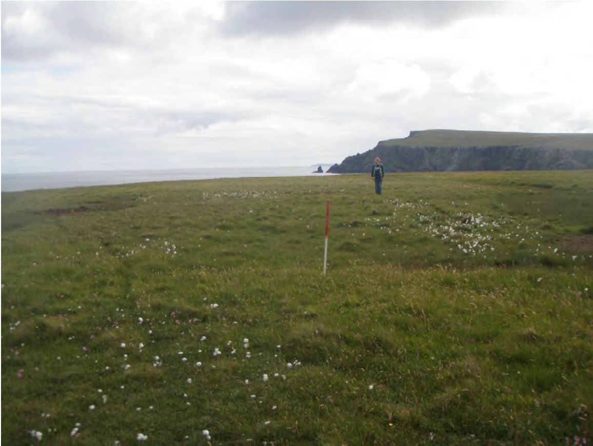
Plate 67: South-east facing view of the overgrown remains of a building (Site 106b)