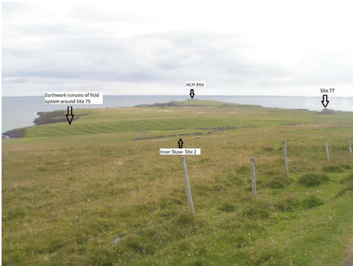
Plate 41: East facing view from land east of Priest House (Site 62), showing the lower lying ground further eastward along the peninsula of Lamba Ness