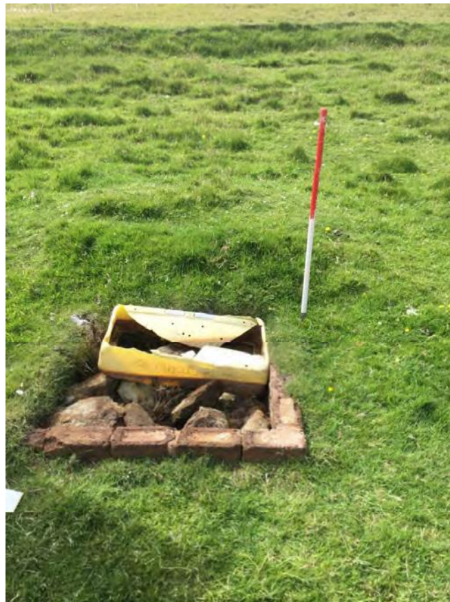
Plate 46: West facing view of brick structure (Site 229)