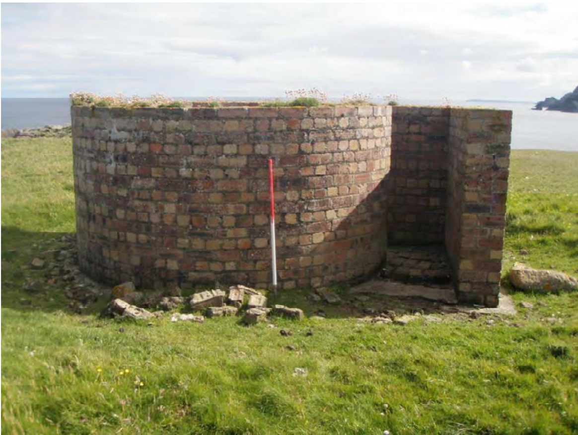
Plate 68: South-east facing view of a brick structure (Site 91)