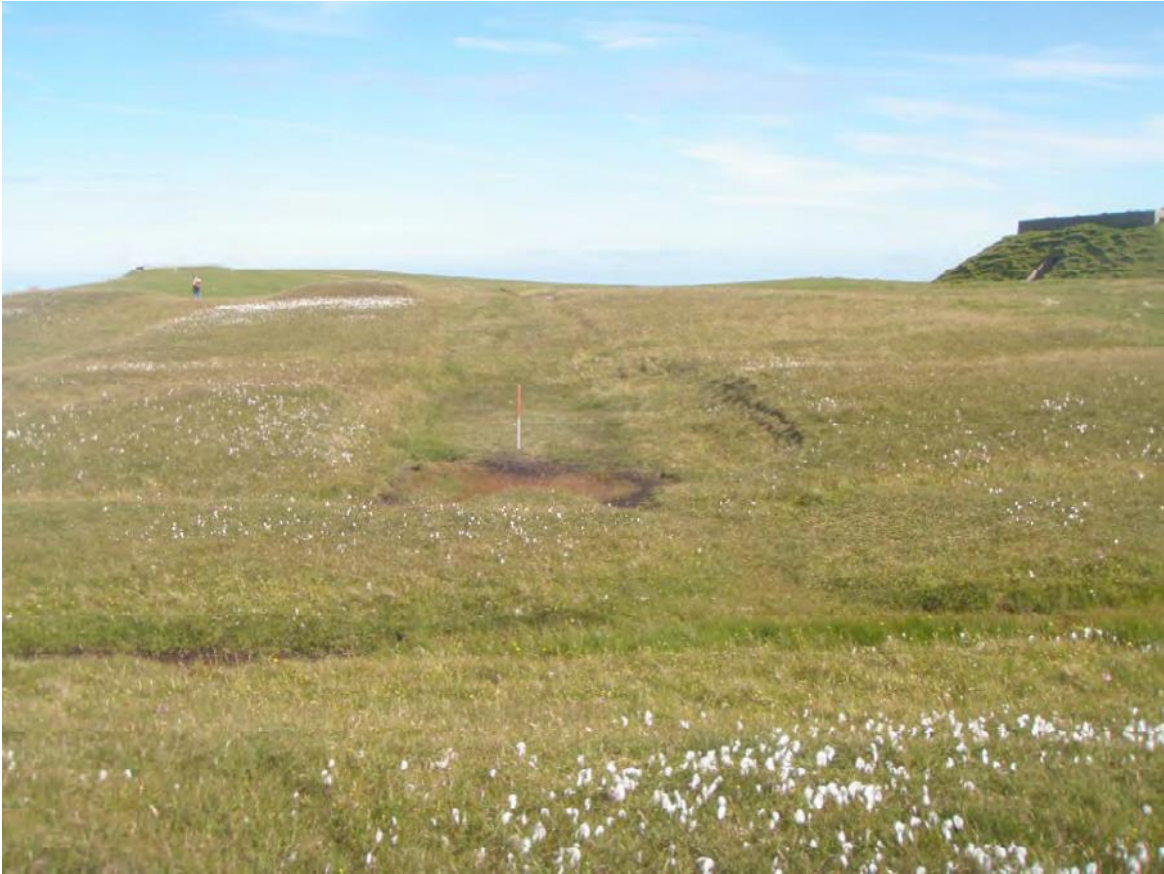
Plate 97: East facing view of large cut feature or negative earthwork (Site 410)