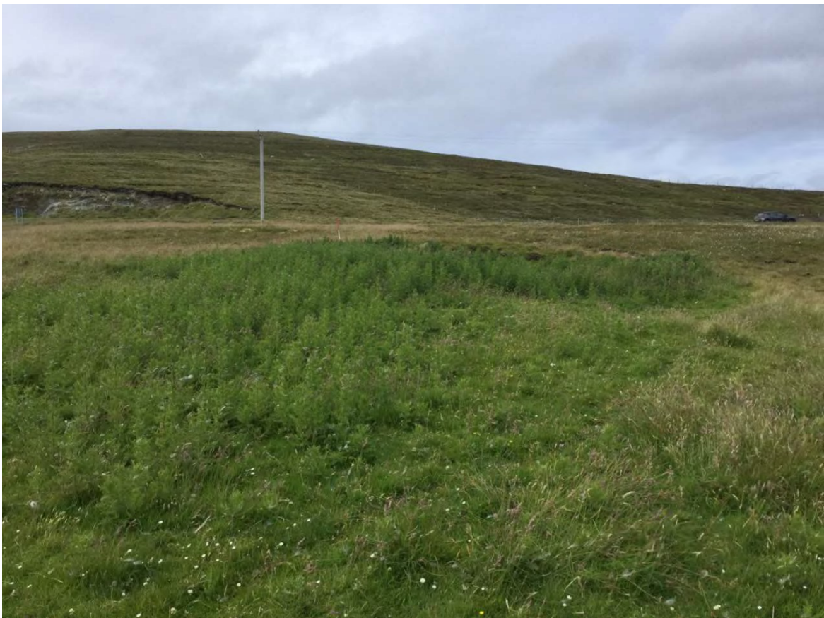
Plate 2: North-west facing view of the quarry or bomb crater north of the track (Site 445)