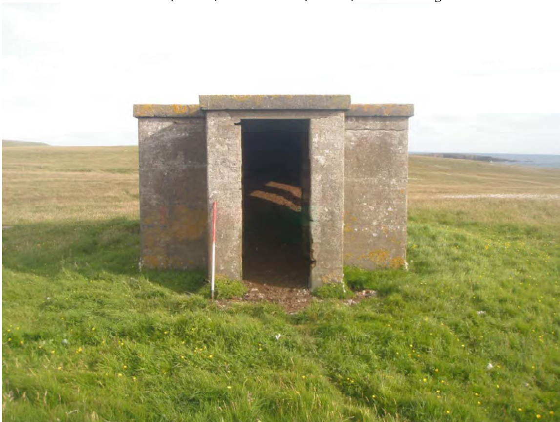
Plate 72: North facing view of a guard hut (Site 84)