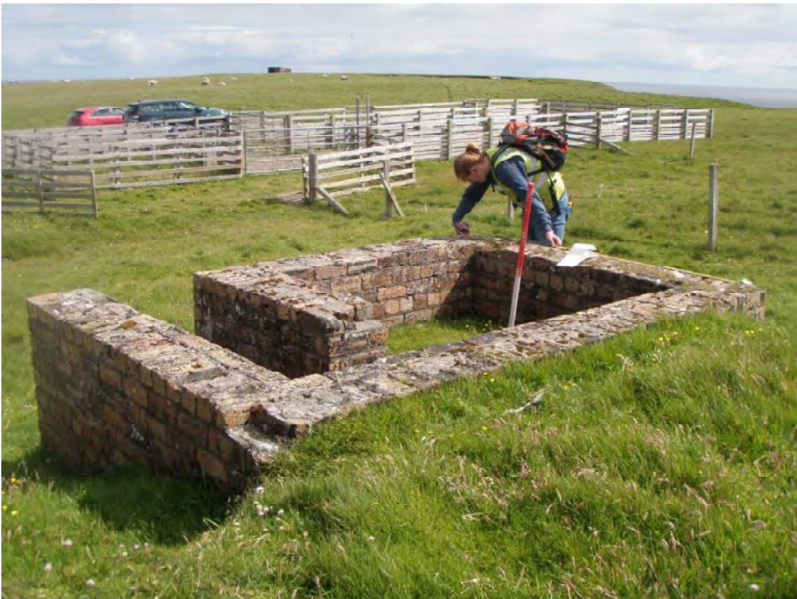
Plate 48: North-east facing view of the upstanding remains of Site 72, a probable air raid or sleeping shelter, dug into the nature slope