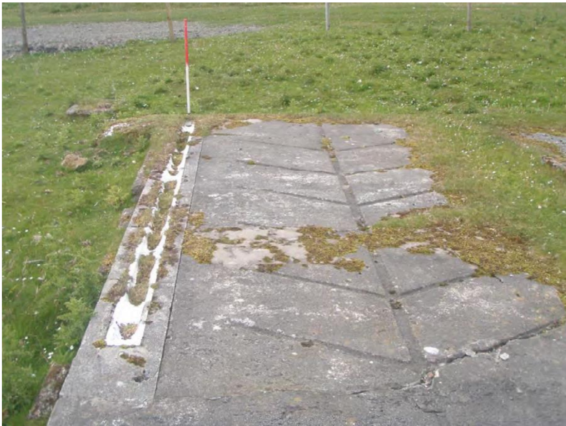
Plate 30: Detail of the remains of drainage features at the northern end of the abutments block (Site 132)