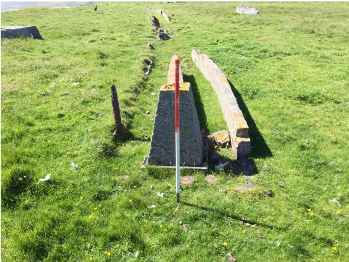
Plate 128: West facing view of channel (Site 254) from its origin at the centre of mast base (centred Site 144)