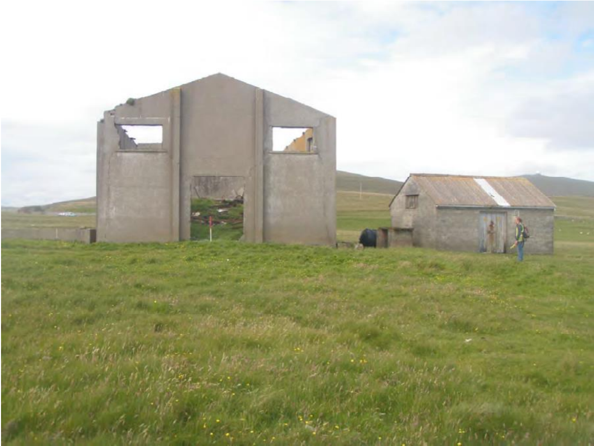
Plate 53: West facing view of the power house (Site 77) and roofed building (Site 77c)