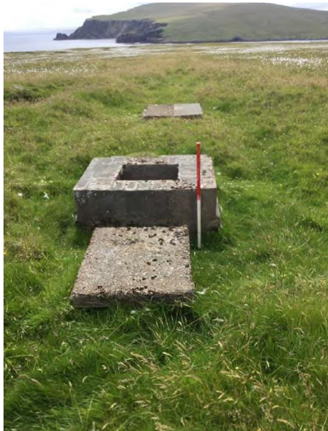
Plate 36: South facing view of concrete structures Sites 207, 208 & 210