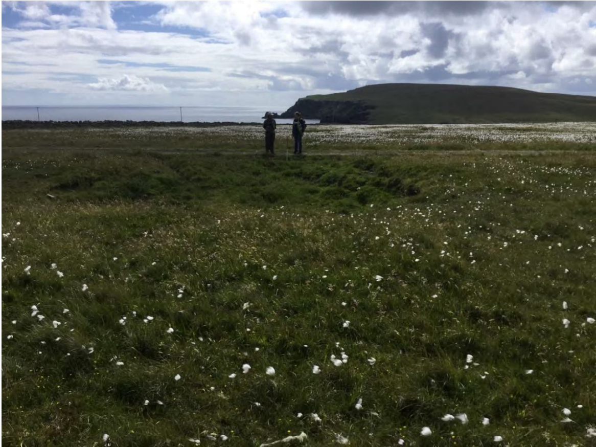
Plate 3: South facing view of probable bomb crater (Site 202)