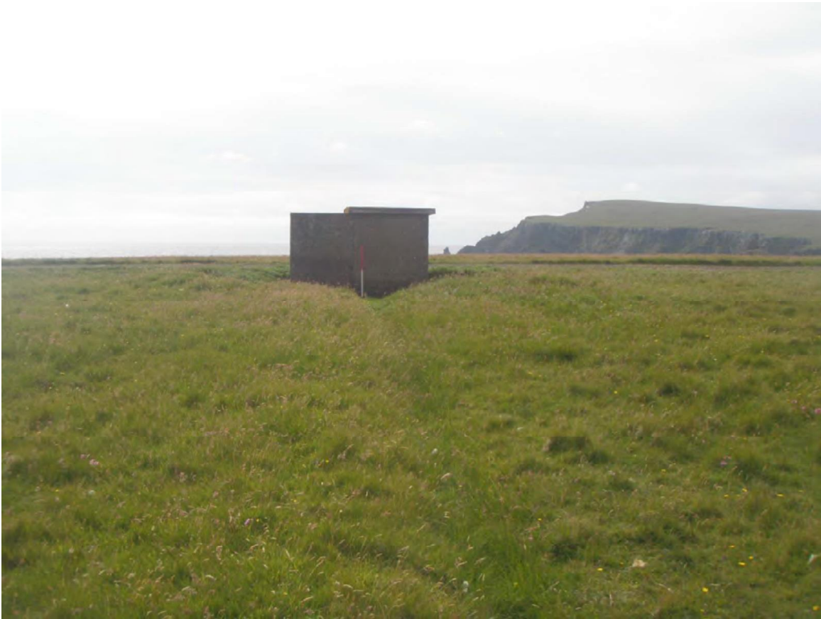
Plate 57: South facing view of channel, potentially a service channel to the north of the guard hut (Site 82)