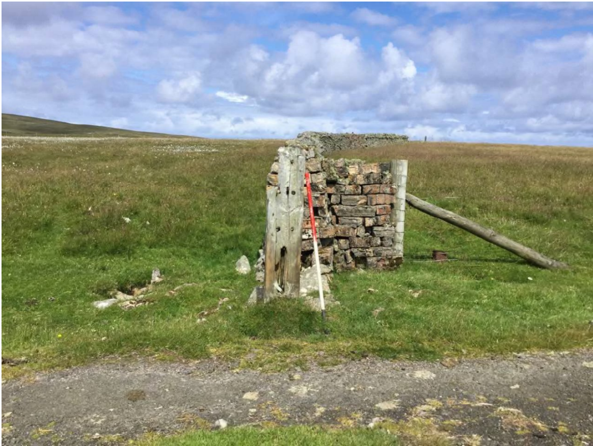
Plate 5: North facing view of the dry stone wall, from the entrance (Site 104)