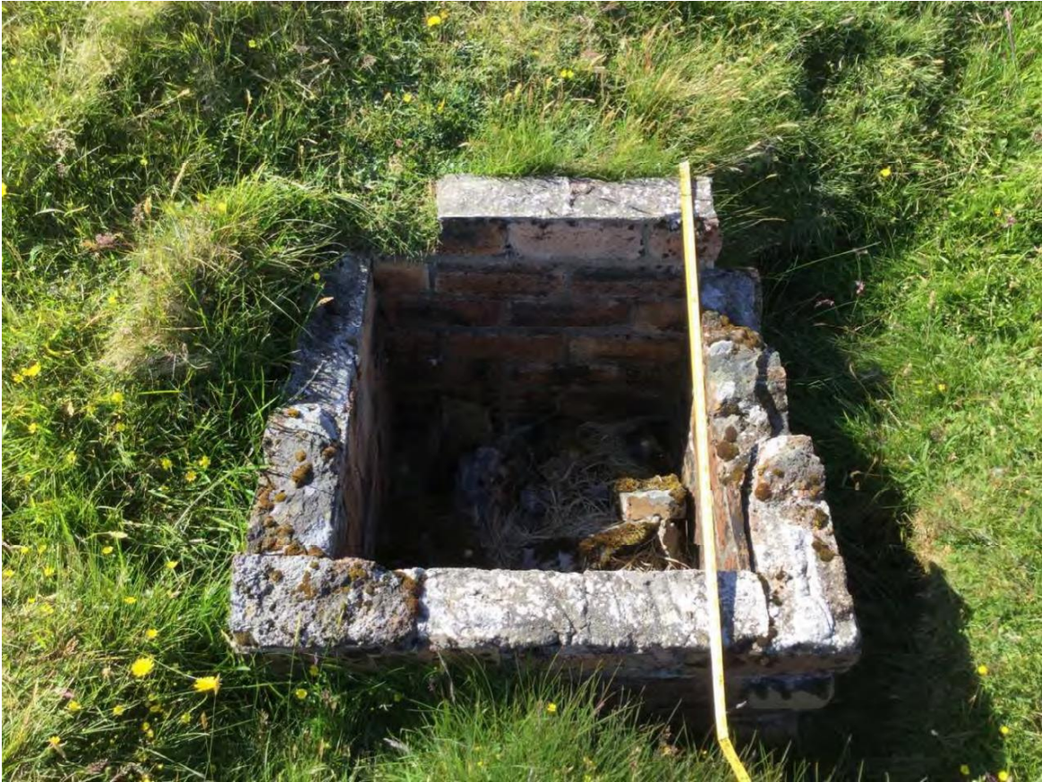
Plate 77: Detail of brick structure (Site 378)