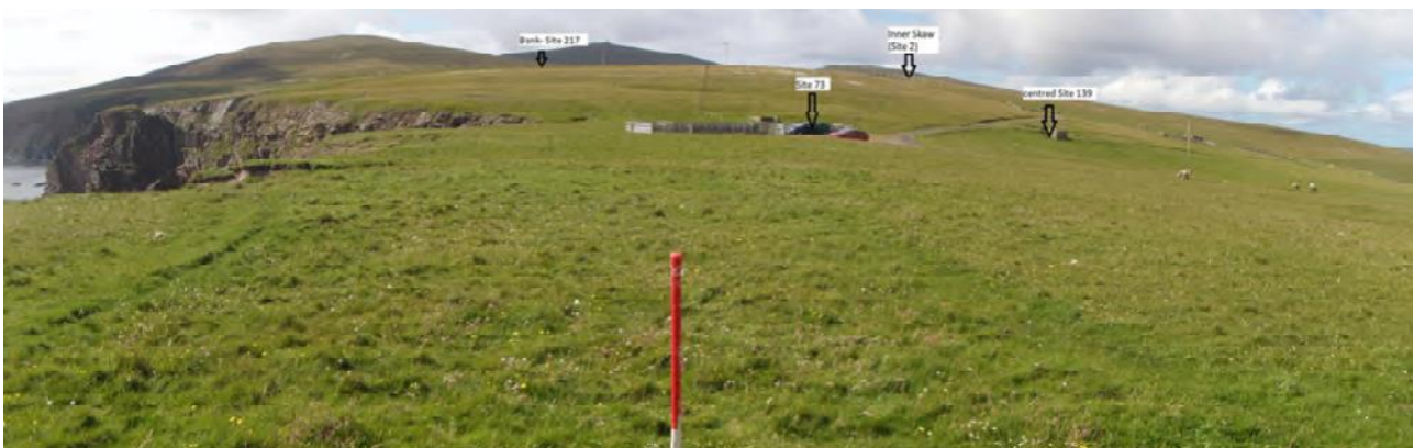
Plate 42: West facing view of the slope within the Vertical Launch Space Port. The probable medieval or post-medieval field system is located on the upper slopes on the southern side of Lamba Ness (Sites 214-217 & 222)