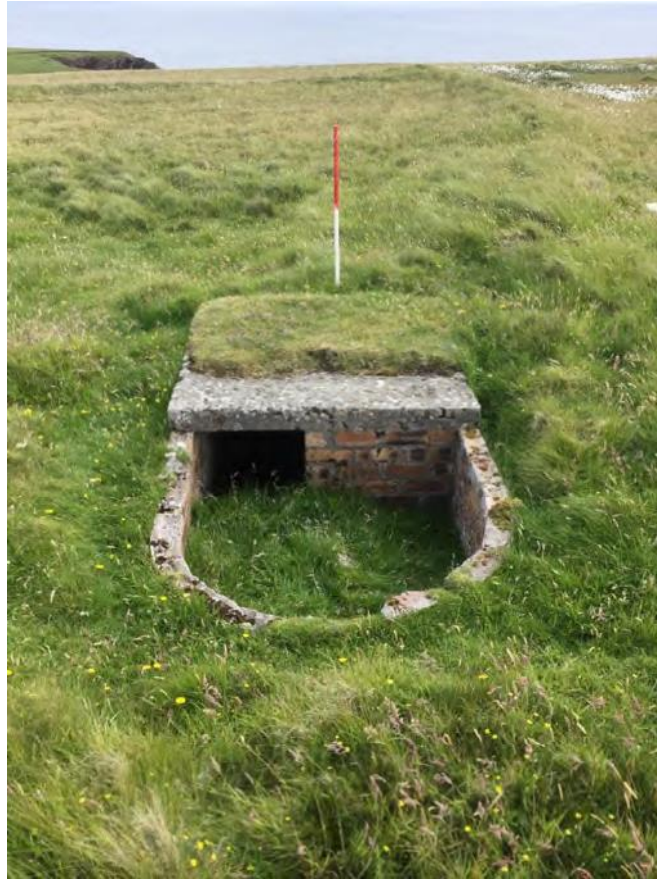
Plate 43: South-east facing view of brick, concrete capped structure (Site 218)