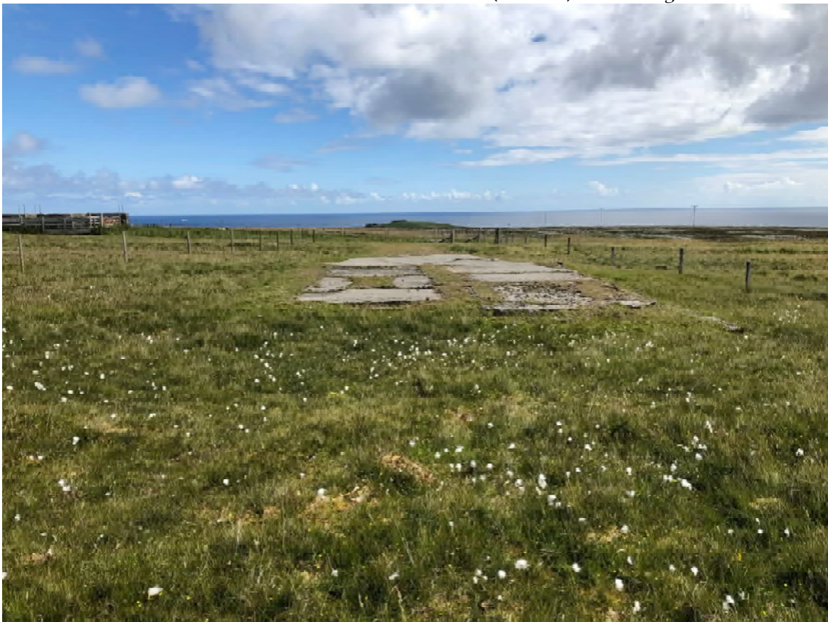
Plate 20: East facing view of the foundation remains of the water transport system (Site 138) with the upstanding remains of the office block (Site 136) in the rearground