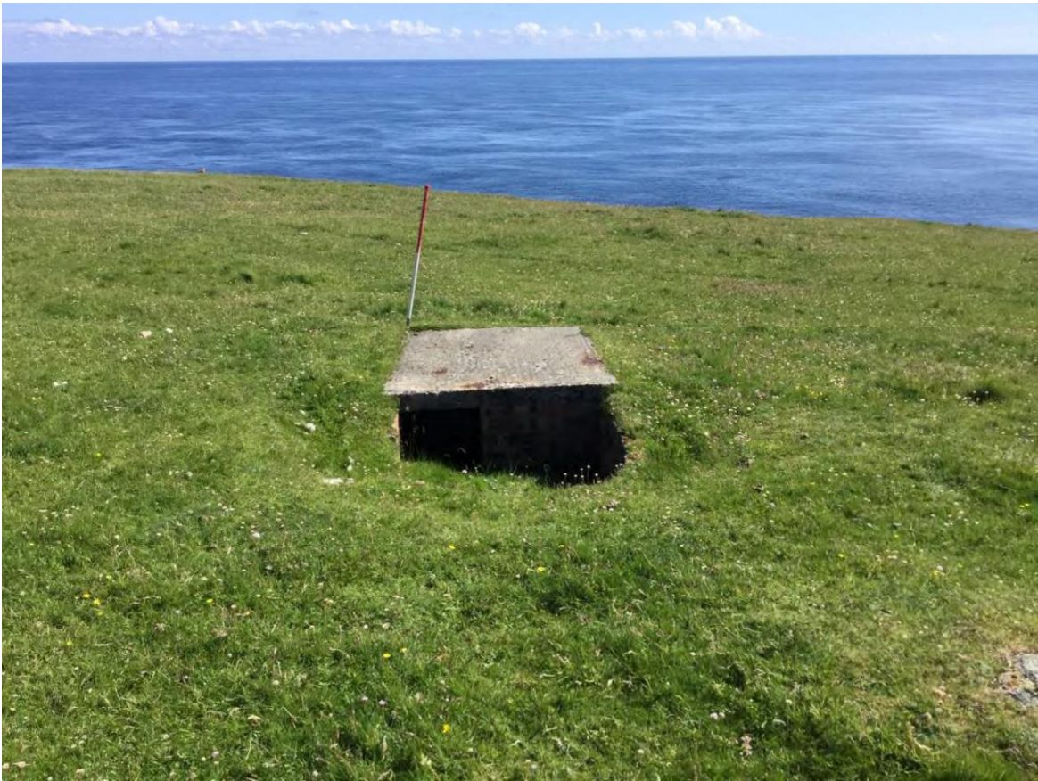
Plate 131: East facing view of probable light gun emplacement (Site 263)