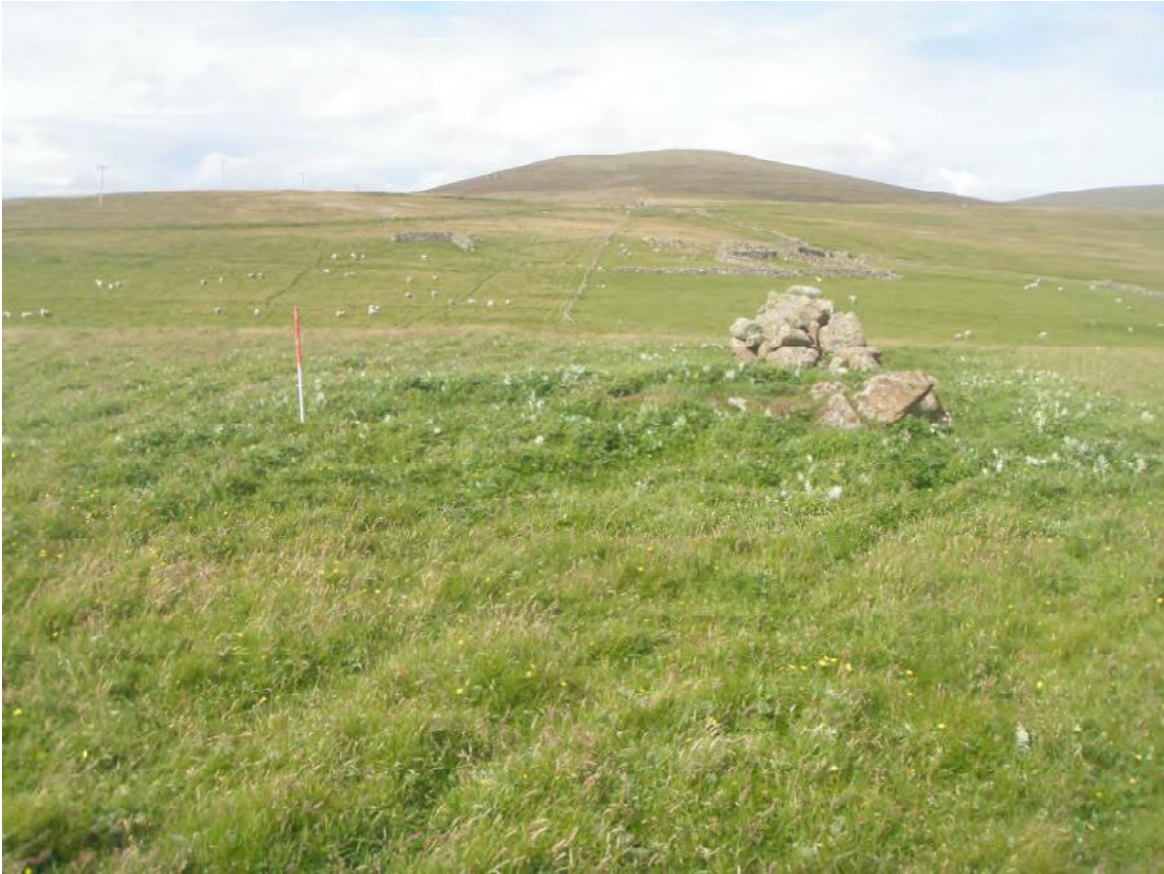
Plate 59: West facing view of a dry stone structure (Site 75) within a field system. The structure (Site 75) is located within the Scheduled Monument of Inner Skaw (centred Site 2) which can be seen in the rear ground