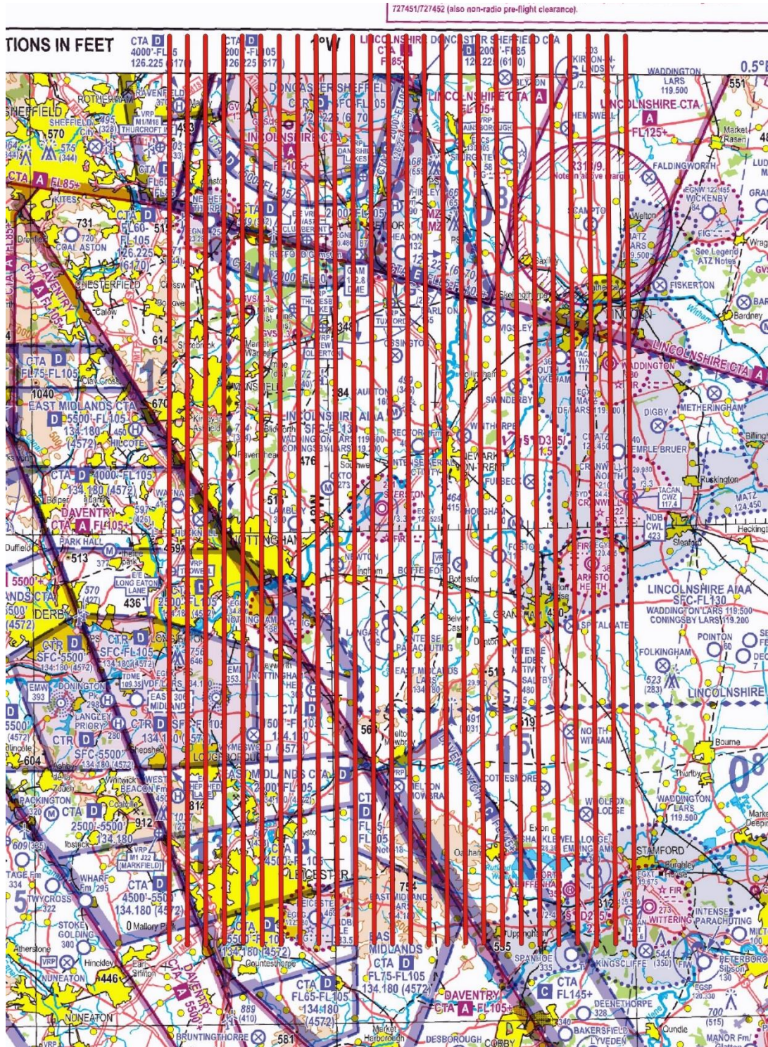
Chart 1 – 100K Grid Option

30. Charts highlighting the area of operation are shown below. These are for illustrative purposes only and not for operational planning. Runs shown do not include procedural ~5nm turn to position for each survey leg.