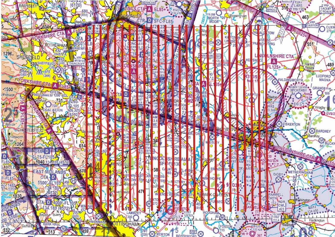
Chart 3 - 50K Grid Option Matched Orientation