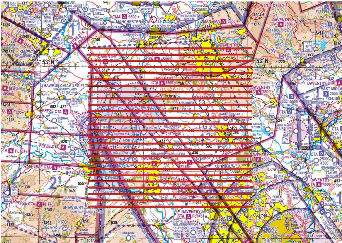
Chart 5 - 50K Grid Option (Opposite Orientation)