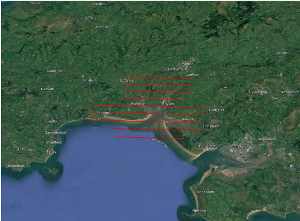
Chart 2 – Overlay on Aeronautical Chart