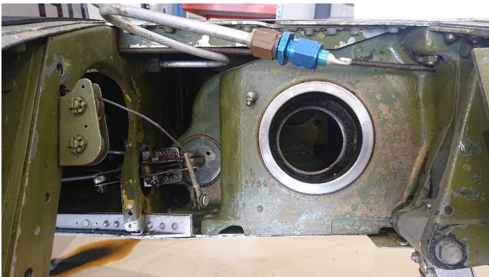
Figure 2: Wing casting and pivot shaft bushes