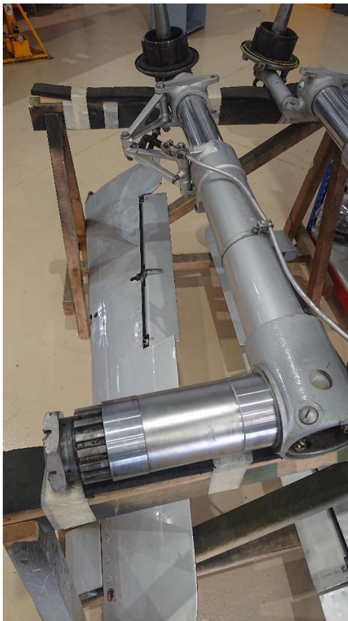
Figure 1. Main Landing Gear and pivot shaft