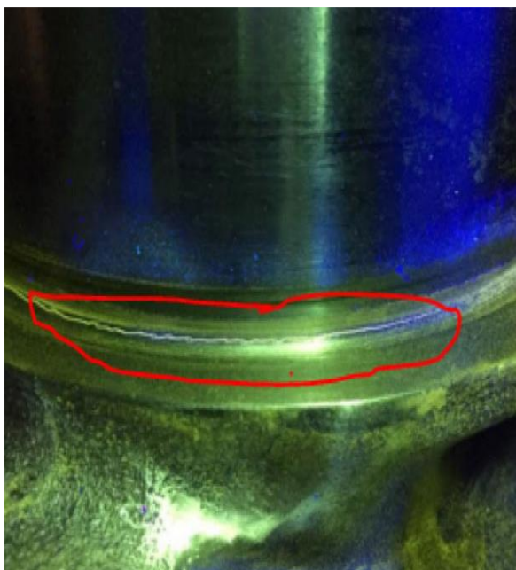
Figure 4: Pivot shaft cracking-MPI inspection