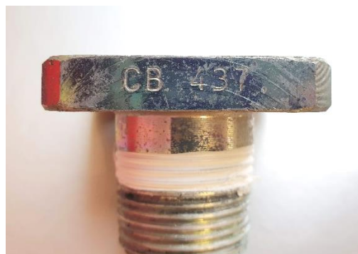
Figure 4 - Hand Stamped Flanged Adaptor