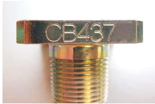
Figure 2 - Machine Engraved Flanged Adaptor

Affected Flanged Adaptors can be alternatively identified by the presence of machine engraved part numbers. Below figure 2 is an example of an affected machine engraved Flanged Adaptor.