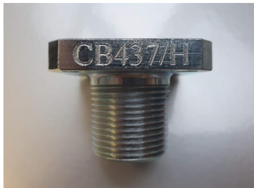
Figure 3 - Replacement Flanged Adaptor 'H'

The above machined engraving must not be confused with hand stamped part numbering. Flanged Adaptors identified with hand stamped markings are unaffected. Below figure 4 is an example of an unaffected hand stamped Flanged Adaptor.