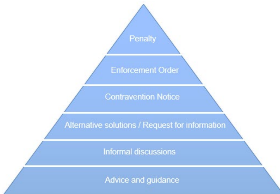
Figure B1 – Stages of Enforcement (illustrative only)