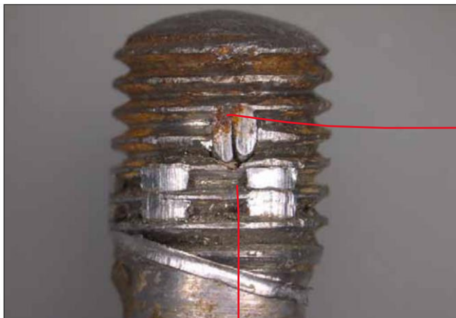
Figure 25: Thread remnants on rudder lower hinge pin