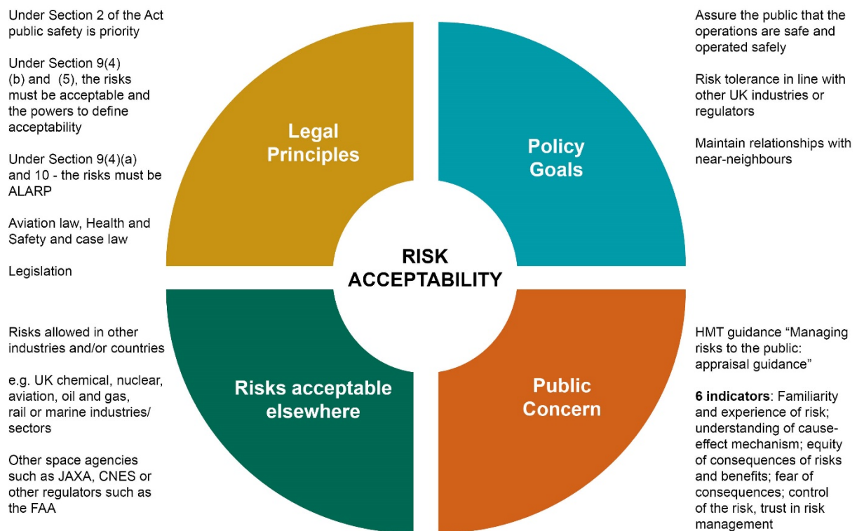
Figure 1 - Factors to be considered when determining risk acceptability

This framework leads to six principles which form the basis of the regulator's decision-making process for determining if the risk is acceptable. It is recognised that the relative importance of these principles (and the supporting evidence) may vary over time and they will be kept under review.