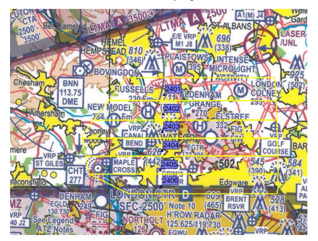
Chart 1 Overview