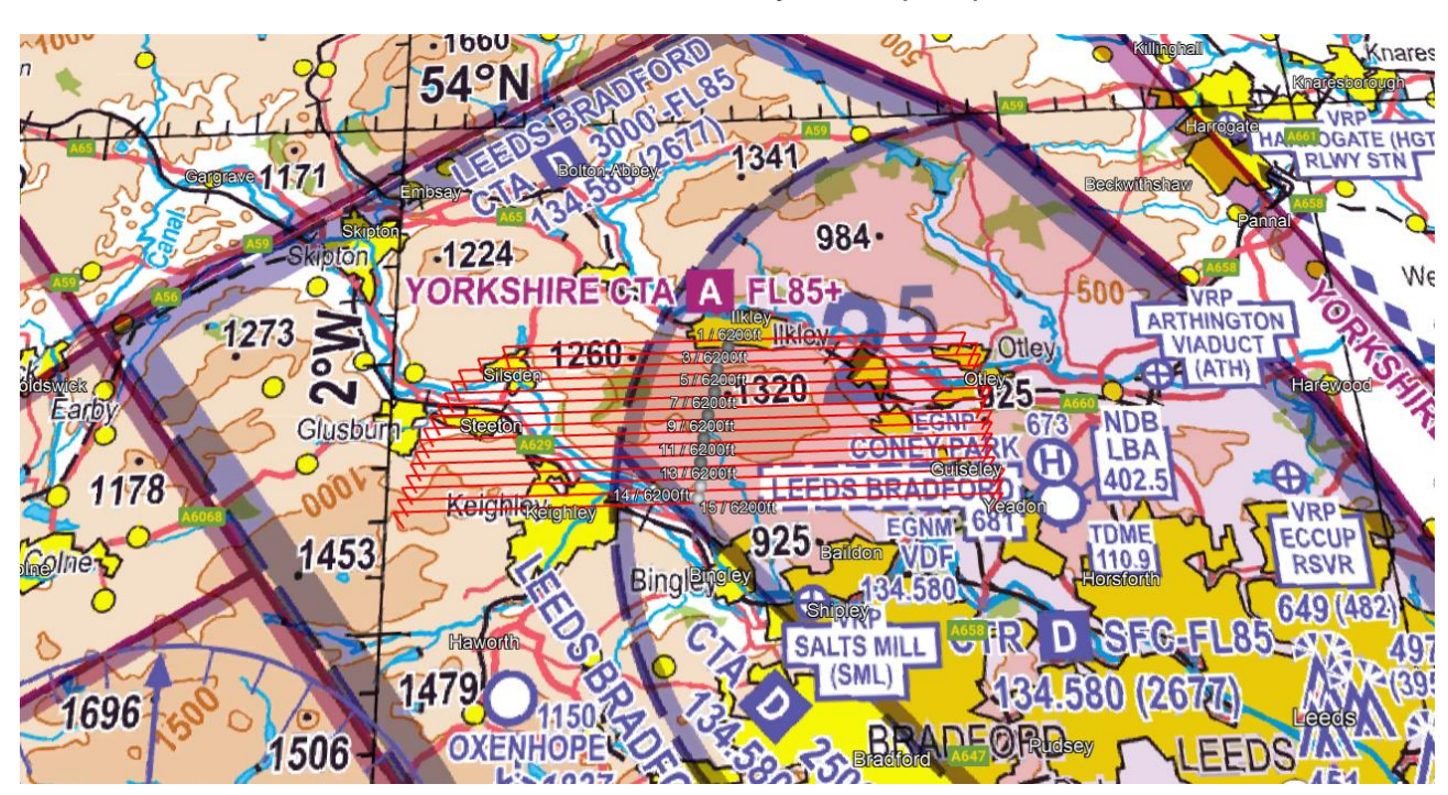
Chart 1 - Aerial Survey Area 1 (2301)

30. Charts highlighting the area of operation are shown below. These are for illustrative purposes only and not for operational planning.