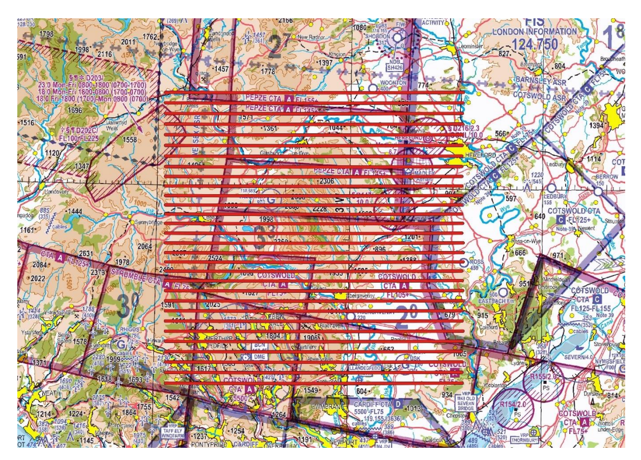
Chart 5 50K Grid Option (Unmatched Orientation)