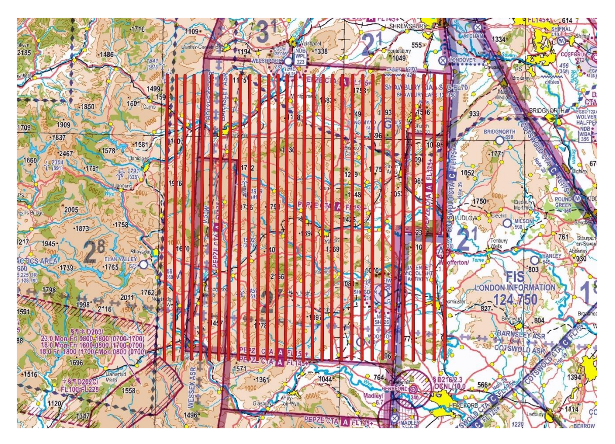
Chart 3 50K Grid Option (Matched Orientation)