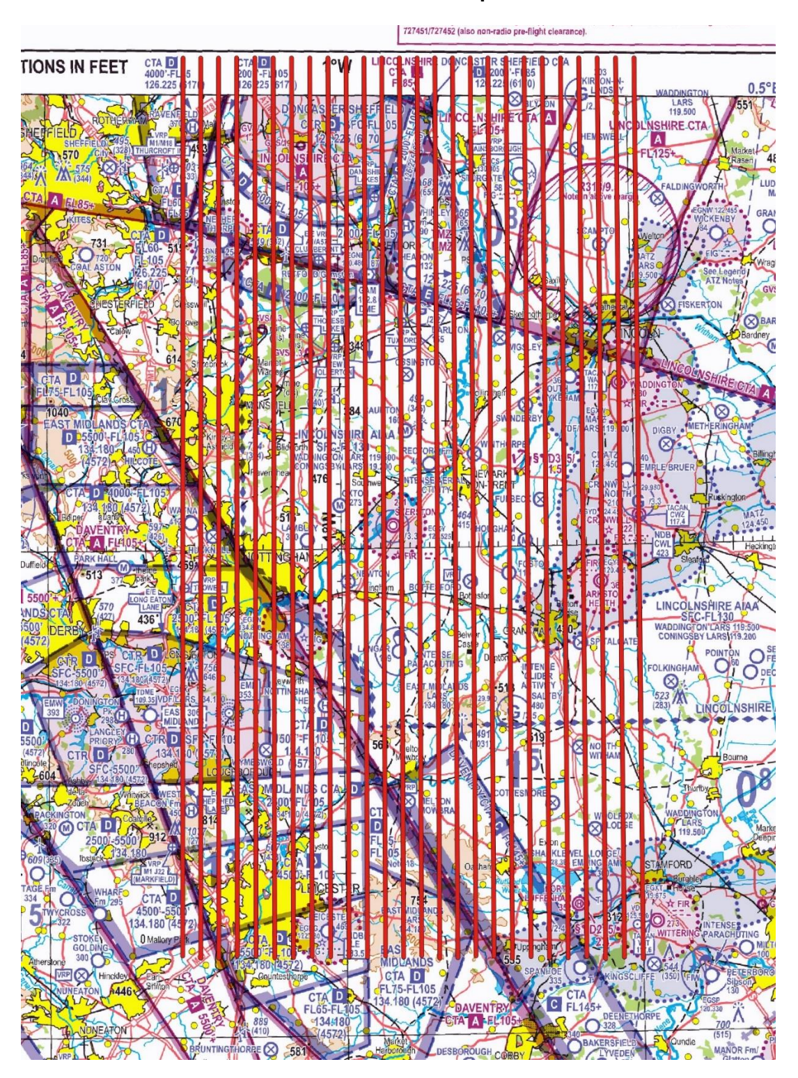
Chart 1 - 100K Grid Option

30. Charts highlighting the area of operation are shown below. These are for illustrative purposes only and not for operational planning. Runs shown do not include procedural ~5nmi turn to position for each survey leg.