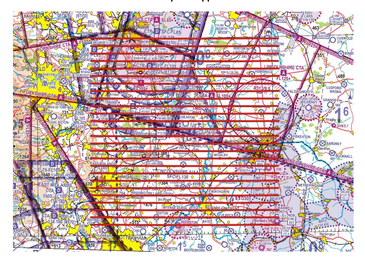
Chart 5 - 50K Grid Option Opposite Orientation