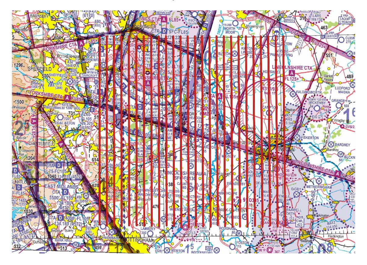
Chart 3 - 50K Grid Option Matched Orientation