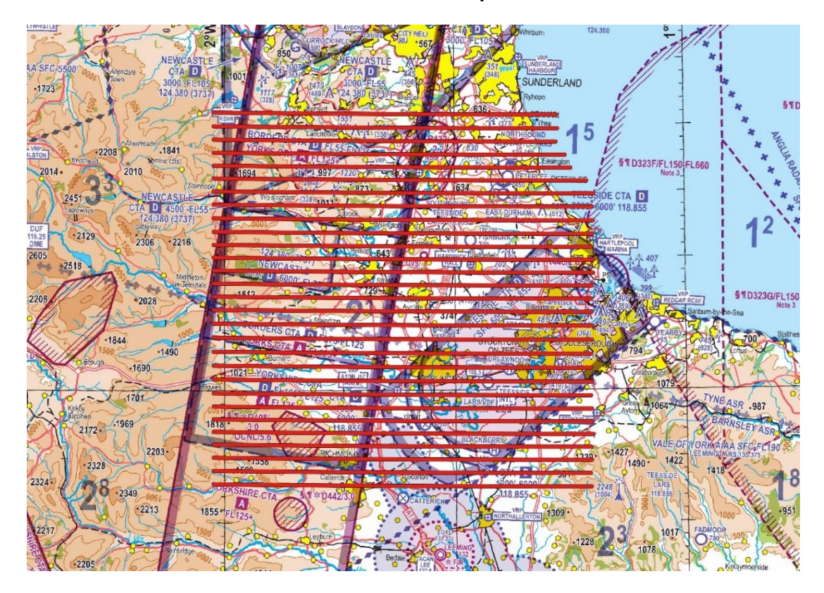
Chart 2 50K Grid Option