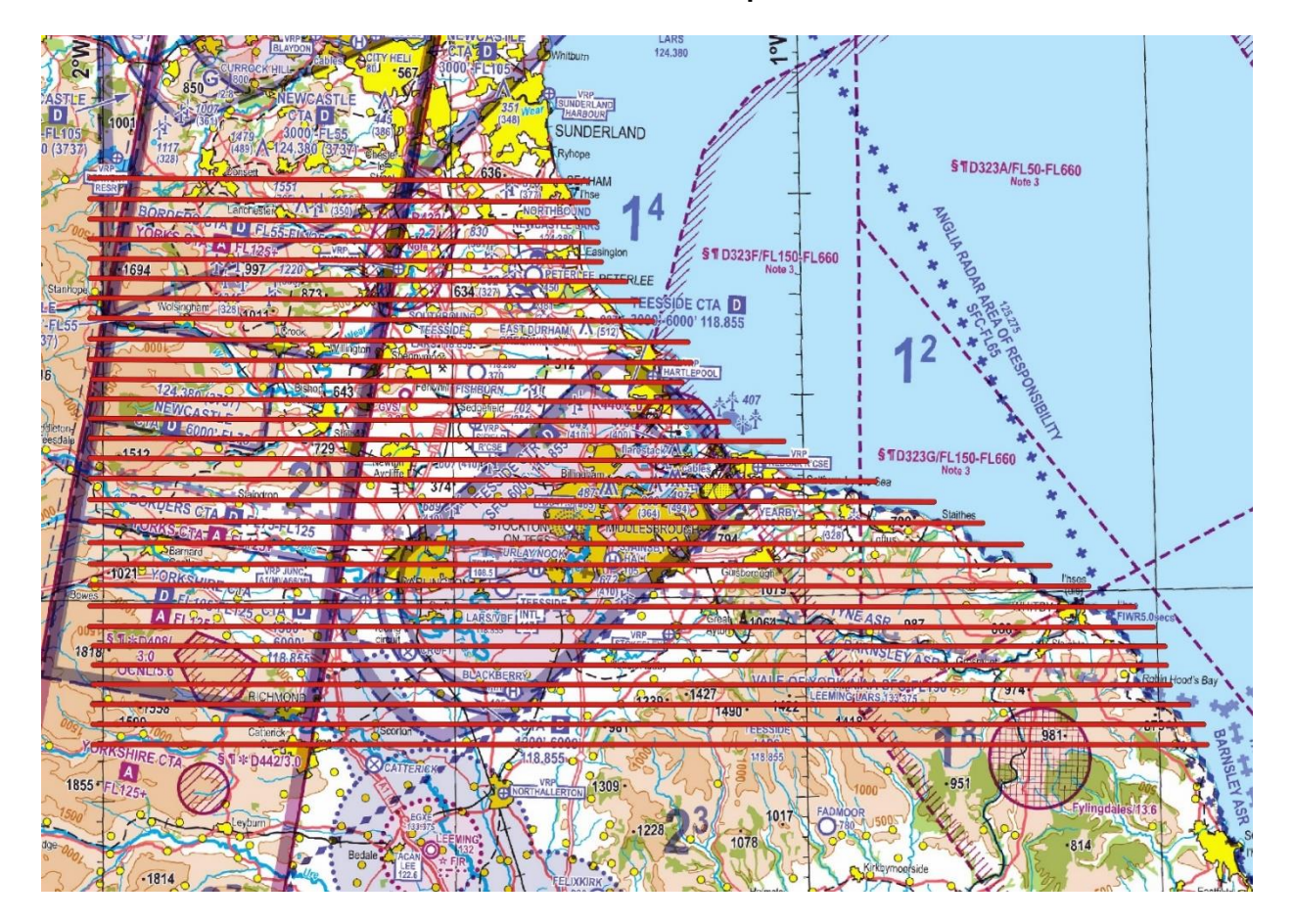
Chart 1 100K Grid Option

30. Charts highlighting the area of operation are shown below. These are for illustrative purposes only and not for operational planning. Runs shown do not include procedural ~5nmi turn to position for each survey leg.