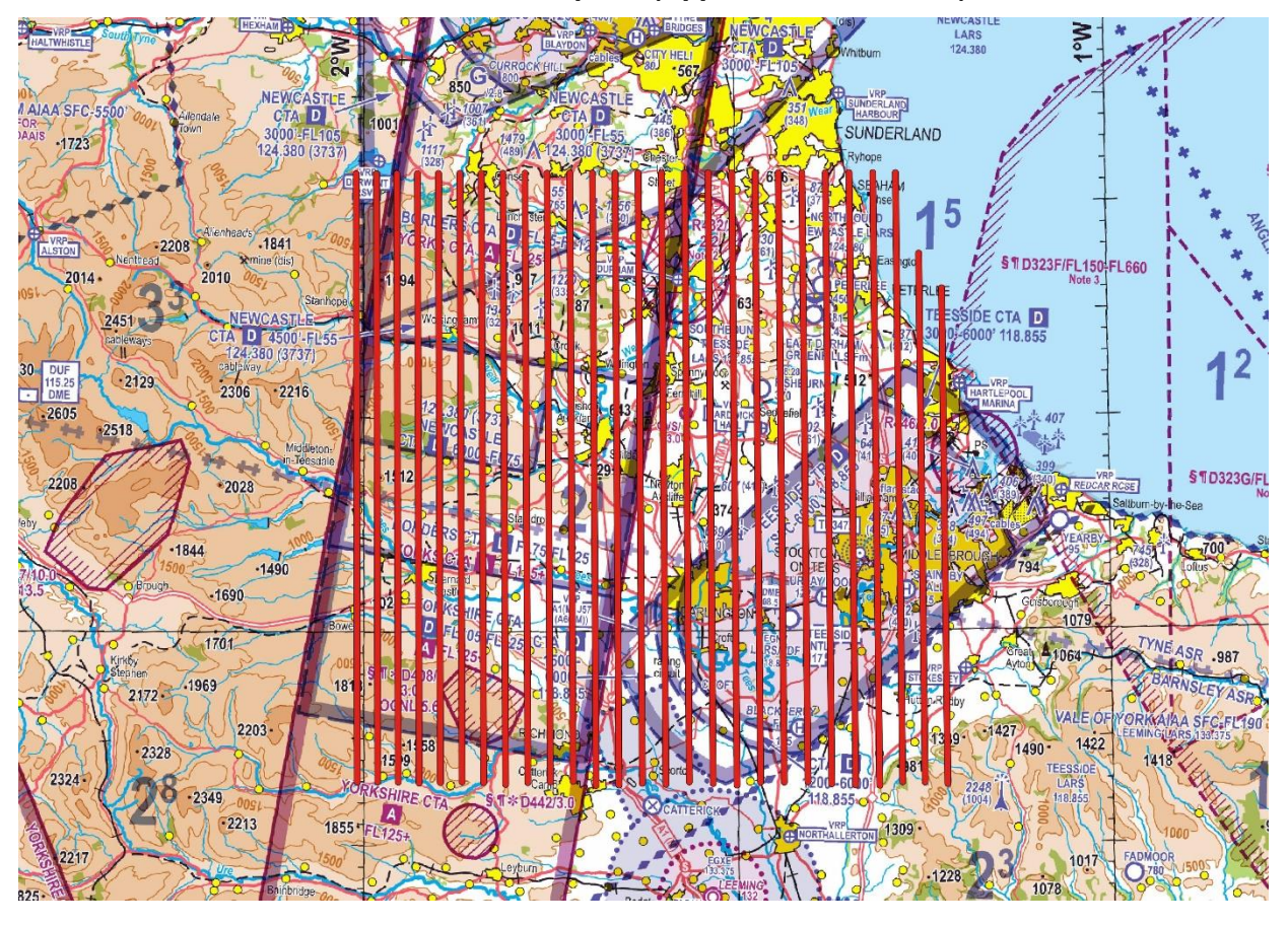
Chart 4 50K Grid Option (Opposite Orientations)