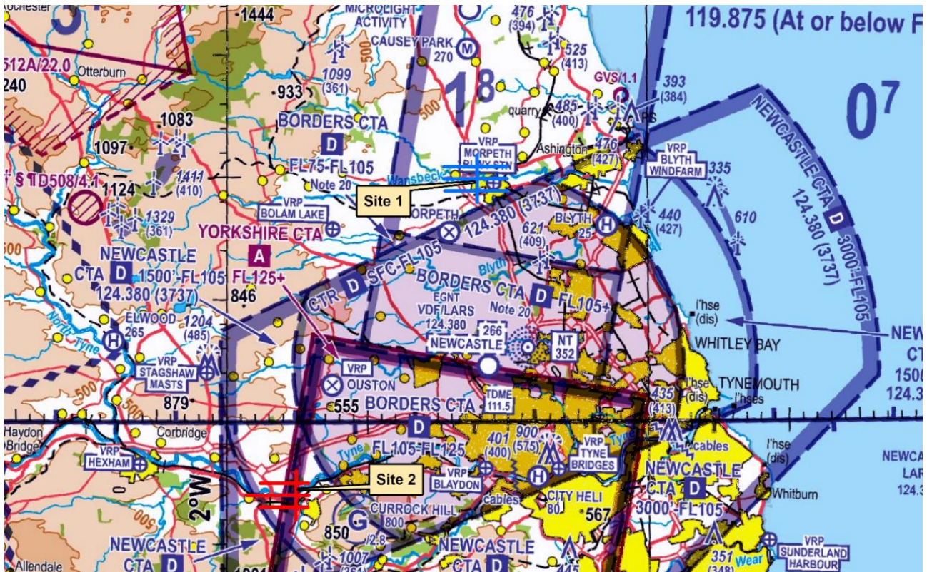
Chart 1 – Overview

31. Charts highlighting the area of operation are shown below. These are for illustrative purposes only and not for operational planning.