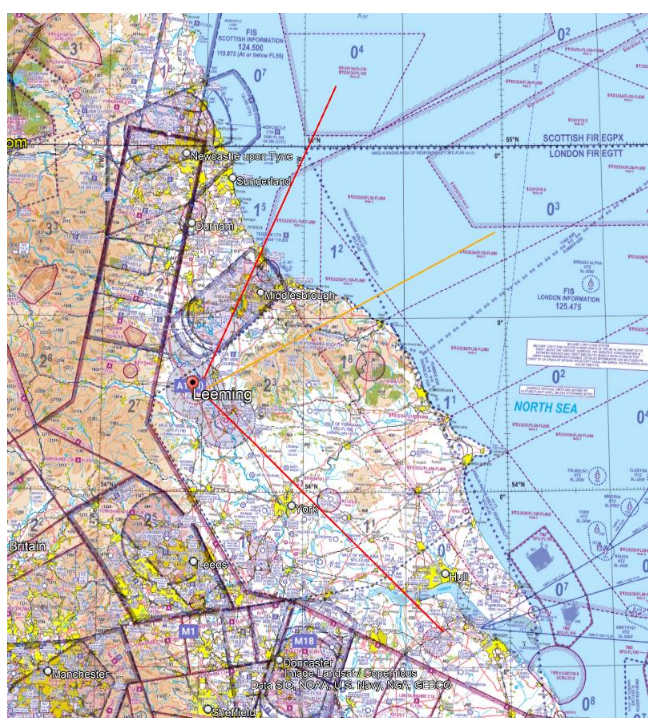
Chart 2 Primary Radials Red, Secondary Radial Orange