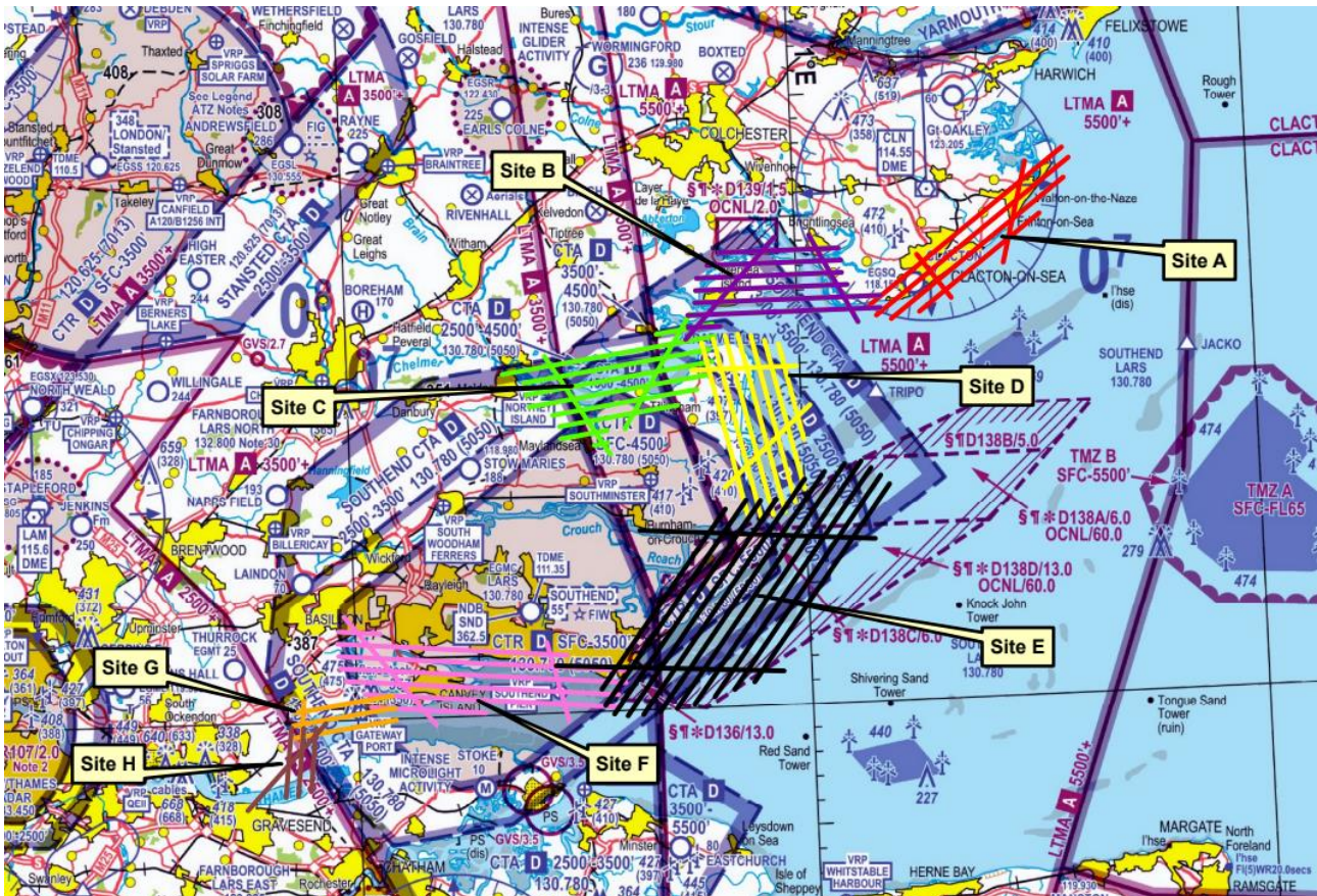
Chart 1 – Overview

31. Charts highlighting the area of operation are shown below. These are for illustrative purposes only and not for operational planning.