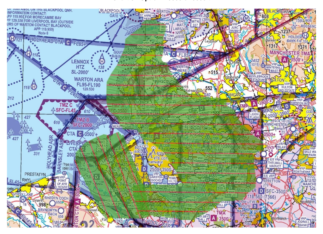
Chart 3 - Option 2 3000 or 5000ft