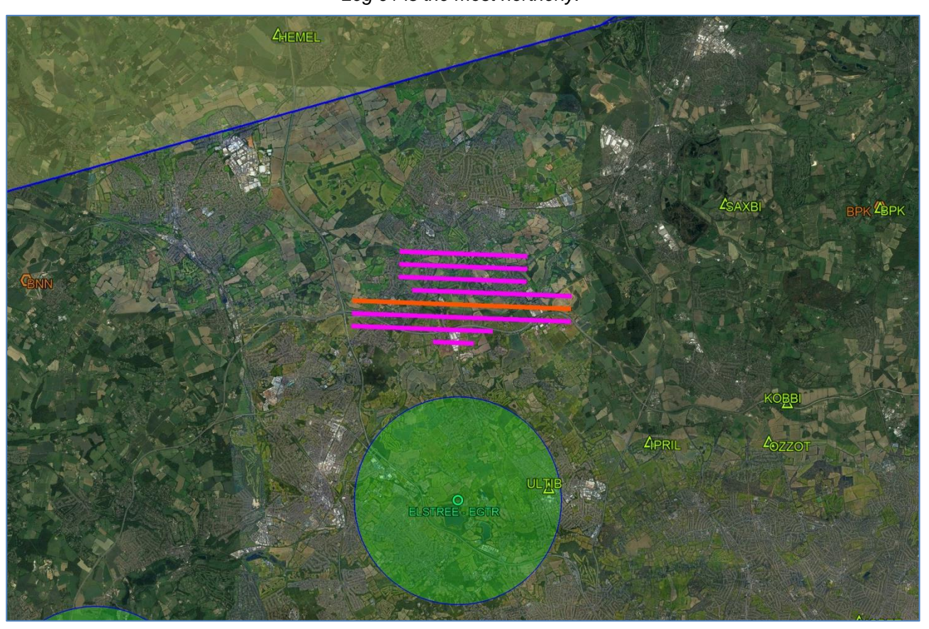
Charts 2 & 3 – Close In Leg 01 is the most northerly.