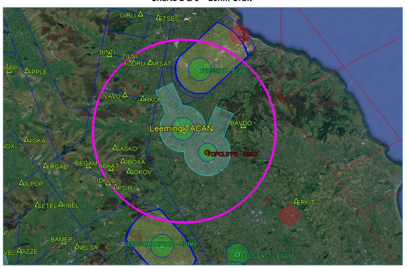
Charts 2 & 3 - 20nm Orbit