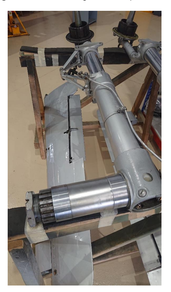
Figure 1. Main Landing Gear and pivot shaft