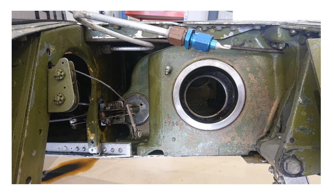
Figure 2: Wing casting and pivot shaft bushes