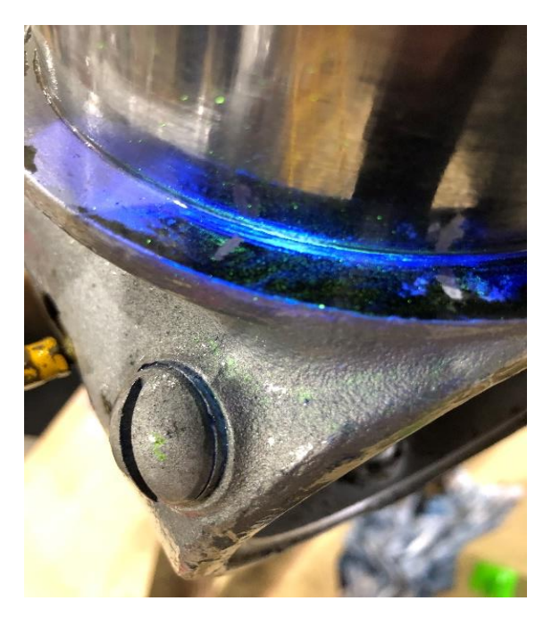
Figure 5: MPI inspection of pivot shaft