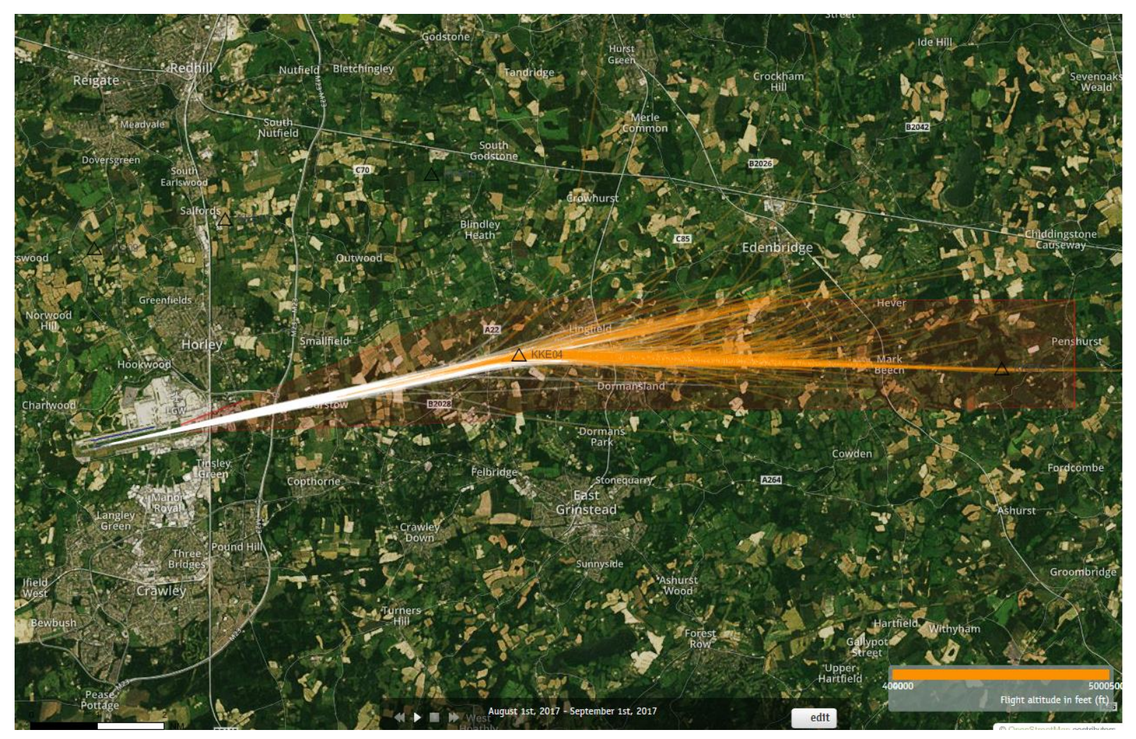
Orange plots show the points at which an aircraft was between 4000 and 5000ft altitude.