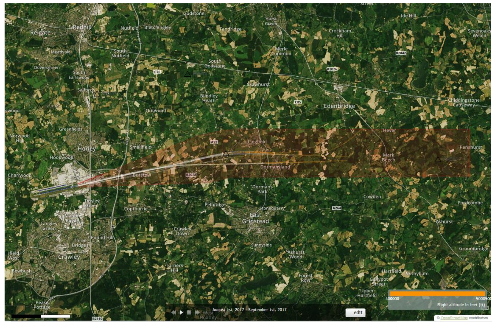
Orange plots show the points at which an aircraft was between 4000 and 5000ft altitude.