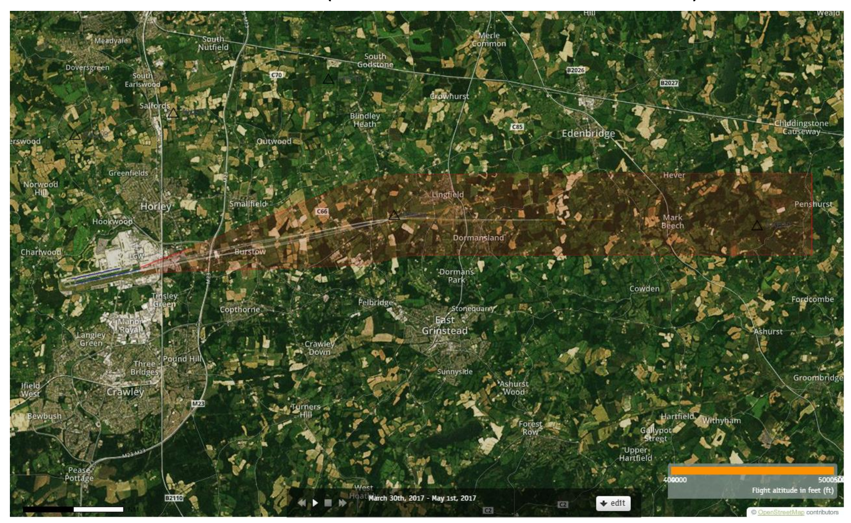
Orange plots show the points at which an aircraft was between 4000 and 5000ft altitude.