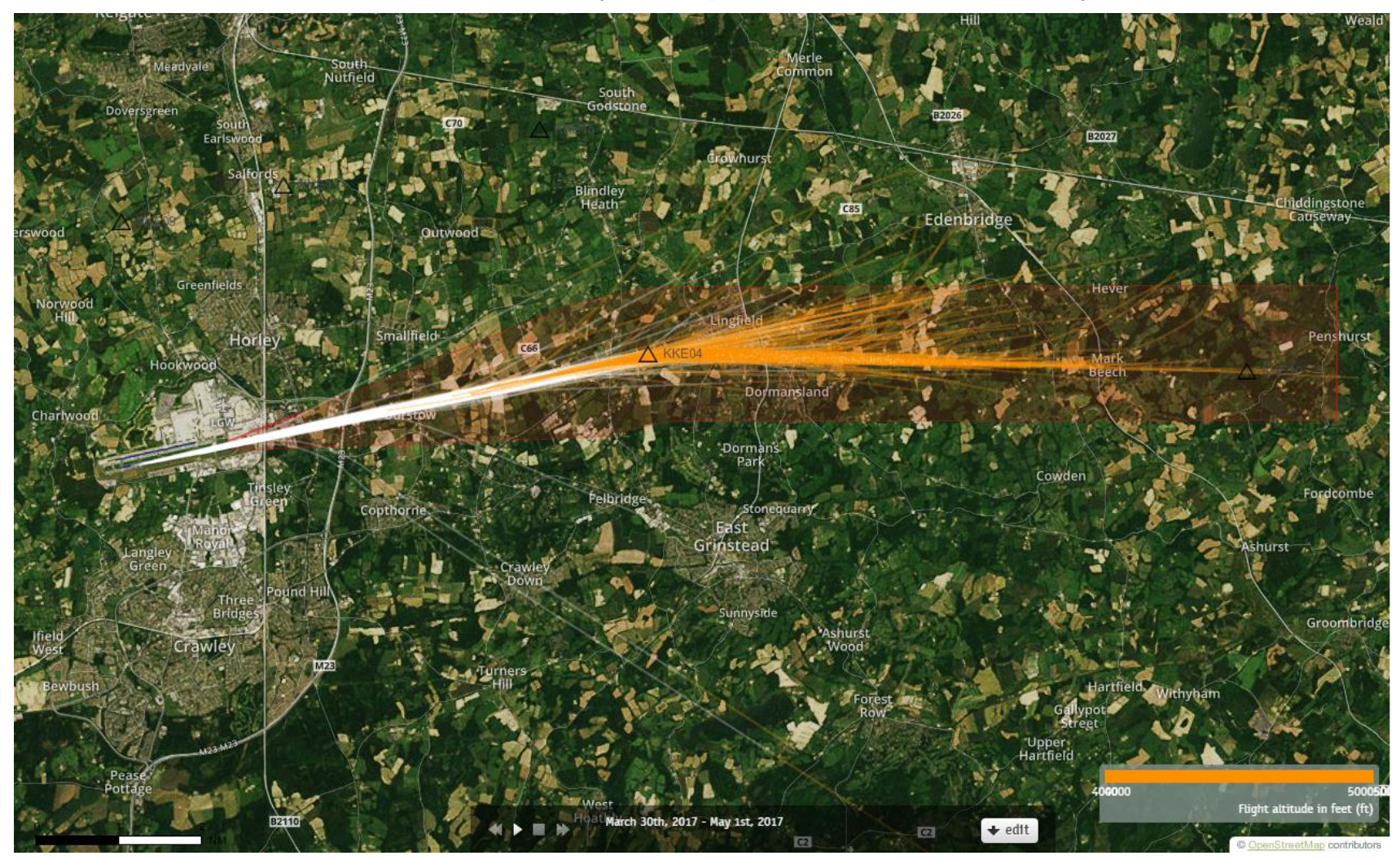
Orange plots show the points at which an aircraft was between 4000 and 5000ft altitude.