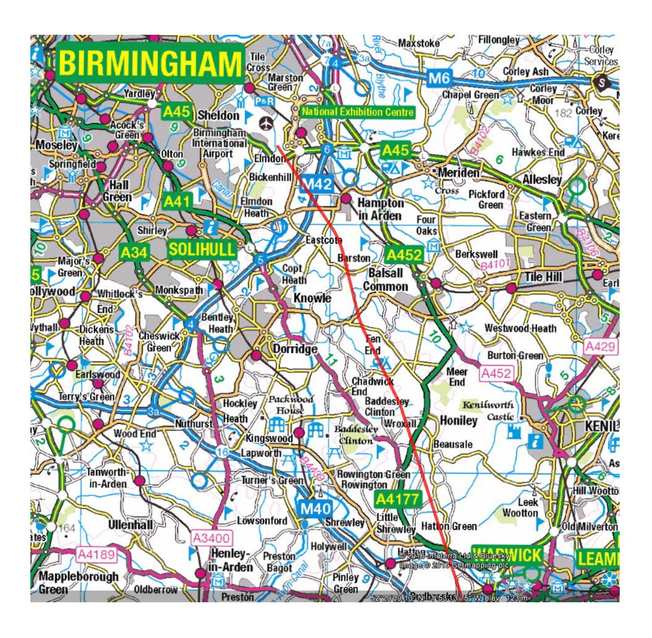
Diagram showing the nominal track of the new CPT 2Y SID (in red)