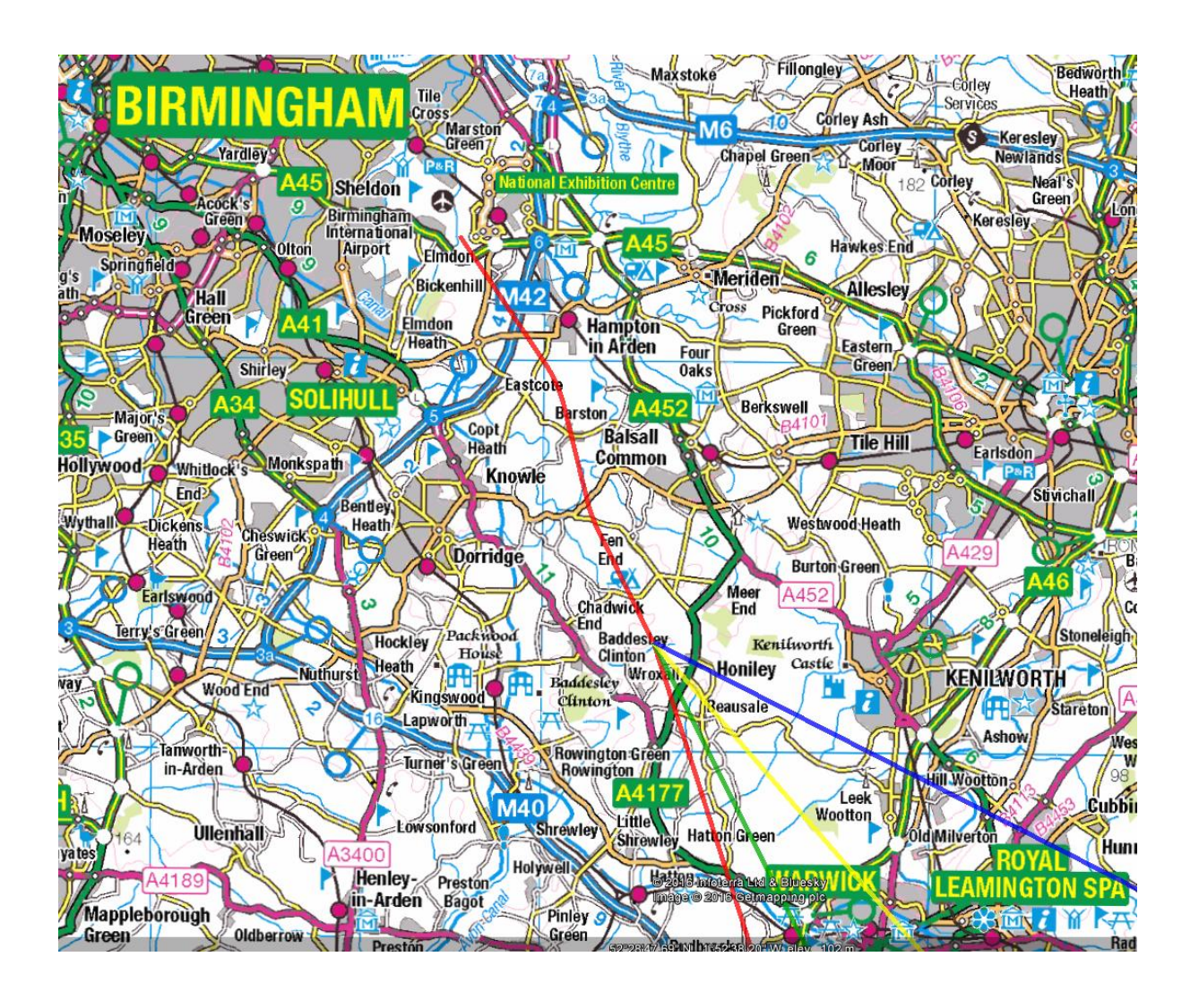
Diagram showing nominal tracks of the new 2Y SIDs: DTY (Blue), WCO (Yellow), COWLY (Green) and CPT (Red)