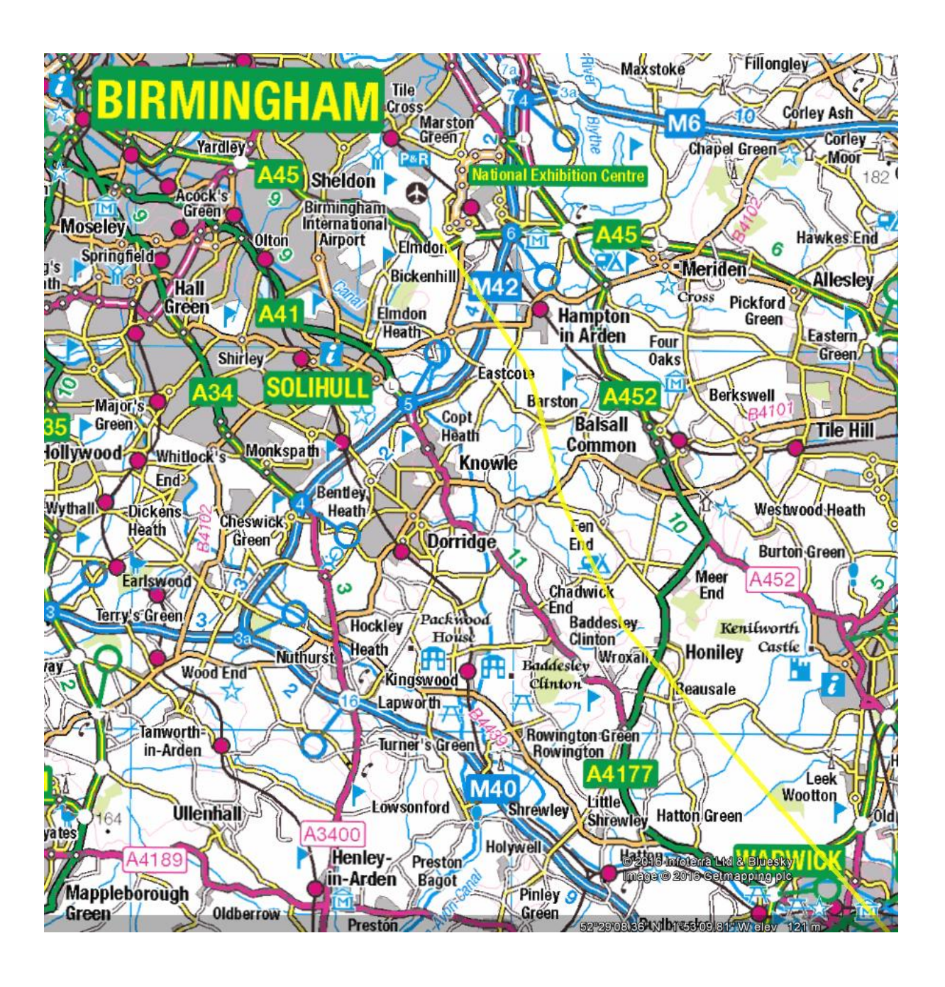
Diagram showing the nominal track of the new WCO 2Y SID (in yellow)