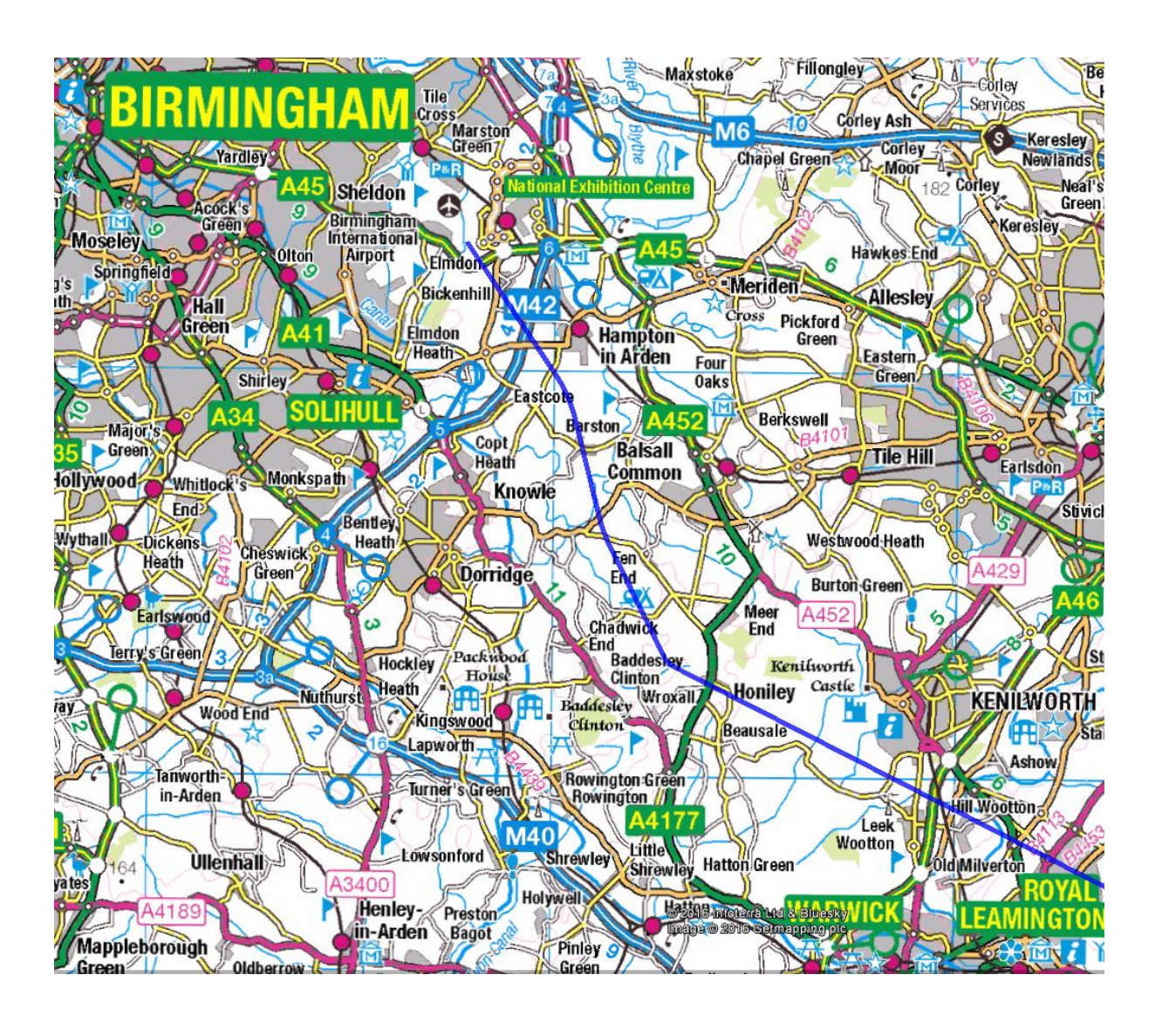
Diagram showing the nominal track of the new DTY 2Y SID (in blue)